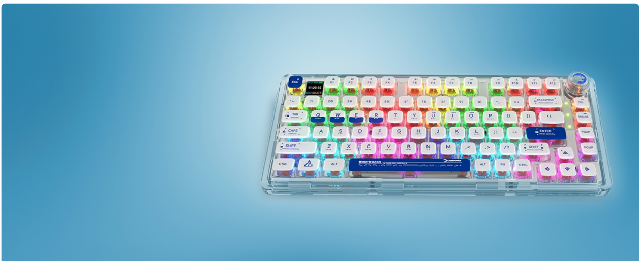
Image 3.1: Illustration of the keyboard's triple connectivity modes: USB-C wired, 2.4G wireless (FN+R), and Bluetooth (FN+Q/W/E).