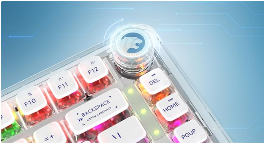
Image 4.3: Detailed view of the multi-function knob, illustrating its integration and control capabilities for the LCD display and audio.