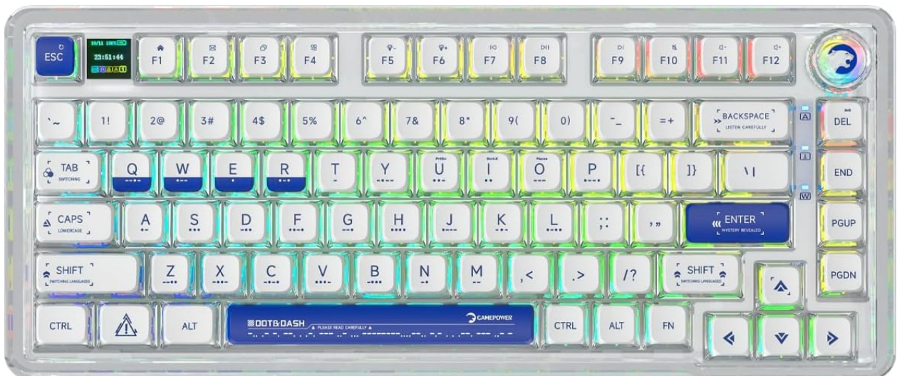
Image 1.1: Top-down view of the GAMEPOWER Gasket Pro 75% Mechanical Gaming Keyboard with RGB backlighting enabled.

Thank you for choosing the GAMEPOWER Gasket Pro 75% Mechanical Gaming Keyboard. This manual provides detailed instructions for setting up, operating, and maintaining your keyboard. Featuring a compact 75% layout with 81 keys, triple connectivity modes (Wired, 2.4GHz, Bluetooth 5.1), a customizable LCD screen, RGB backlighting, and durable Blue switches, this keyboard is designed for enhanced productivity and gaming performance.