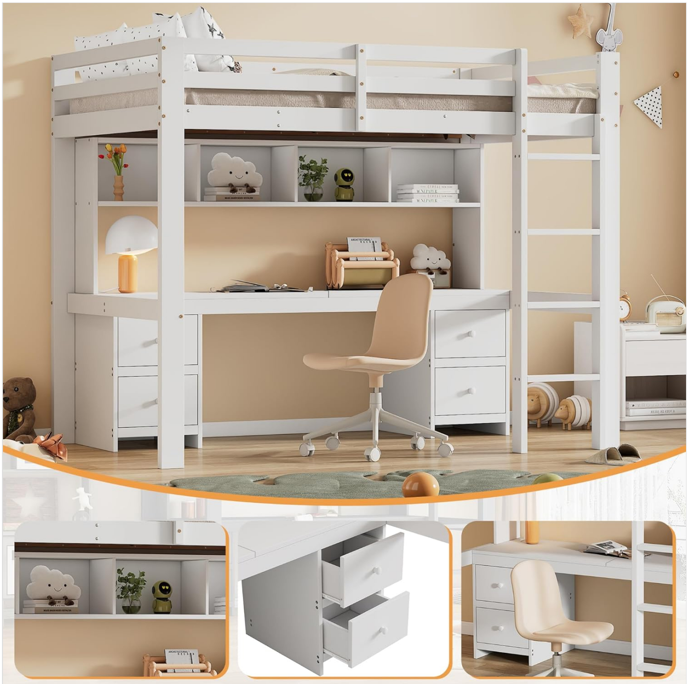
Figure 4.2: Front view of the Moimhear Loft Bed, showing the desk area with integrated shelves and drawers.