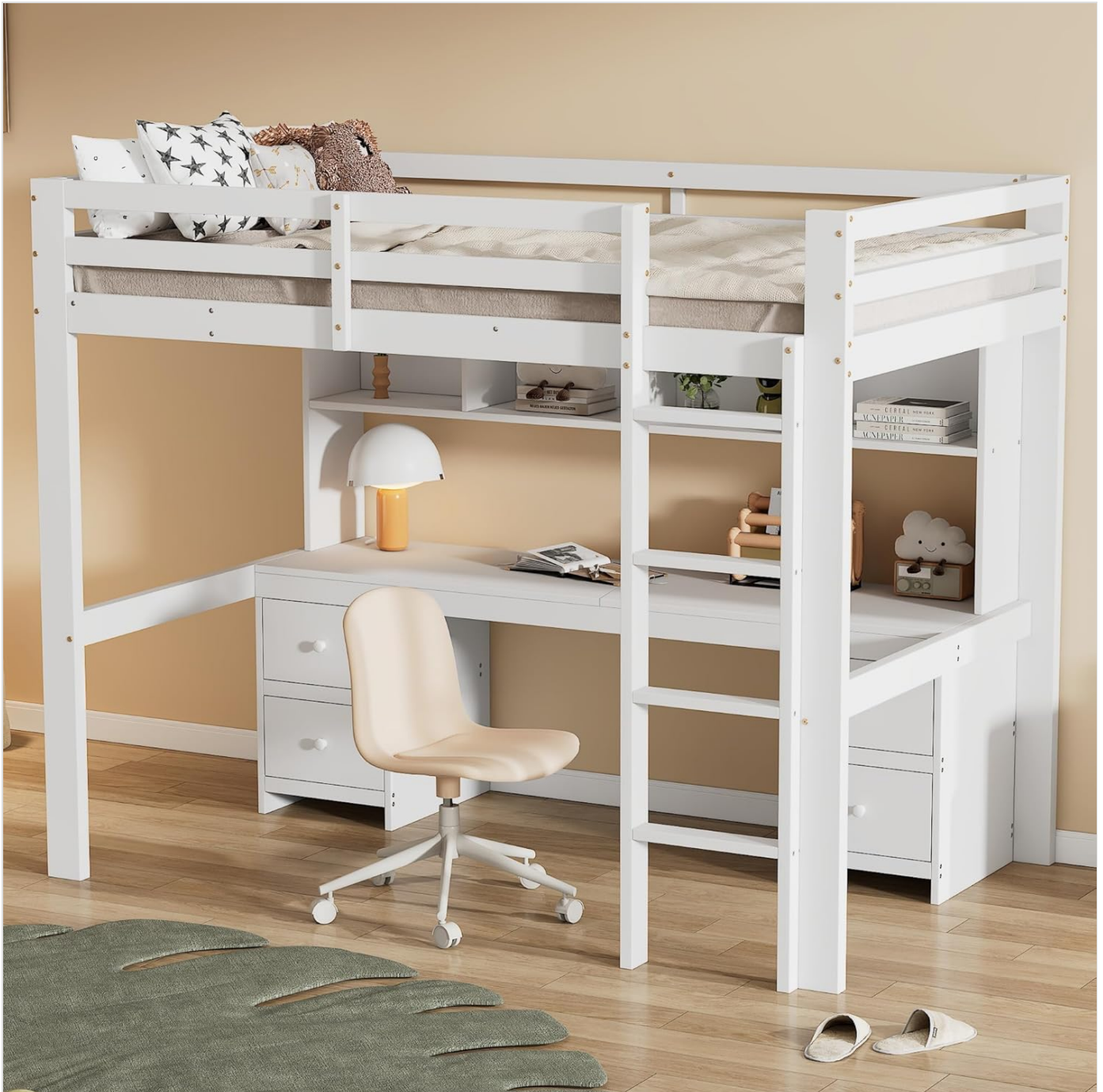
Figure 2.1: Overall view of the Moimhear Loft Bed in white, showcasing the upper bed, integrated desk, and storage shelves.