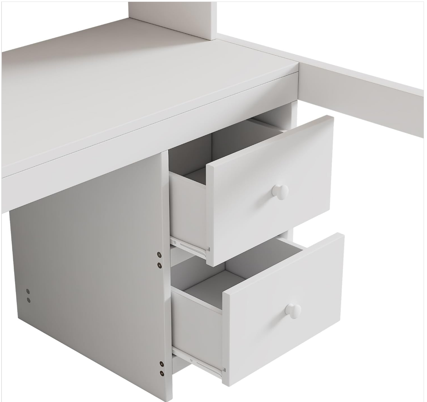
Figure 4.1: Close-up view of the integrated drawers under the desk, demonstrating the storage capability.