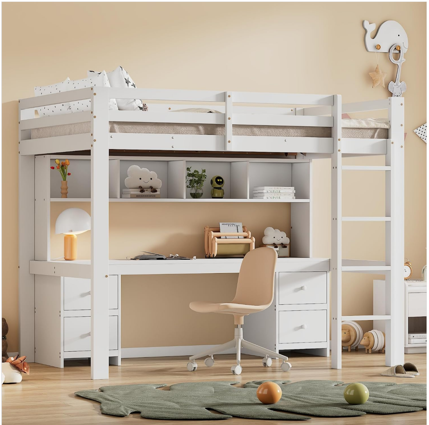
Figure 2.2: Front view of the Moimhear Loft Bed, highlighting the desk area and storage drawers.