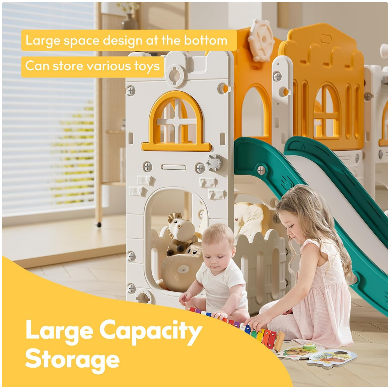
Image 4.3: Two children playing near the playset's large storage area, which can be used to store various toys.