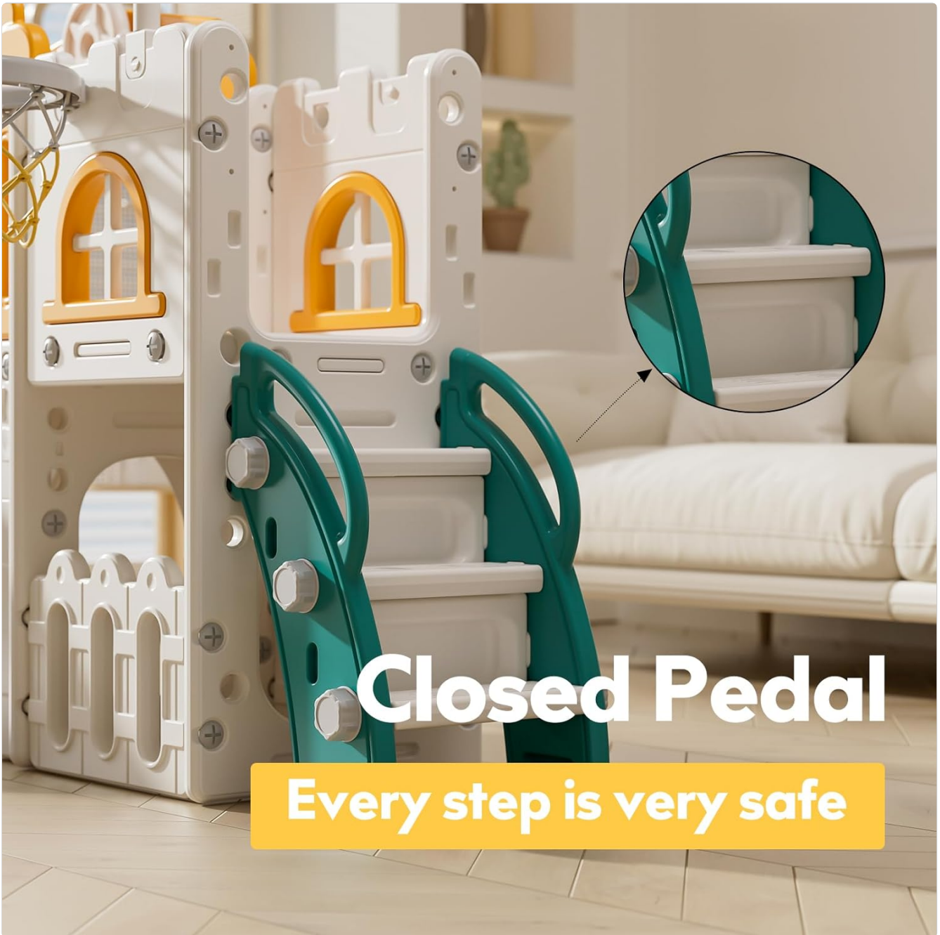
Image 4.2: A detailed view of the playset's closed pedal steps, designed for enhanced safety and stability during climbing.