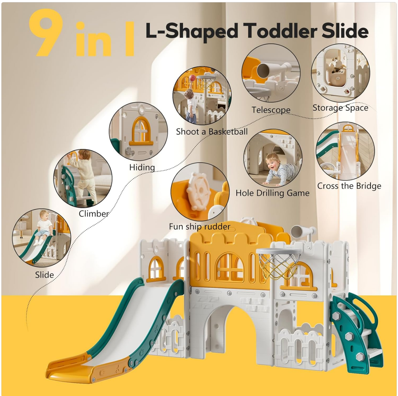
Image 2.1: Overview of the Baotree 9-in-1 Toddler Slide Playset, highlighting its various play features including a slide, climber, hiding space, basketball hoop, telescope, storage, bridge, and rudder.