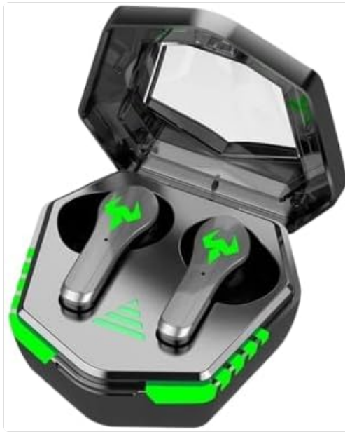
Figure 4.1: N35 Earbuds and Charging Case. The earbuds feature a sleek design with green accents, housed within a transparent-lidded charging case that displays battery status.