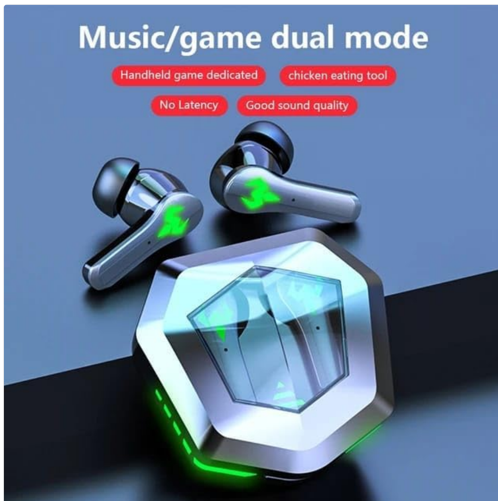
Figure 6.1: Music/Game Dual Mode. This image emphasizes the low latency and high sound quality for both music listening and gaming.