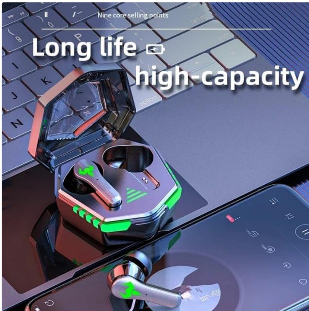
Figure 5.1: Charging the N35 Earbuds. The image suggests the earbuds' long battery life, suitable for extended use with devices like laptops and smartphones.