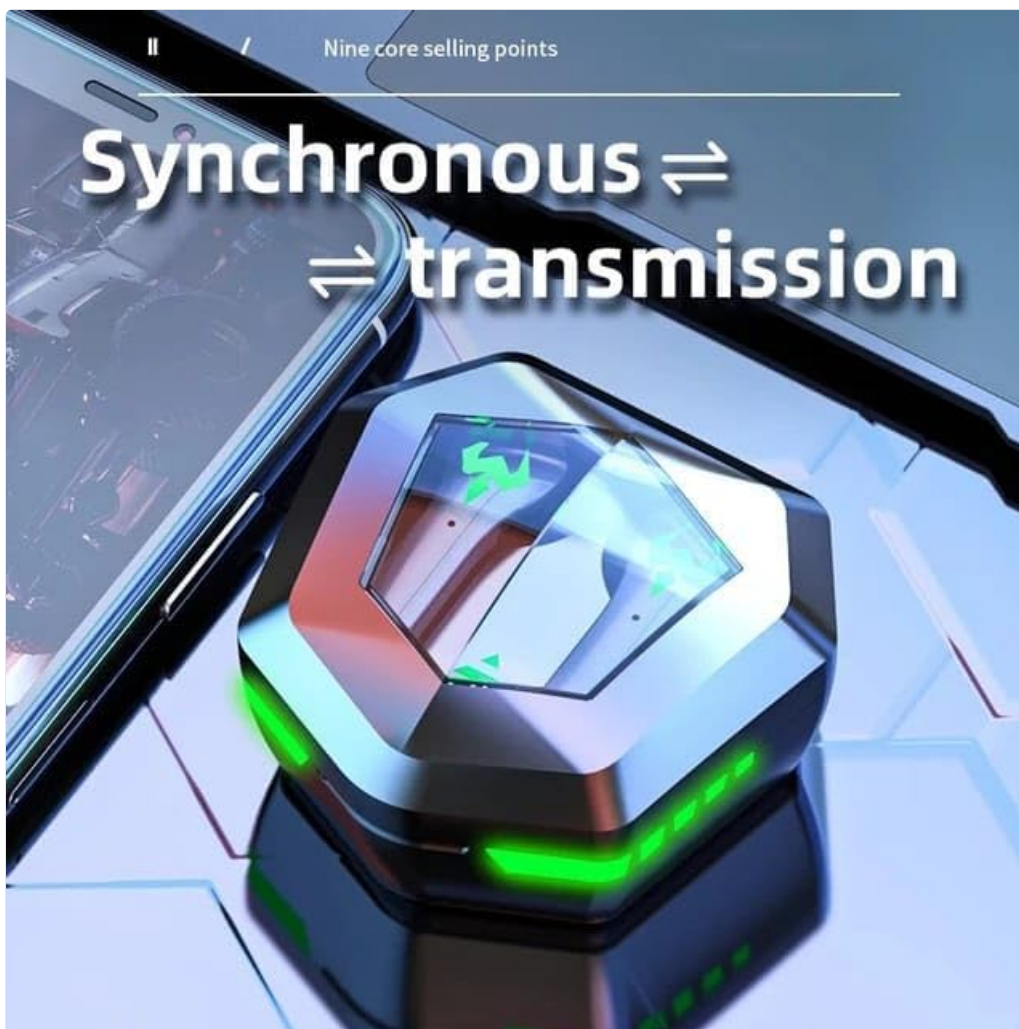
Figure 5.2: Synchronous Transmission. The closed case indicates the earbuds are ready for seamless connection and audio transmission.