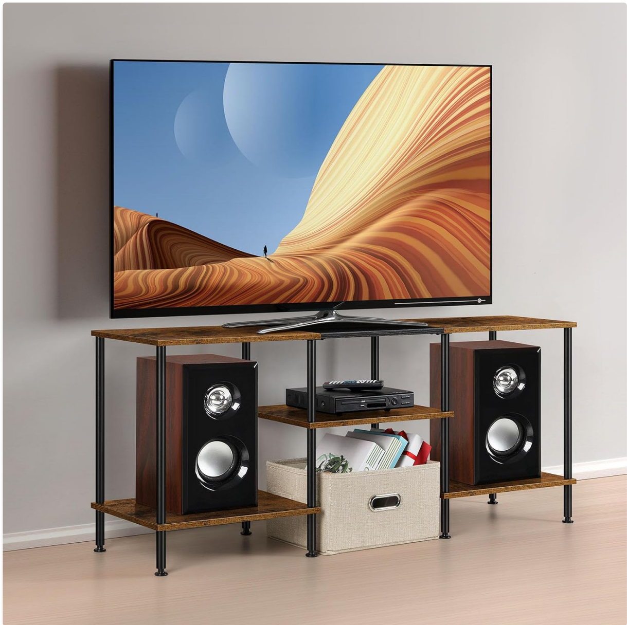
Image: The Luplom 50-inch TV Stand in a rustic brown finish, supporting a television and flanked by speakers.