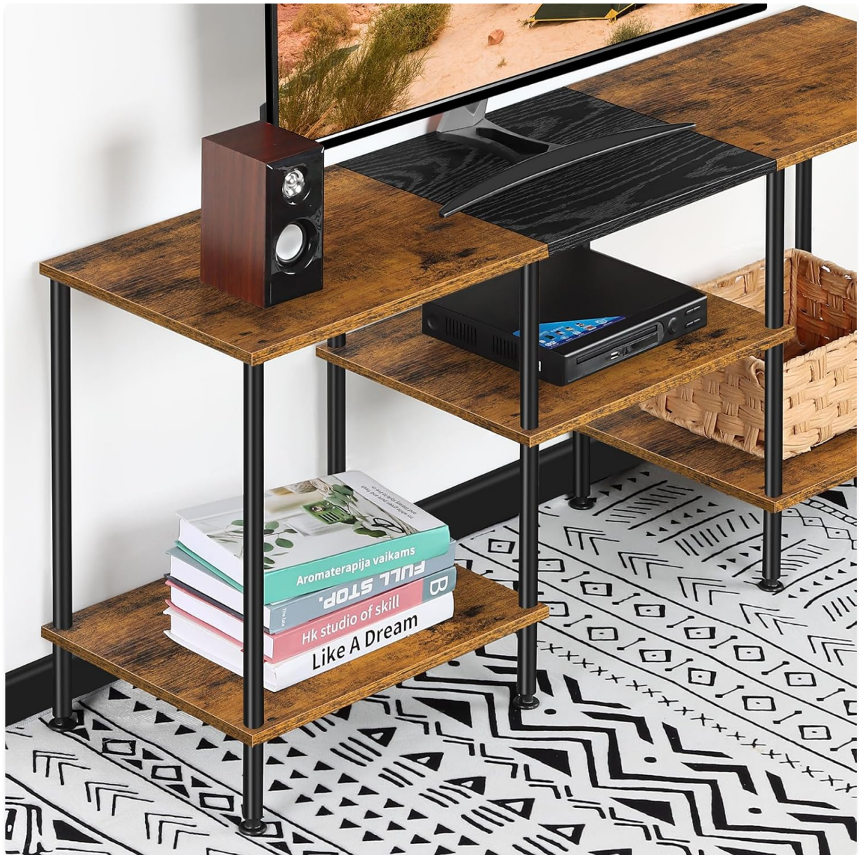
Image: Detailed view of the three-tier storage shelves, showcasing their capacity for various media devices and decorative items.