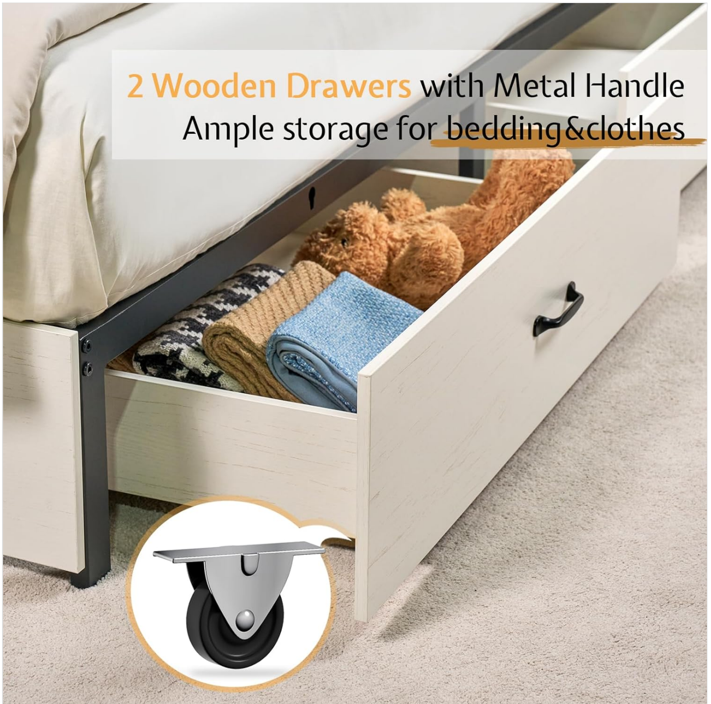
Image: Close-up of one of the under-bed wooden drawers, showing its capacity and the wheels for easy movement.