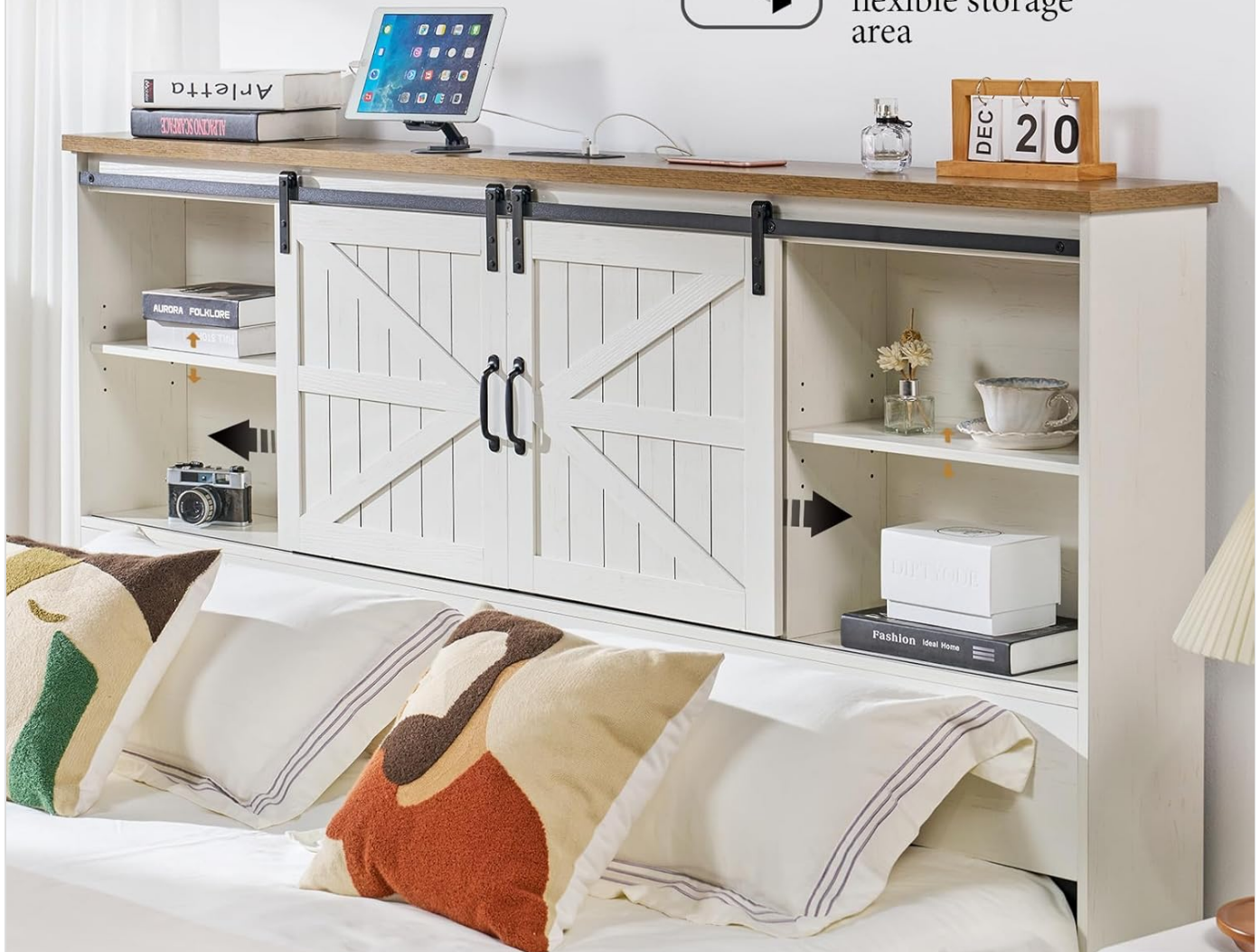
Image: The bookcase headboard with a close-up on the integrated charging station, showing the AC outlets and USB ports.