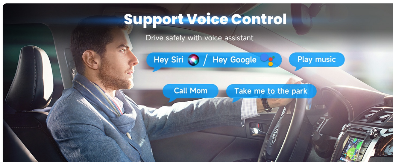
Figure 10: A driver using voice commands like "Hey Siri" or "Hey Google" to control functions, emphasizing safe driving with the Spedal CL797 adapter.

Utilize your car's voice assistant (Siri for CarPlay, Google Assistant for Android Auto) for hands-free control. This feature enhances driving safety by allowing you to manage navigation, make calls, and play music using voice commands.