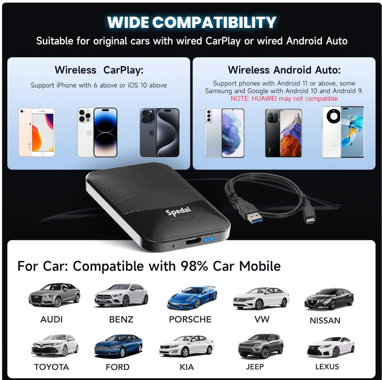
Figure 4: Visual representation of the Spedal CL797's wide compatibility with various car brands and smartphone operating systems.