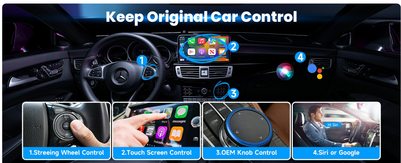
Figure 12: This image highlights the seamless integration of the Spedal CL97 with existing car controls, including steering wheel, touch screen, and OEM knob, along with voice assistant support.