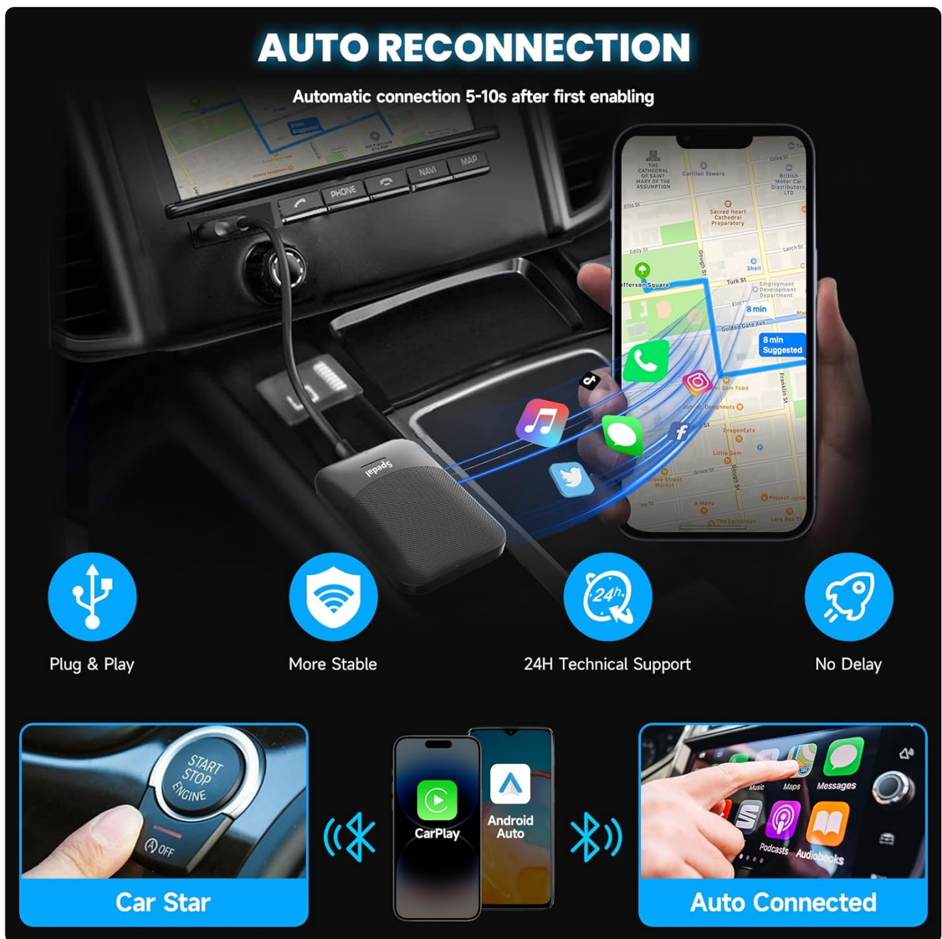
Figure 7: Illustration of the automatic reconnection feature, showing the adapter connecting to a smartphone and displaying CarPlay on the car screen after the car starts.