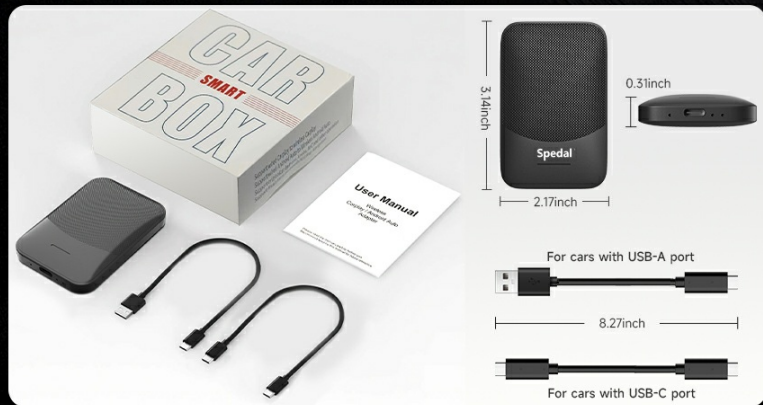
Figure 3: Contents of the Spedal CL797 package, including the wireless adapter, USB-A cable, USB-C cable, and user manual.