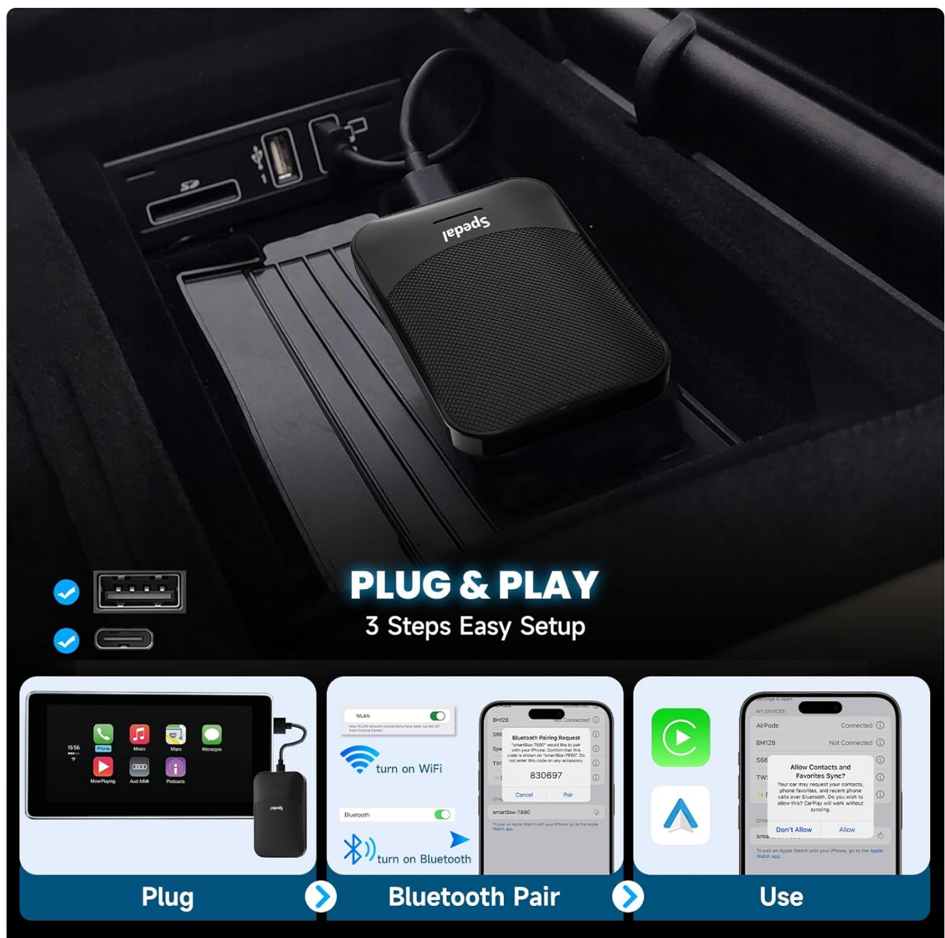
Figure 5: A visual guide illustrating the three easy steps for setting up the Spedal CL797 adapter: Plug, Bluetooth Pair, and Use.