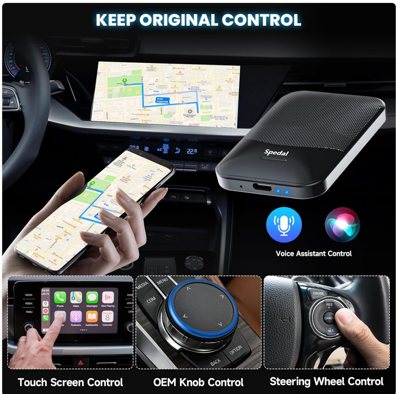
Figure 11: Demonstrates how the Spedal CL97 adapter allows users to retain original car controls such as steering wheel buttons, touch screen, and OEM knobs for interacting with CarPlay/Android Auto.