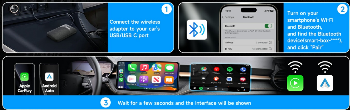
Figure 6: Detailed steps on connecting the wireless adapter to your car's USB port, activating Wi-Fi and Bluetooth on your smartphone, and pairing the devices.