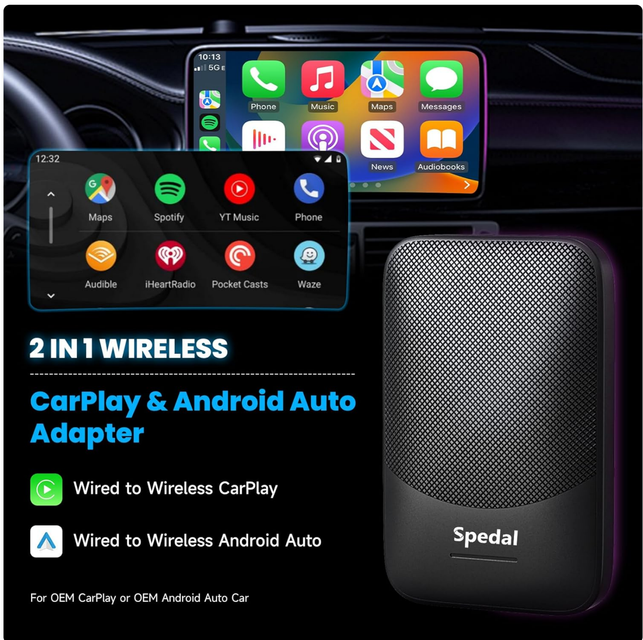
Figure 1: The Spedal CL797 adapter, showcasing its 2-in-1 wireless CarPlay and Android Auto capabilities.