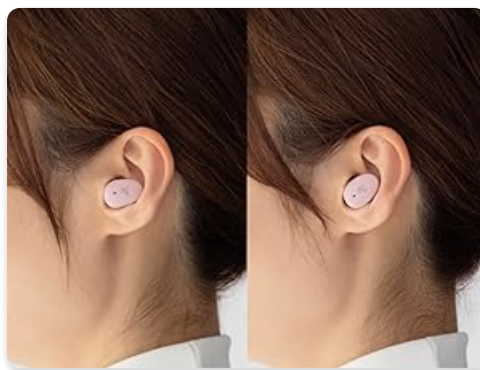
Image: A woman wearing a pink COTSUBU MK2 earphone, illustrating the secure and comfortable fit.

The package includes final TYPE E earpieces in SS, S, and M sizes. Choosing the correct size is crucial for optimal sound quality and comfort. Experiment with different sizes to find the best fit that provides a secure seal in your ear canal.