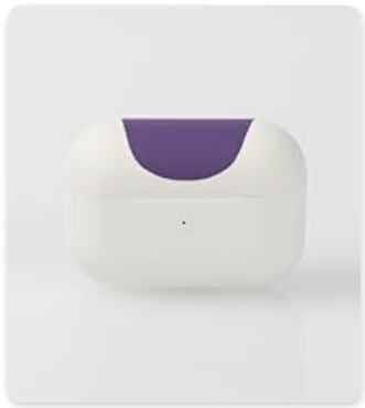
Image: Charging case with text indicating a 1-year warranty.

Your ag COTSUBU MK2 earphones come with a 12-month manufacturer's warranty from the date of purchase. This warranty covers defects in materials and workmanship under normal use. For customer support, warranty claims, or technical assistance, please refer to the contact information provided in your warranty card or visit the official ag brand website. Keep your proof of purchase for warranty validation.