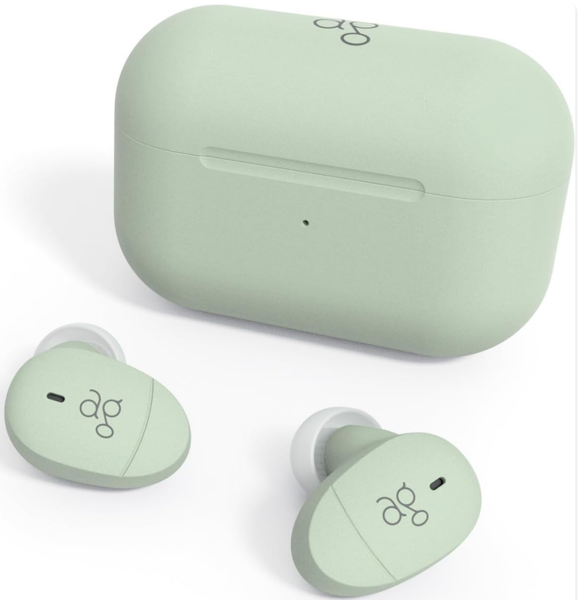
Image: ag COTSUBU MK2 earphones and charging case in Mint color.