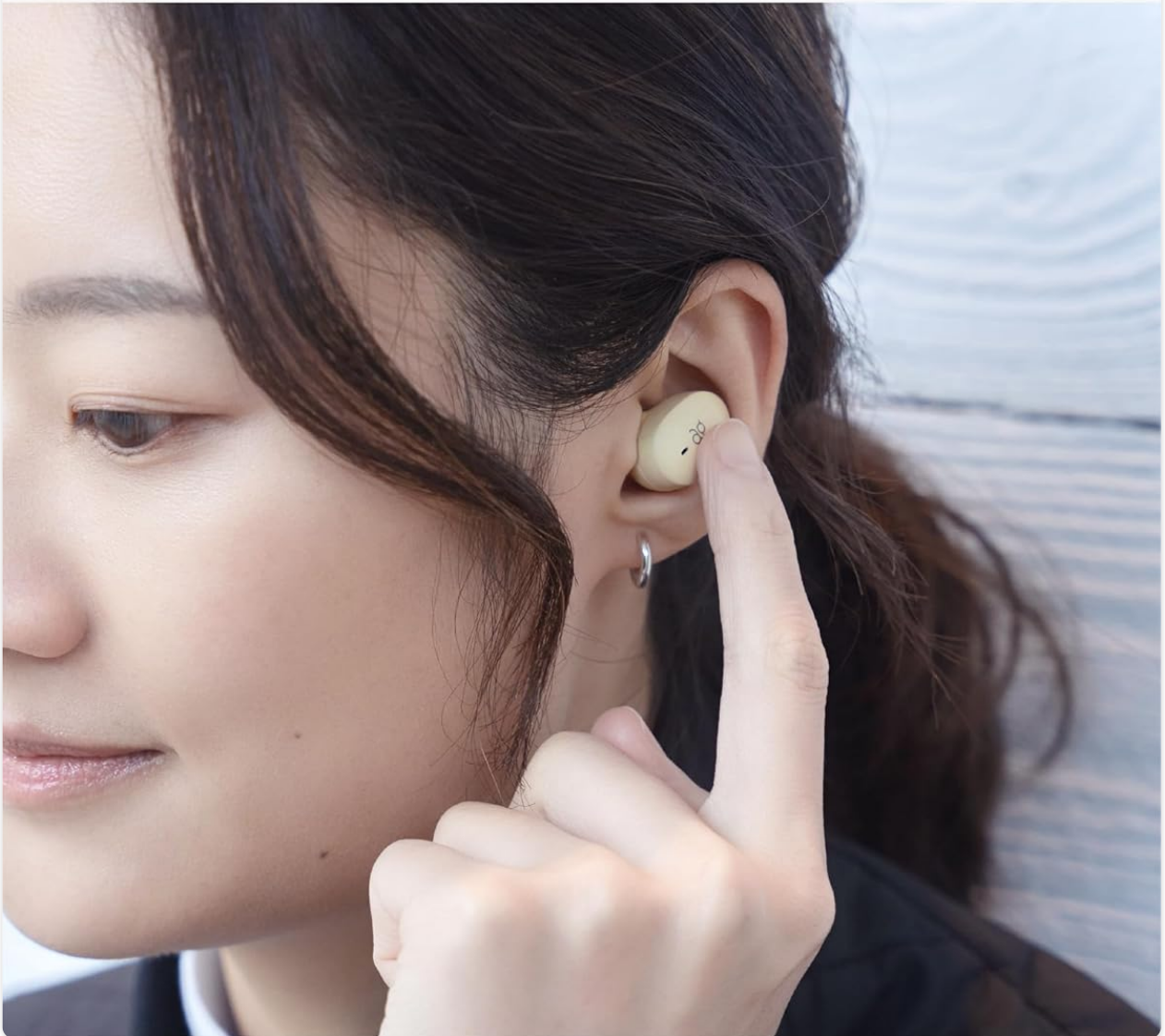
Image: A woman demonstrating the touch control feature on the ag COTSUBU MK2 earphone.

誤動作防止&アナウンス音やLEDもOFFとなり、 コンテンツに集中したいときにオススメ!