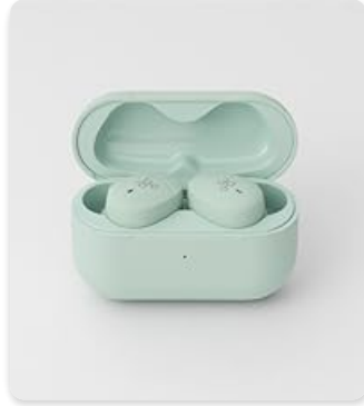
Image: Mint colored COTSUBU MK2 earphones inside their charging case.

Before first use, fully charge the earphones and the charging case. Connect the provided USB-C cable to the charging port on the case and a USB power source. The charging time is approximately 1.5 hours.