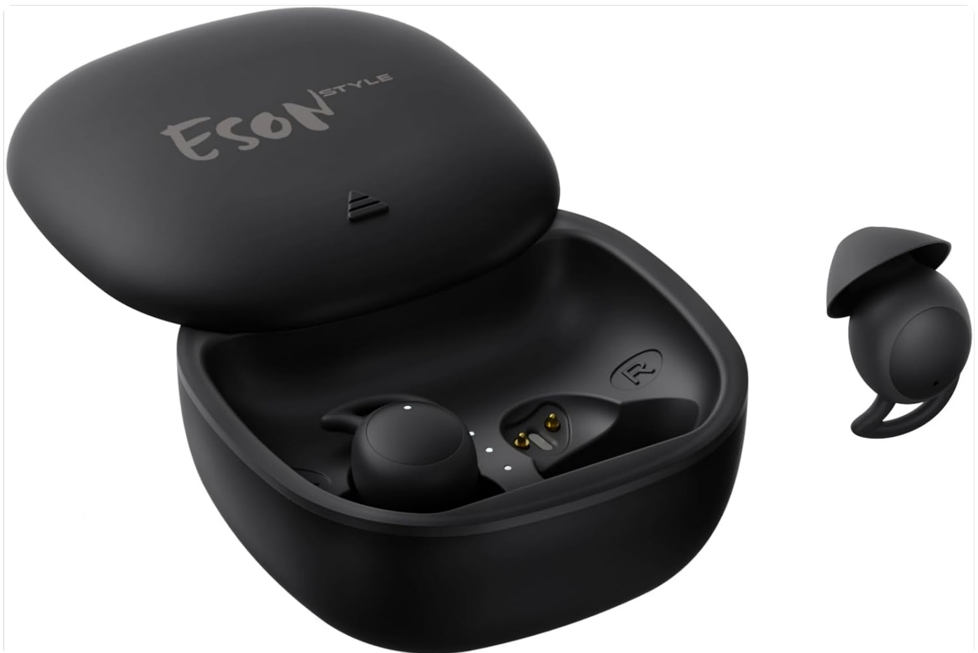
Image: esonstyle S8 Sleep Earbuds shown with their charging case. The earbuds are black and compact, designed for discreet wear.