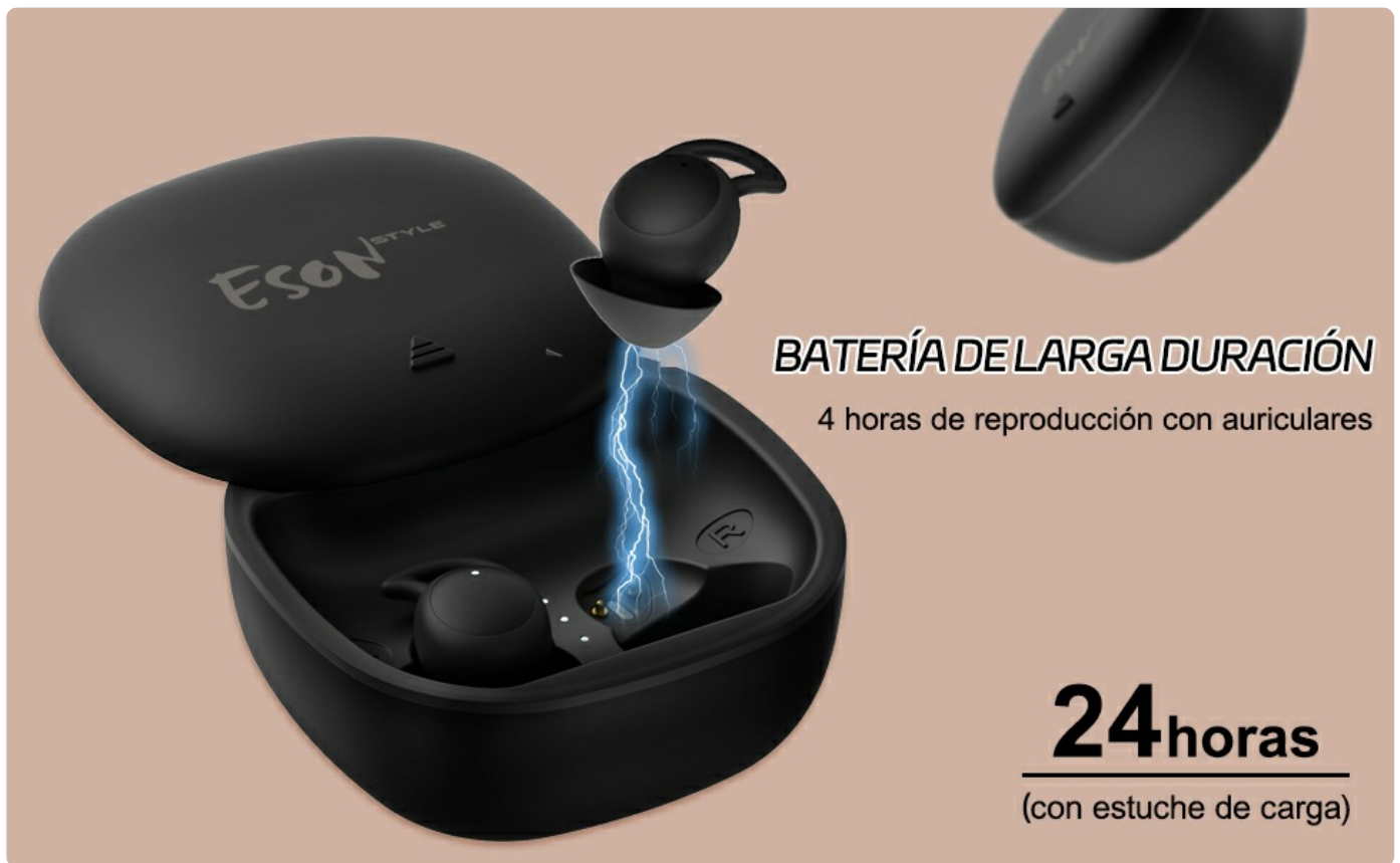
Image: The earbuds in their charging case, visually representing the 4 hours of playback time from the earbuds and the total of 24 hours with the charging case.