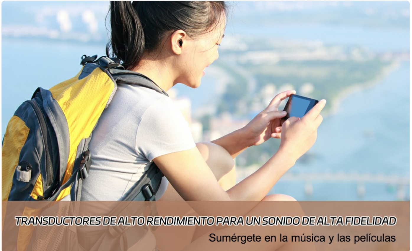
Image: A person engaged in physical activity, demonstrating the earbuds' IPX6 water resistance against sweat and light rain.

The earbuds are IPX6 water-resistant, meaning they are protected against powerful water jets. This makes them suitable for use during workouts or in light rain. However, they are not designed for submersion in water (e.g., swimming or showering). Always ensure the charging port is dry before charging.