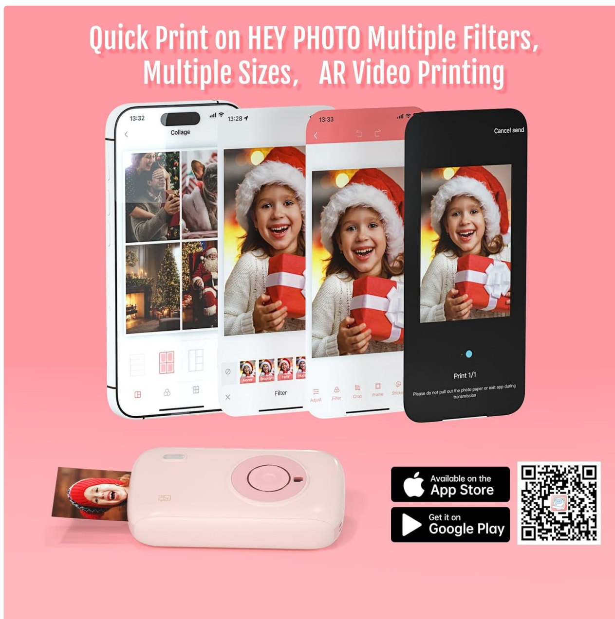
Image: The HEYPHOTO app interface on a smartphone, demonstrating various features and connectivity with the printer.