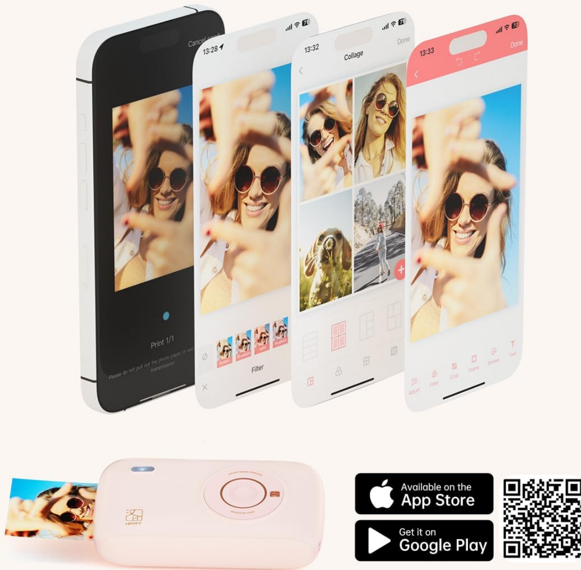
Image: The HEYPHOTO app's editing interface, showing options for filters, frames, and stickers.