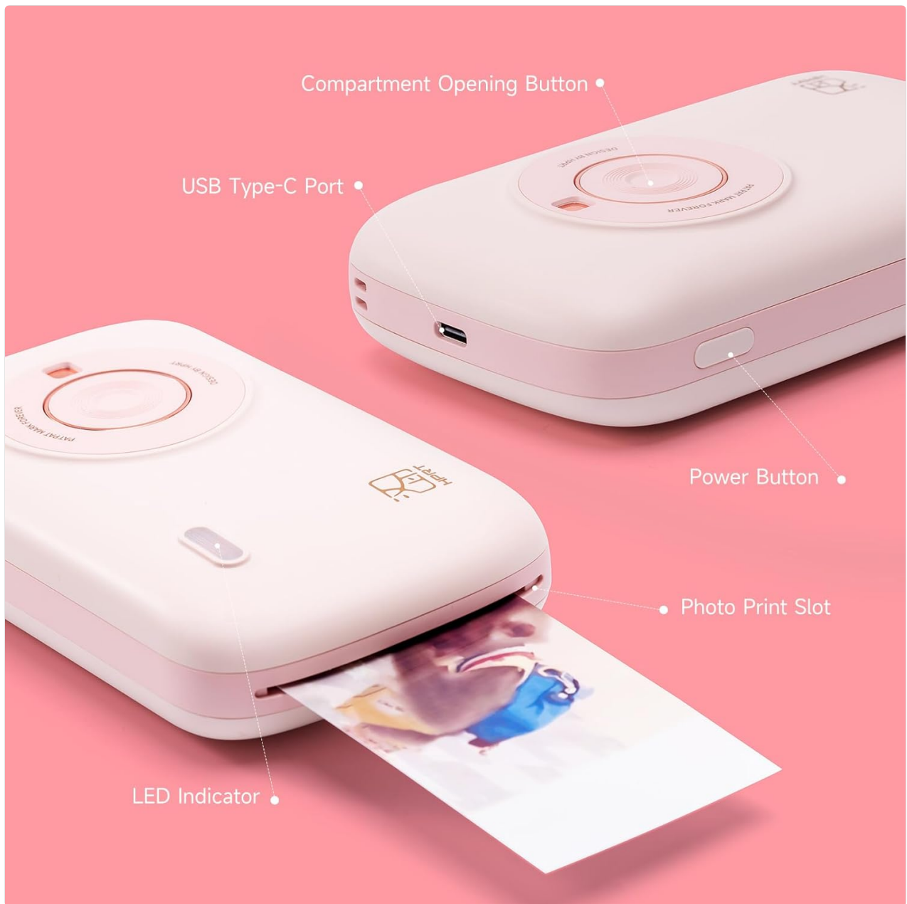
Image: A detailed view of the printer highlighting key components such as the Compartment Opening Button, USB Type-C Port, Power Button, Photo Print Slot, and LED Indicator.