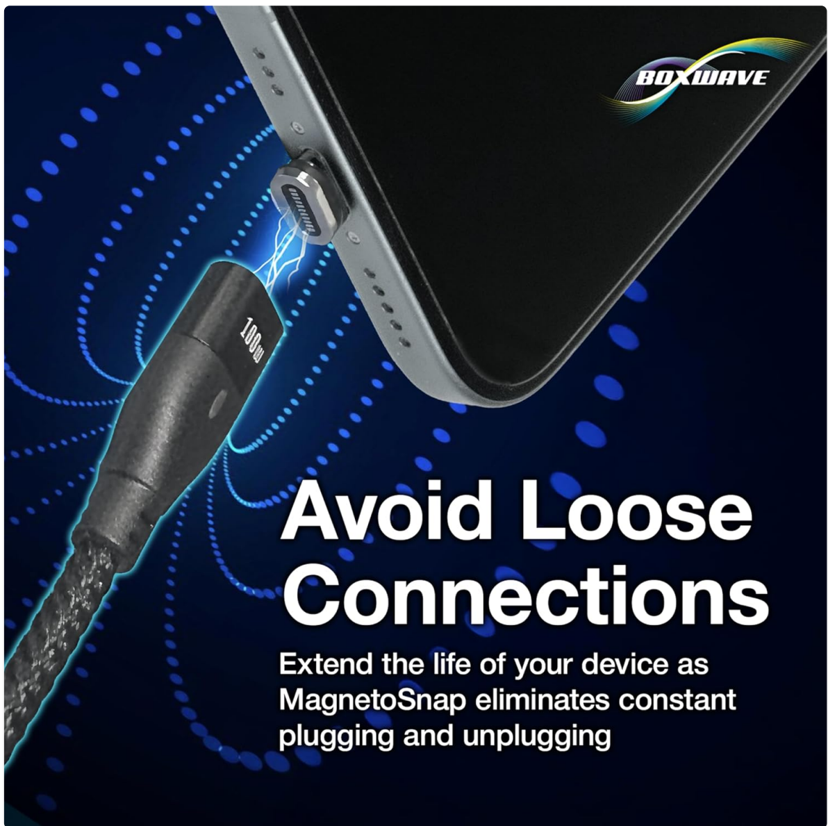
Image: A close-up of a magnetic tip inserted into a smartphone's charging port, highlighting how it helps avoid loose connections.