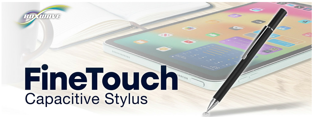
Image: The BoxWave FineTouch Capacitive Stylus, highlighting its clear disc tip for precise interaction.

Thank you for choosing the BoxWave FineTouch Capacitive Stylus. This stylus is designed to provide precise and responsive interaction with your capacitive touchscreen devices, including the Camecho A3081. Its innovative clear tip allows for enhanced visibility and accuracy during use. This manual provides essential information for setting up, operating, and maintaining your stylus.