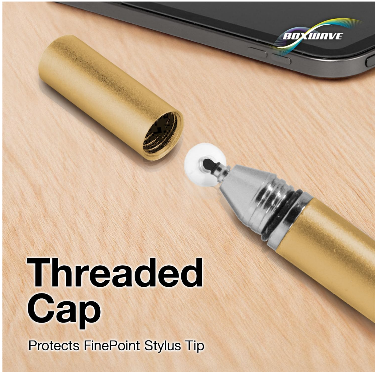
Image: The stylus with its threaded cap, demonstrating how it protects the clear disc tip.