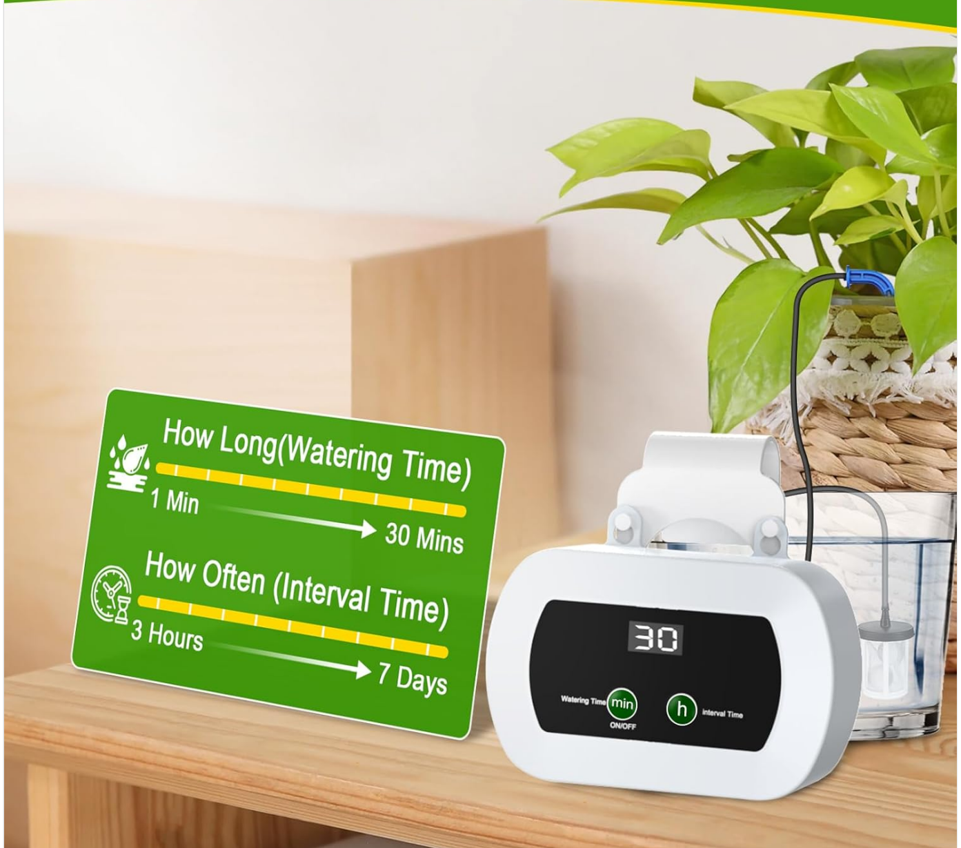
Image: The control unit's LCD display, illustrating the settings for "Watering Time" (1-30 minutes) and "Interval Time" (3 hours - 7 days), indicating ease of operation.