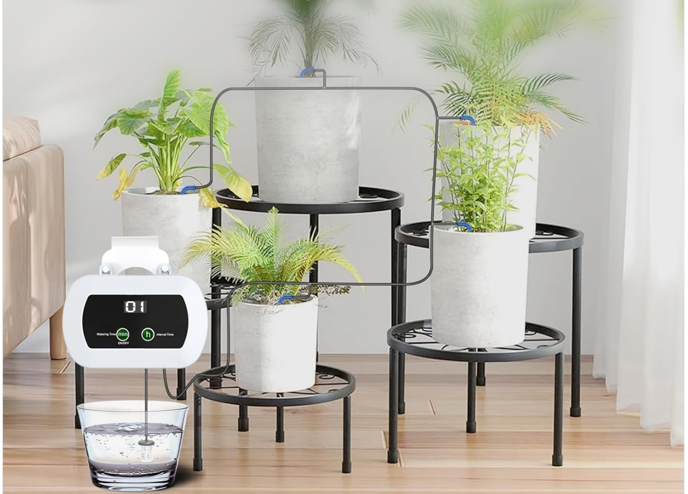
Image: The Srygery Automatic Drip Irrigation System, showcasing its application with several potted plants, highlighting features like LCD Display, USB Charging, Automatic Timer, and Hands-Free operation.