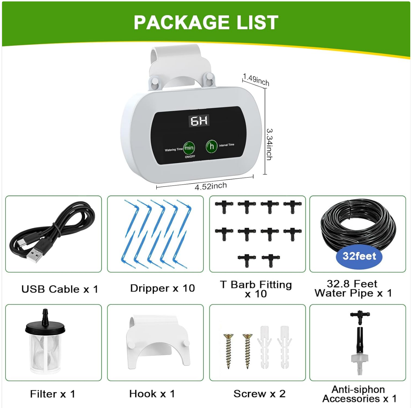
Image: A visual representation of all items included in the Srygery Automatic Drip Irrigation Kit package, such as the programmer, USB cable, drippers, T-barb fittings, water pipe, filter, hook, screws, and anti-siphon accessories.

Verify that all components listed below are included in your package: