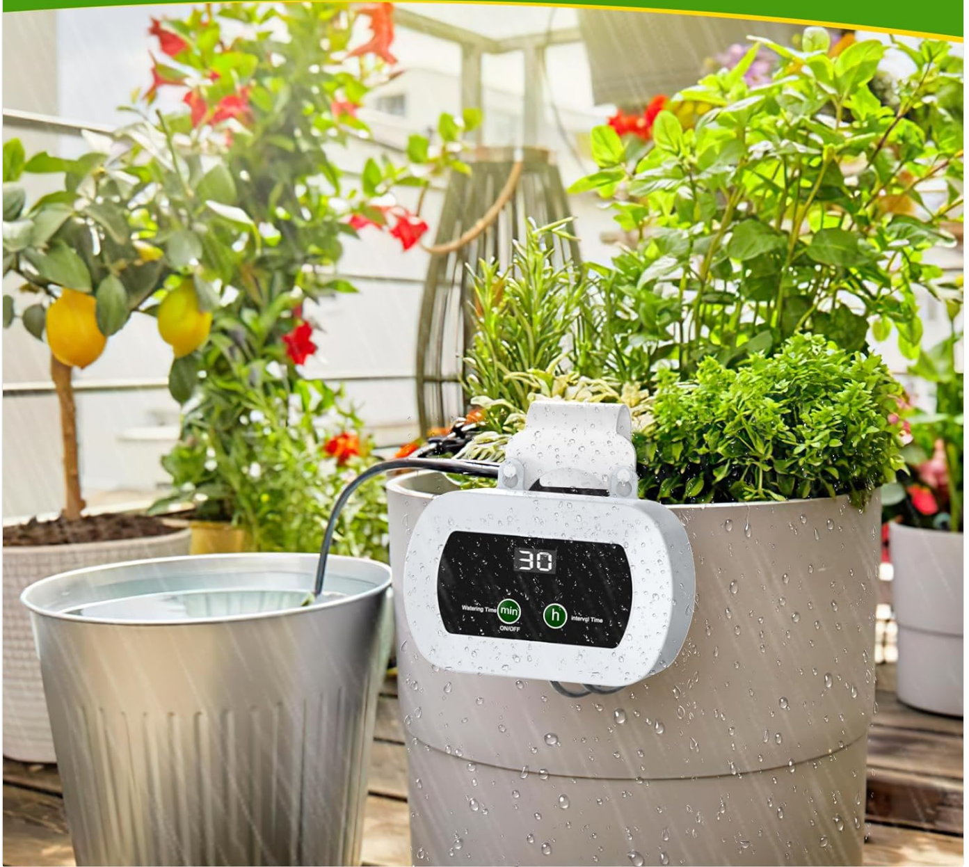
Image: The Srygery Drip Irrigation System unit outdoors, with water droplets on its surface, illustrating its IP65 waterproof rating and suitability for various weather conditions.