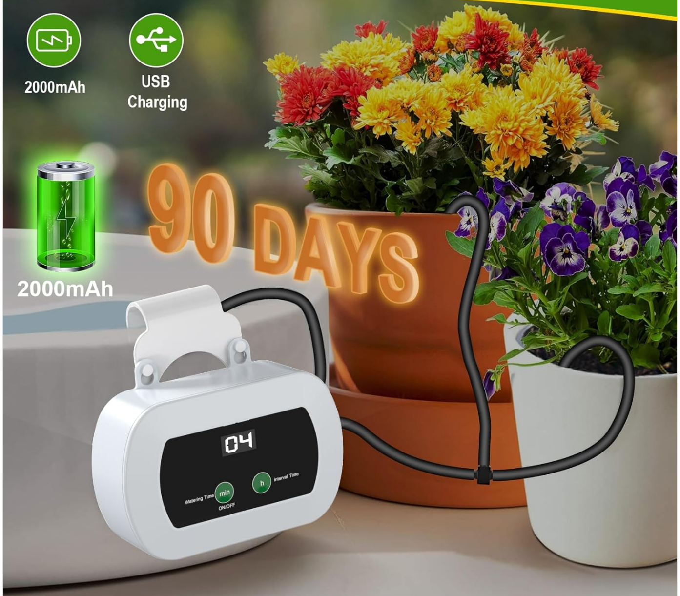
Image: The Srygery Drip Irrigation System unit positioned near potted plants, emphasizing its 2000mAh battery and up to 90 days of standby time, powered by USB charging.