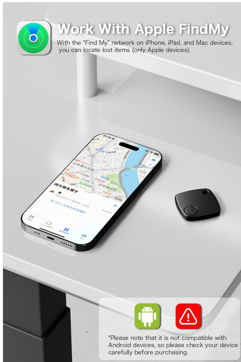
Image: The Novzix Key Tracker is designed to work exclusively with Apple's Find My network.