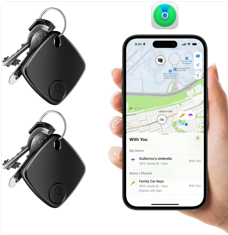
Image: Novzix Key Trackers ready for use with the Apple Find My app.