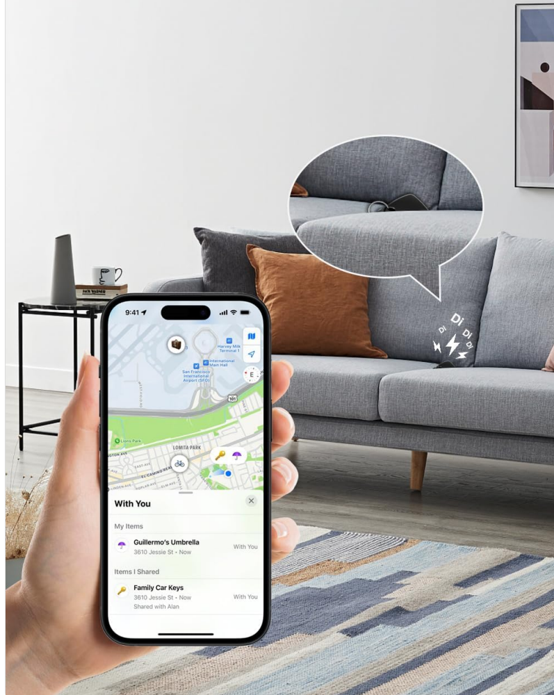
Image: Using the 'Play Sound' feature to locate nearby items.