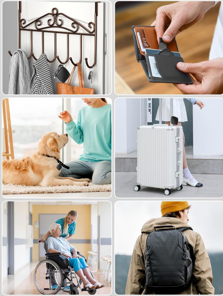
Image: Notification for items left behind, aiding in loss prevention.

Keys, wallets, backpacks, suitcases, and even pets, among others, play a role in various application scenarios such as preventing children and elderly people from getting lost.