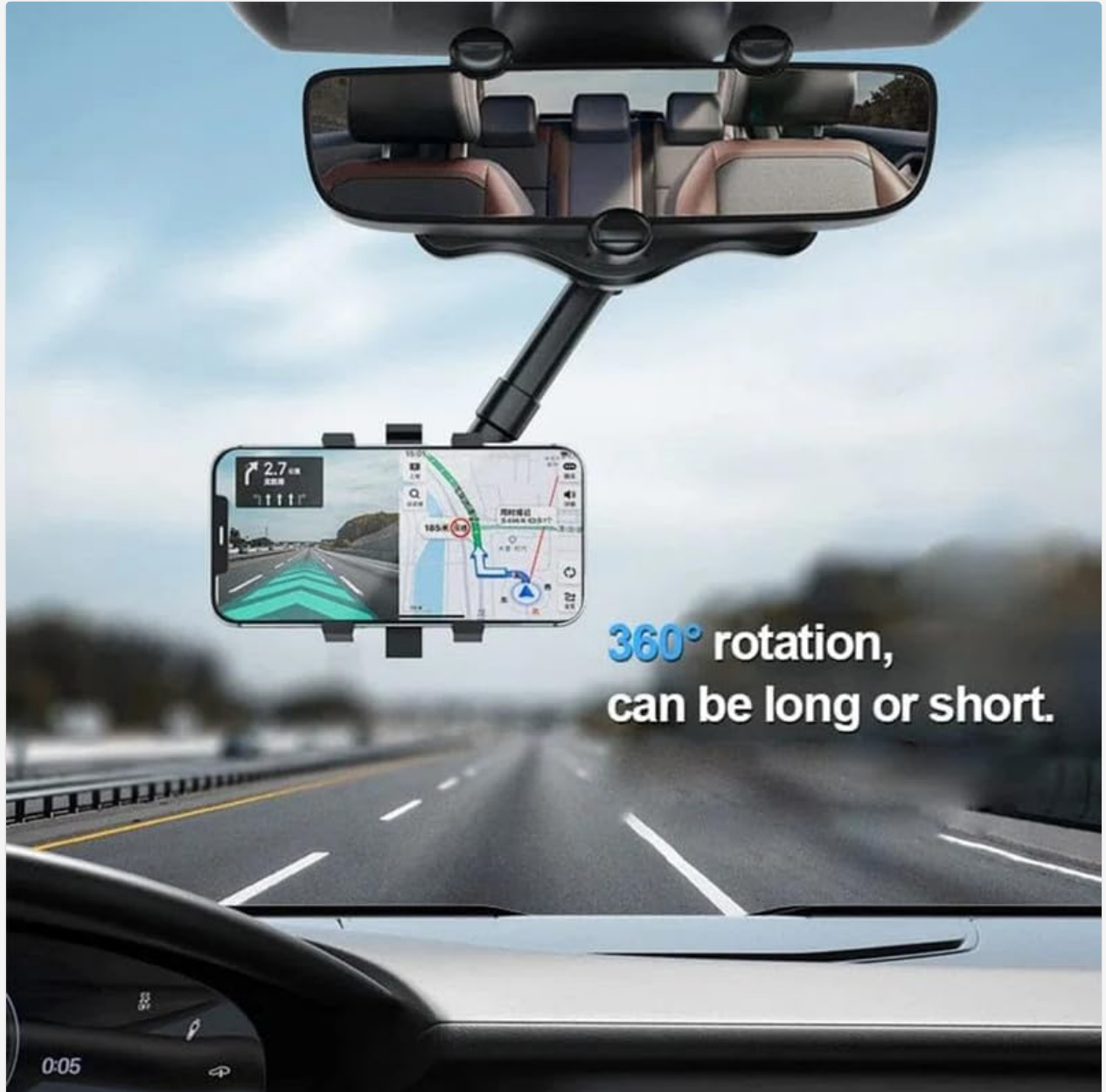
Image: The phone holder demonstrating its 360-degree rotation capability and adjustable arm length for optimal positioning.