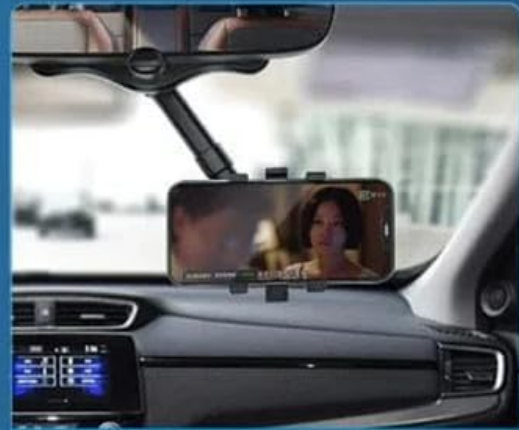
Co-pilot watching drama