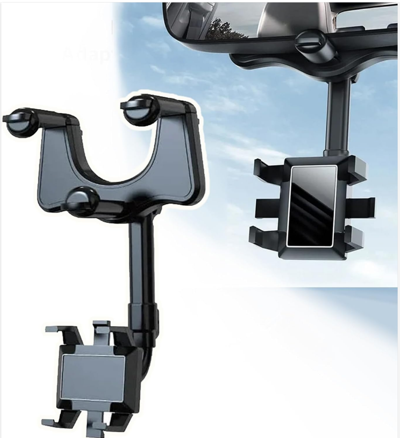
Image: The Fuduoo 360 Degree Car Phone Holder, showing its design and how it attaches to a rearview mirror.