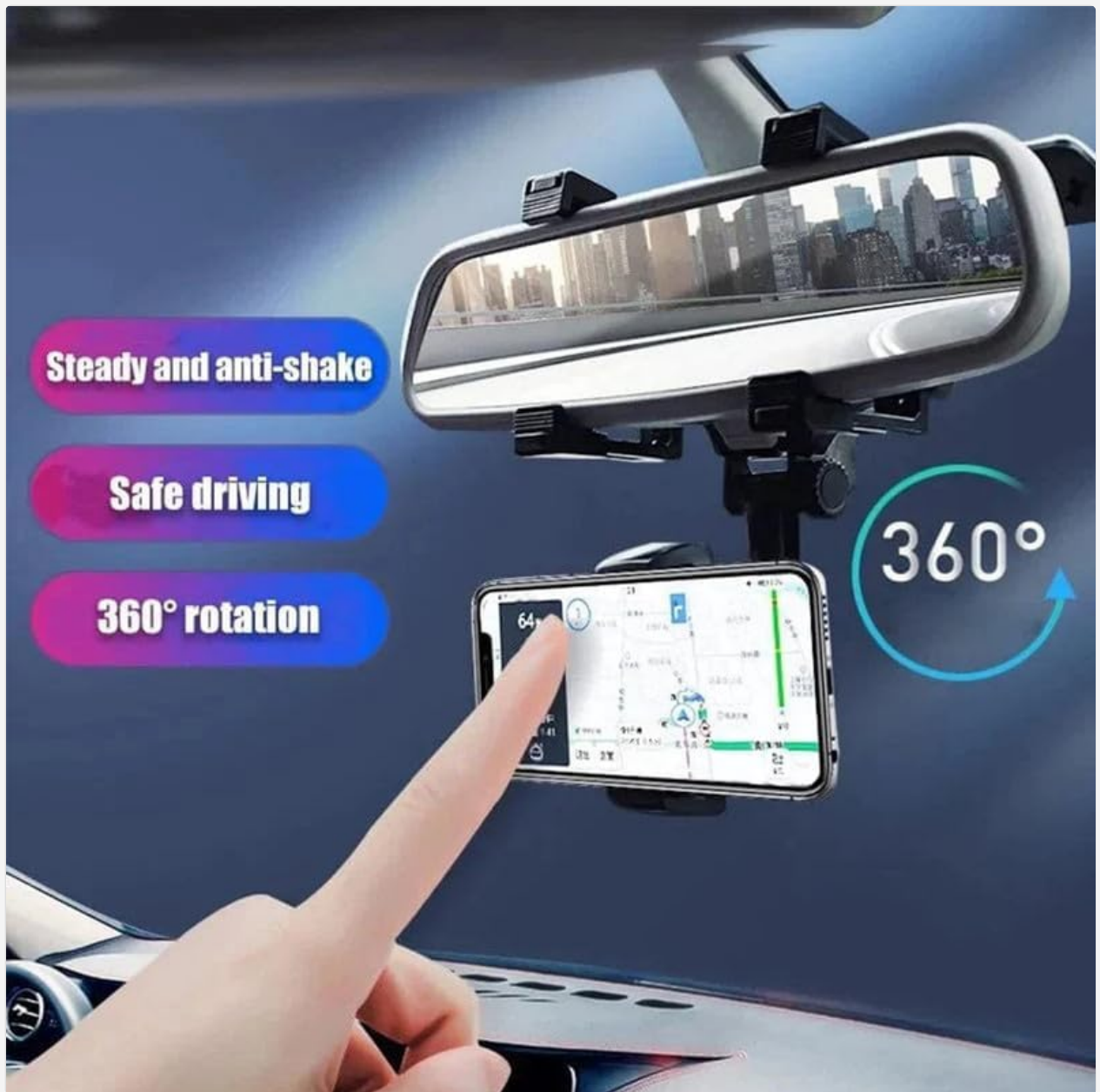
Image: The phone holder securely mounted on a car's rearview mirror, demonstrating its stable attachment.