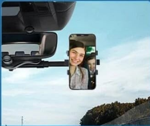
Live selfie recording