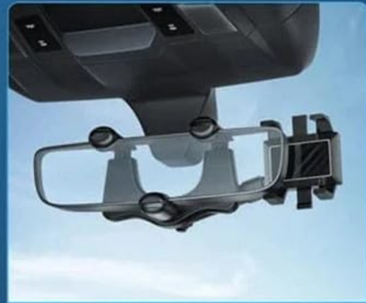
Folding does not block the view

Image: Illustrations of the phone holder's diverse applications, such as navigation, co-pilot entertainment, live selfie recording, and its compact folded state.