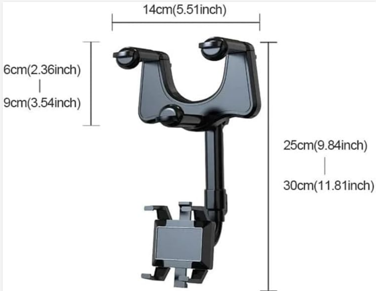
Image: A detailed diagram illustrating the approximate dimensions of the phone holder.