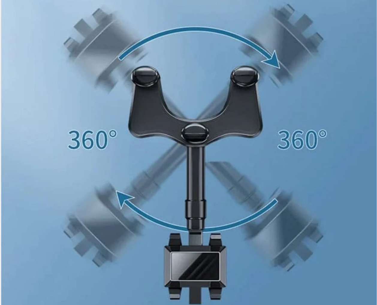
Image: A diagram illustrating the rotary design, allowing adaptation to various angles with 360-degree rotation.