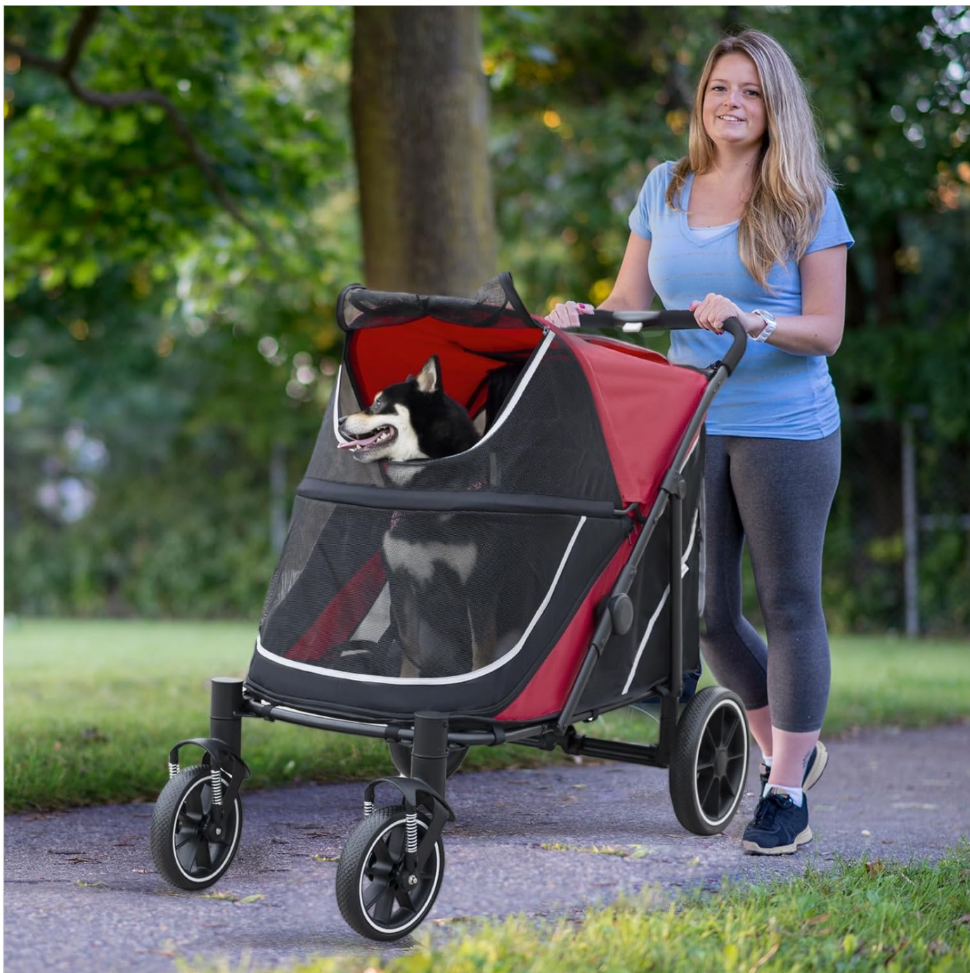
Image: The Halitaa dog stroller in its fully assembled state, ready for use.