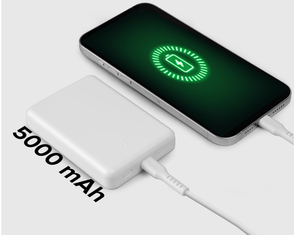
Image: The SBS PowerBank 5K MagSafe connected to a smartphone via a USB-C cable, illustrating wired charging and its 5000 mAh capacity.