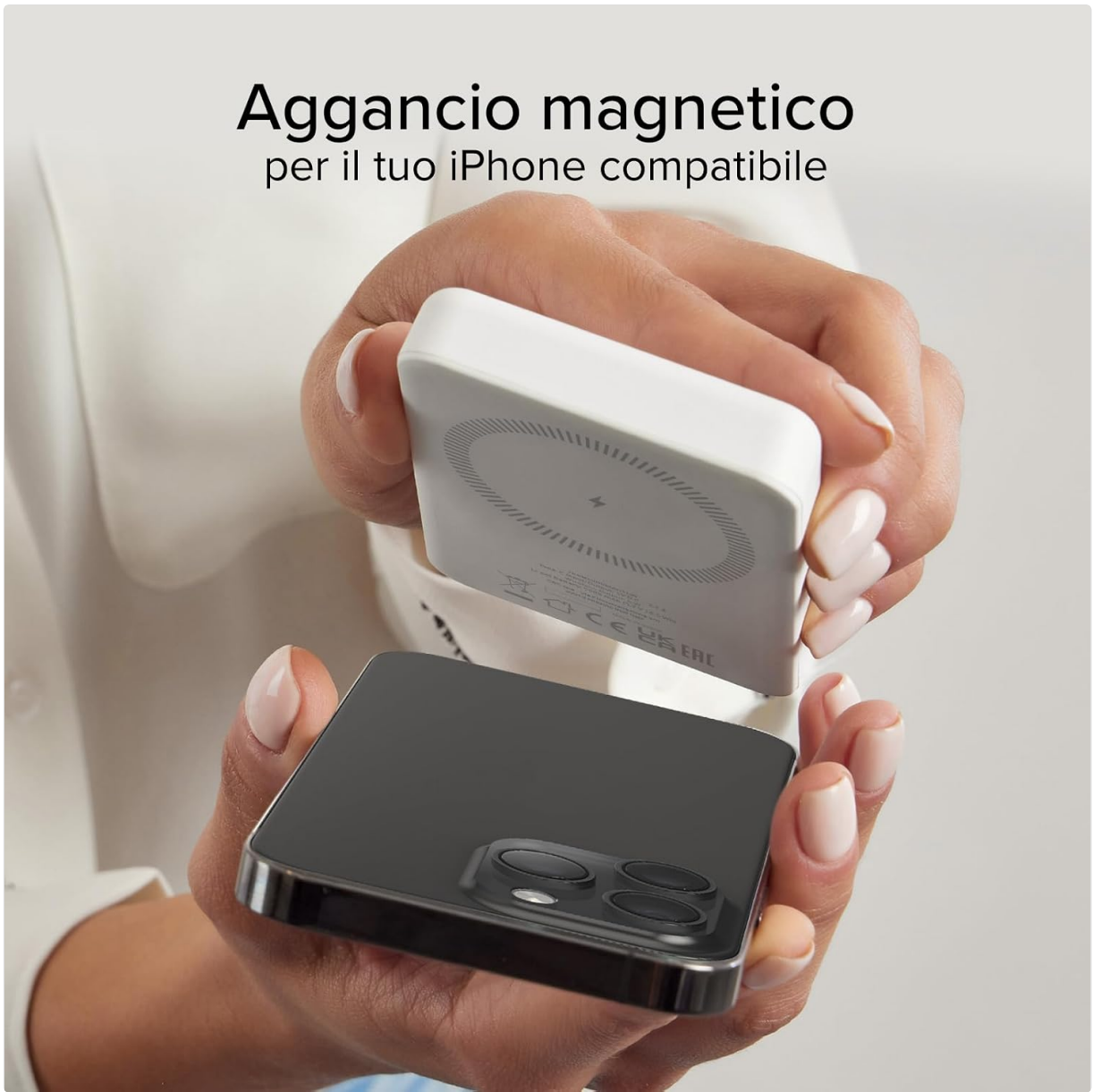
Image: A person's hand holding an iPhone with the SBS PowerBank 5K MagSafe magnetically attached, illustrating the secure magnetic connection.