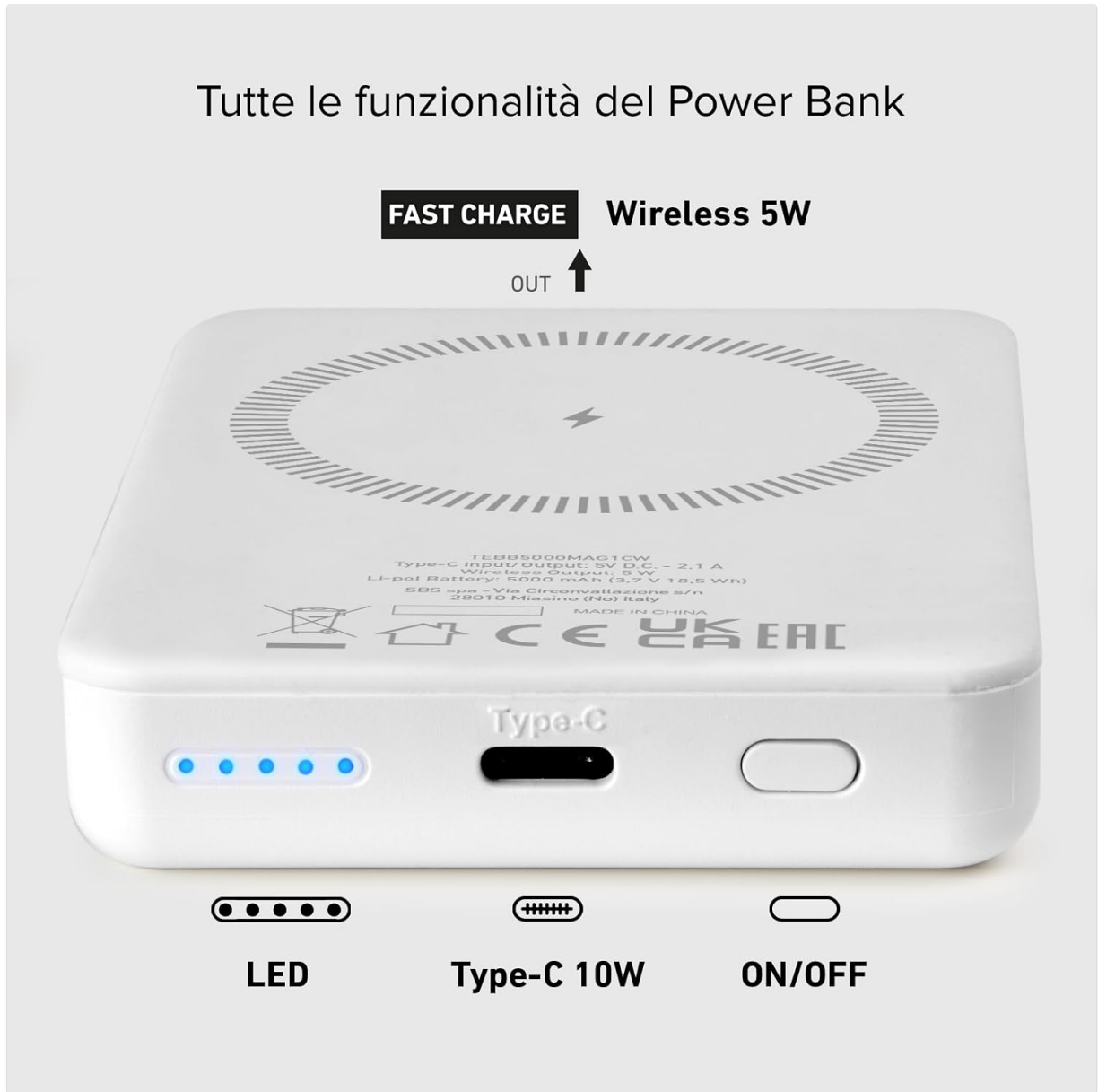
Image: Overview of the SBS PowerBank 5K MagSafe, highlighting its LED indicators, USB-C port, and ON/OFF button. It also shows the wireless charging output of 5W.

The SBS PowerBank 5K MagSafe is a compact and versatile portable charger with a 5000mAh capacity. It features both wireless and USB-C charging options, an Intelligent Charge (IC) system for device protection, and LED indicators for charge status.