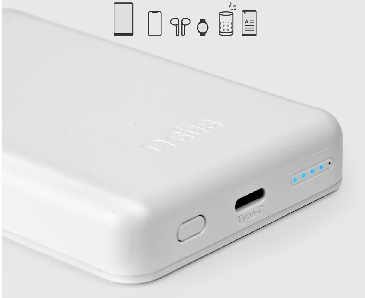
Image: The SBS PowerBank 5K MagSafe shown with icons representing various compatible devices, including tablets, smartphones, headphones, smartwatches, portable speakers, and e-readers.