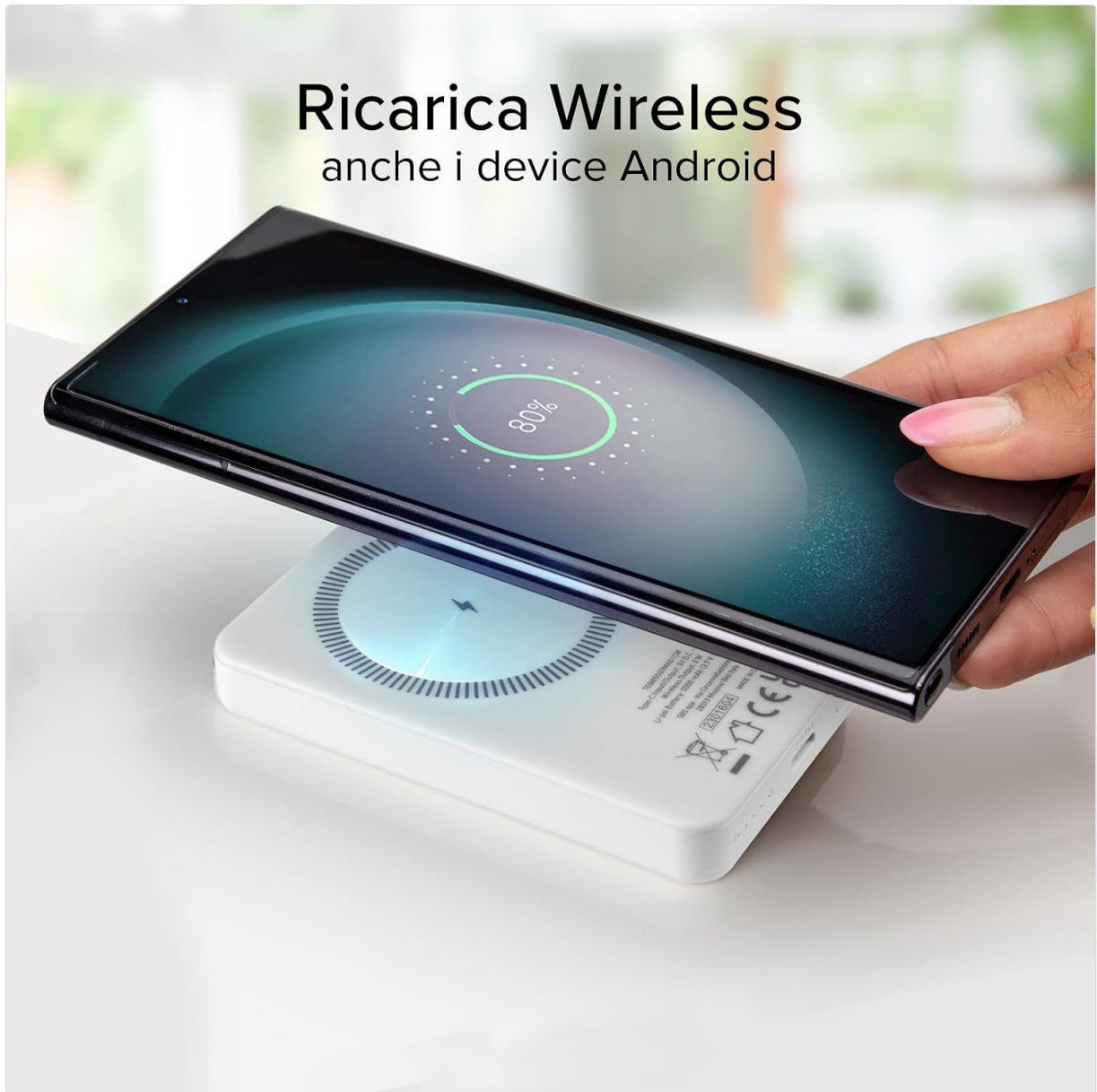
Image: The SBS PowerBank 5K MagSafe wirelessly charging an Android smartphone, indicating compatibility with various wireless charging devices.