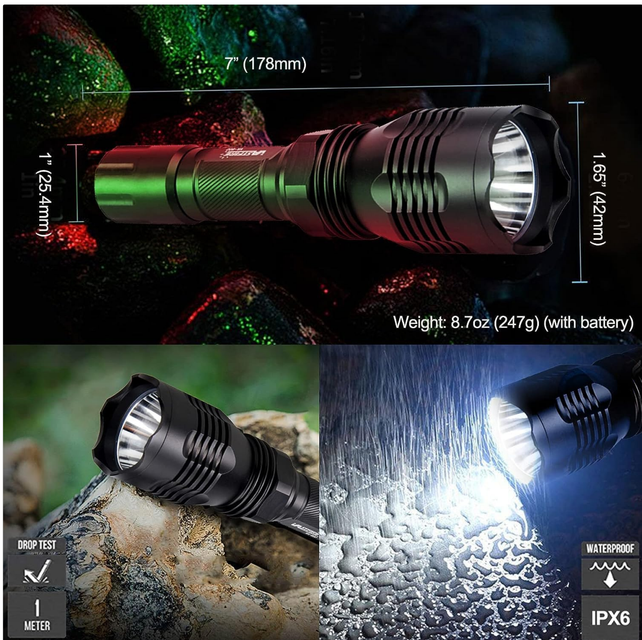
Figure 4: Flashlight durability features, including drop test and water resistance.