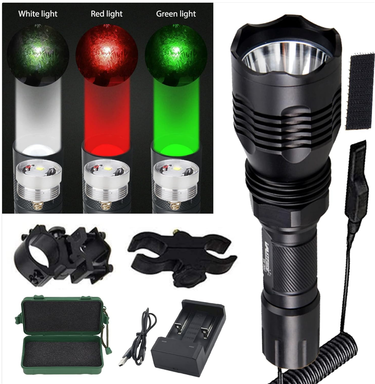
Figure 2: Flashlight with interchangeable LED modules and accessories.