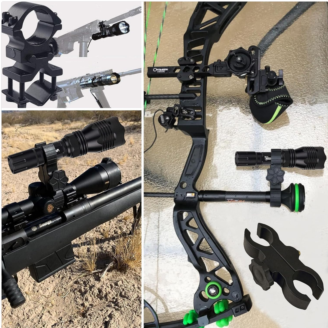
Figure 3: Mounting options for the flashlight on a rifle scope and bow.