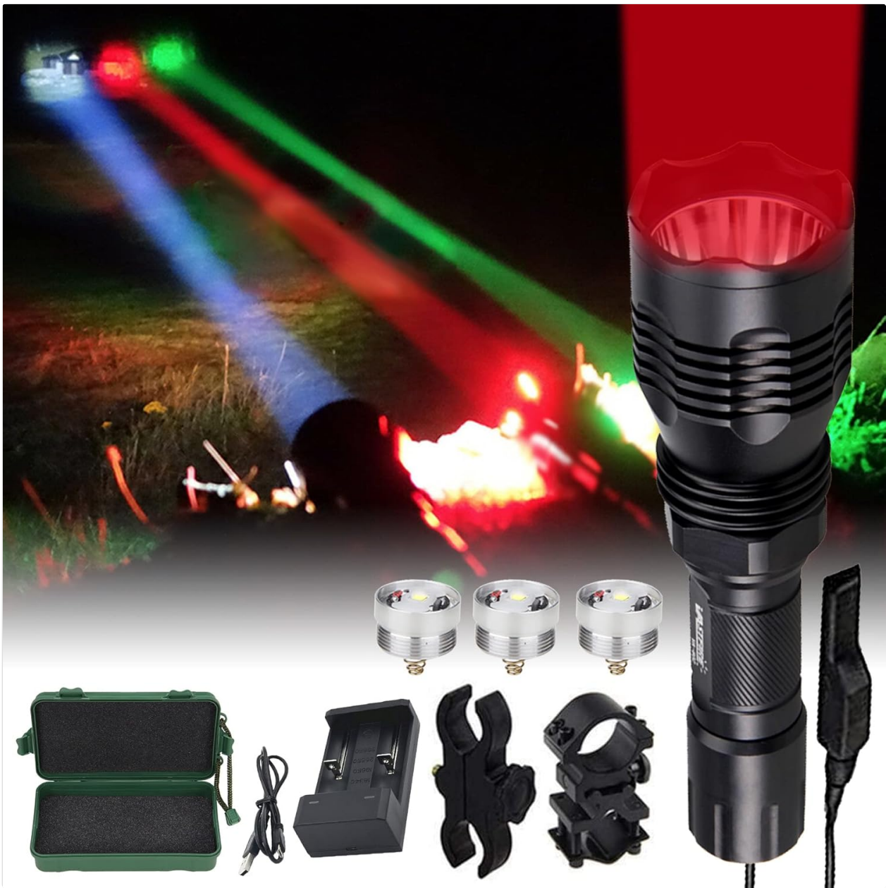
Figure 1: Complete VASTFIRE Predator Light Kit Components.