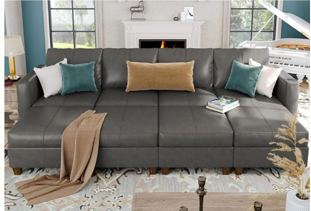
Image: The modular sofa reconfigured into a large, flat surface suitable for sleeping or extended lounging.