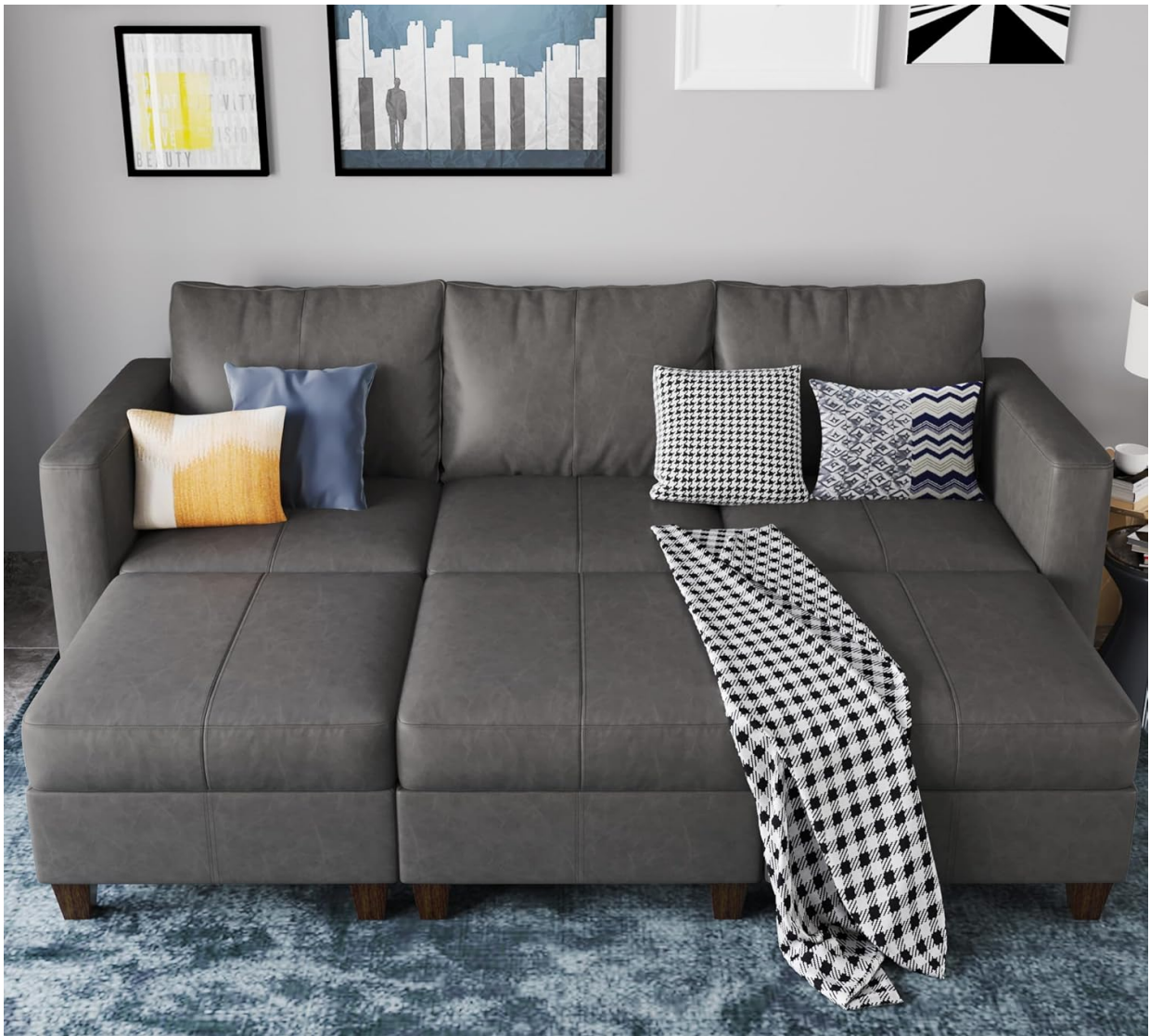
Image: An L-shaped modular sofa with an ottoman, showcasing one possible arrangement.