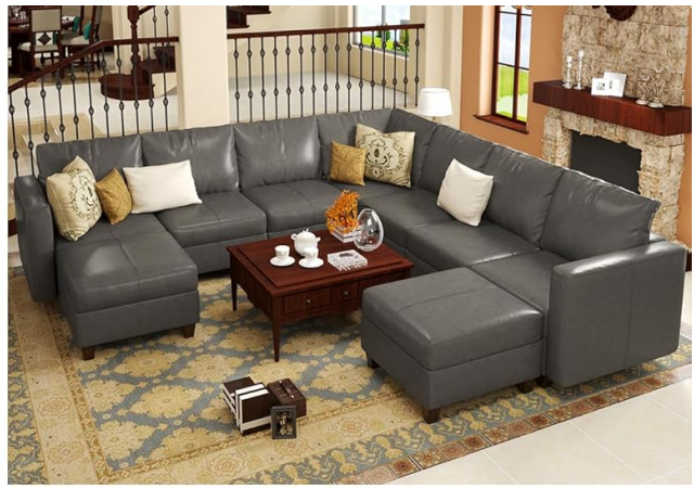
Customizable Modular Sofa