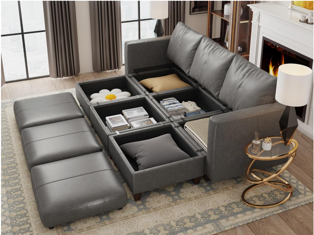
Image: Several modular sofa units with their tops open, showing the hidden storage space within each compartment.

Your browser does not support the video tag.