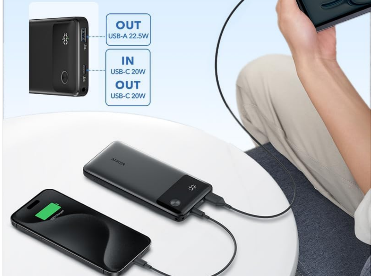
Image: A graphic showing the Anker Power Bank simultaneously charging a smartphone and a tablet. The image highlights the USB-A output (22.5W) and USB-C input/output (20W) ports.