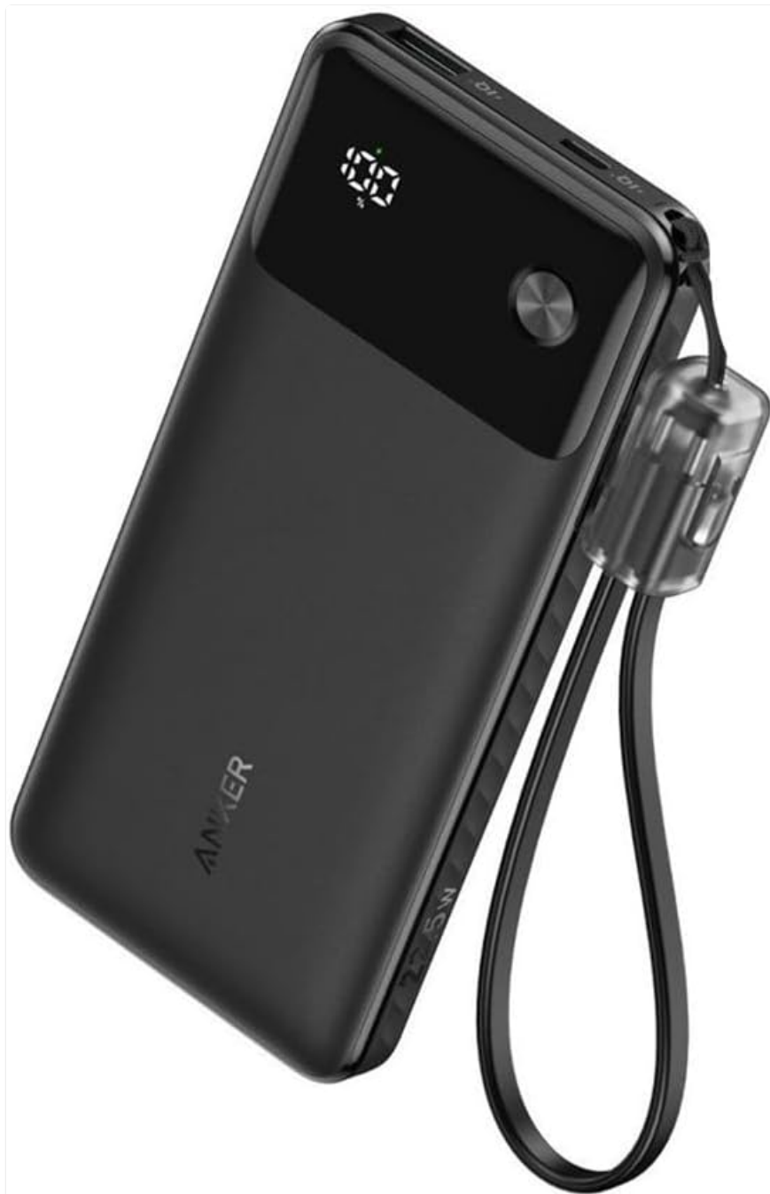
Image: The Anker Power Bank A1388, a black portable charger with a digital display showing "100%" charge, and a built-in lanyard USB-C cable. The Anker logo is visible on the front.