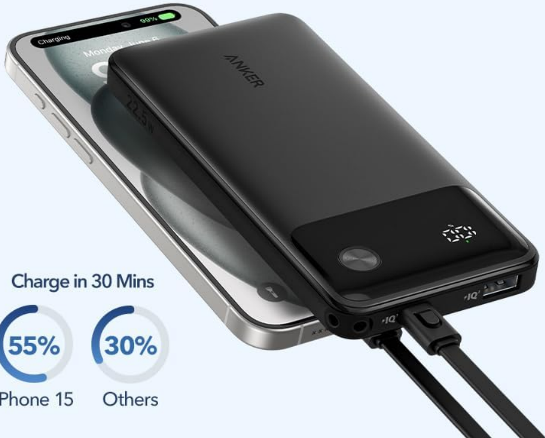
Image: A graphic demonstrating PD 20W fast charging for iPhone, showing an iPhone 15 charging to 55% in 30 minutes using the Anker Power Bank.