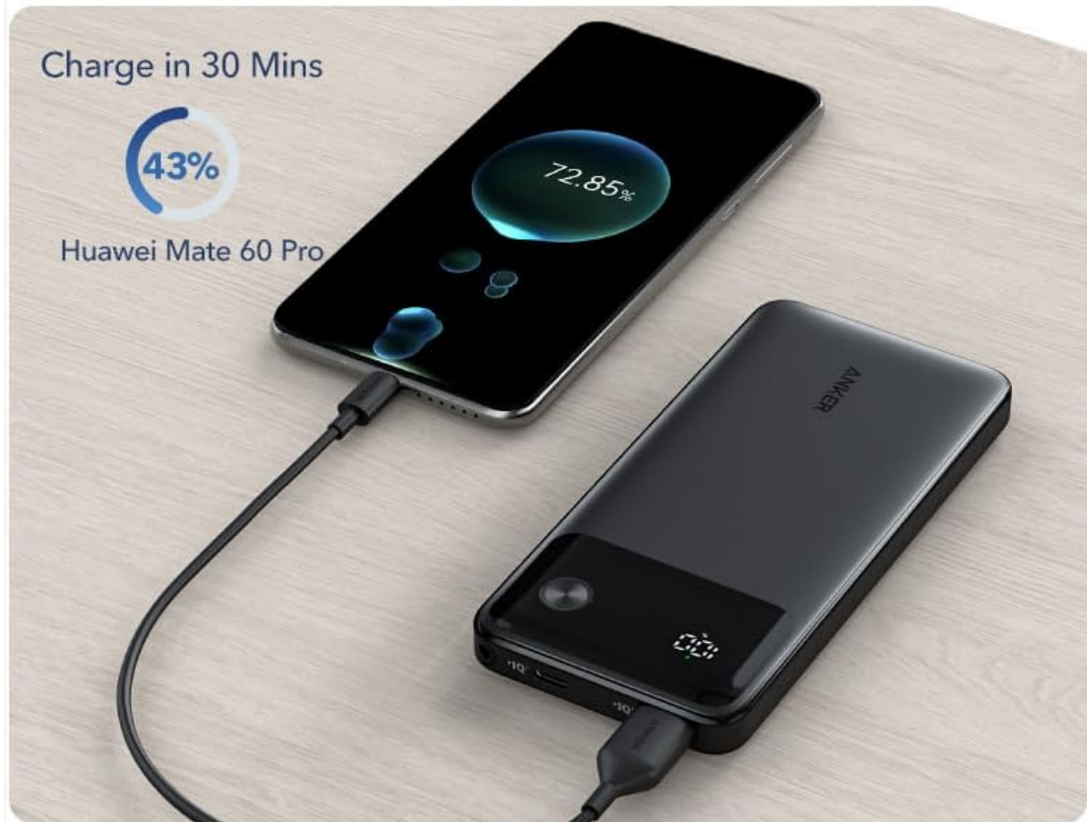
Image: A graphic illustrating 22.5W Max SCP fast charging, showing a Huawei Mate 60 Pro charging to 43% in 30 minutes using the Anker Power Bank.

Charge to 43% in 30 Mins for Huawei Mate 60 Pro