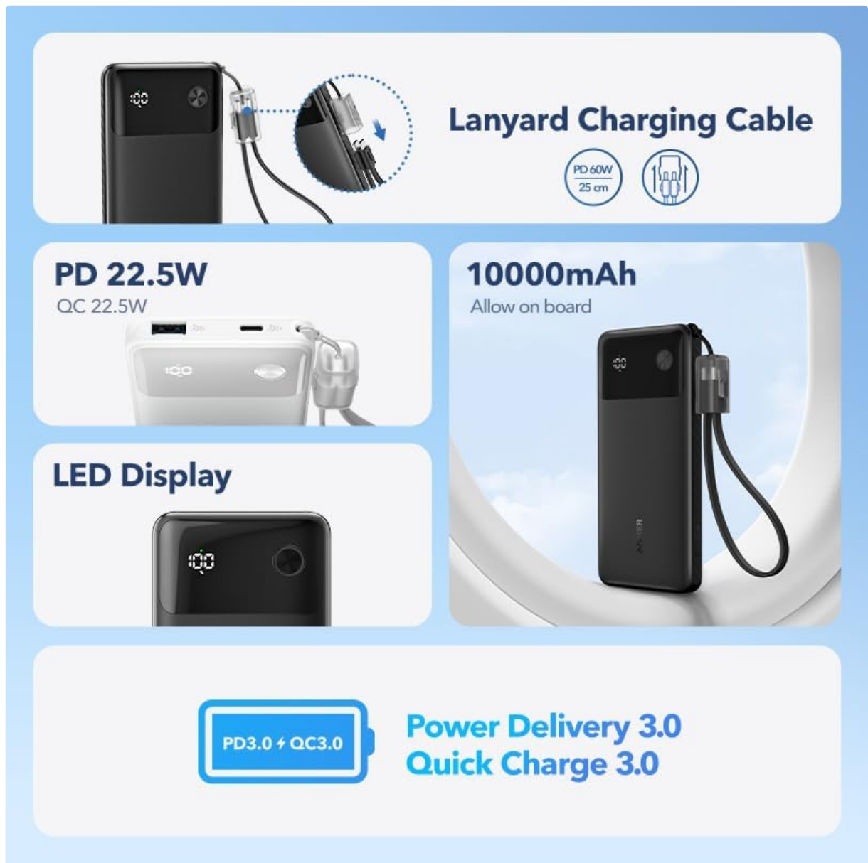
Image: A graphic illustrating key features of the Anker Power Bank. It highlights the built-in lanyard charging cable (PD 60W, 25 cm), PD 22.5W output, 10000mAh capacity, and the LED display. It also mentions Power Delivery 3.0 and Quick Charge 3.0 compatibility.