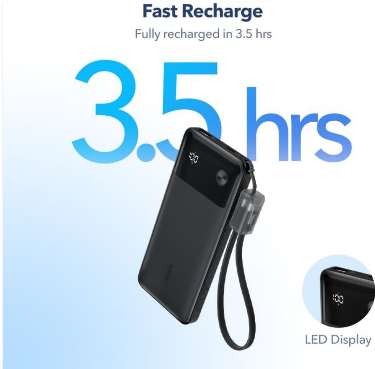
Image: A graphic indicating "Fast Recharge" with the text "Fully recharged in 3.5 hrs" next to an image of the Anker Power Bank with its LED display showing "100%".