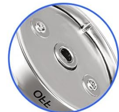
Solid metal side