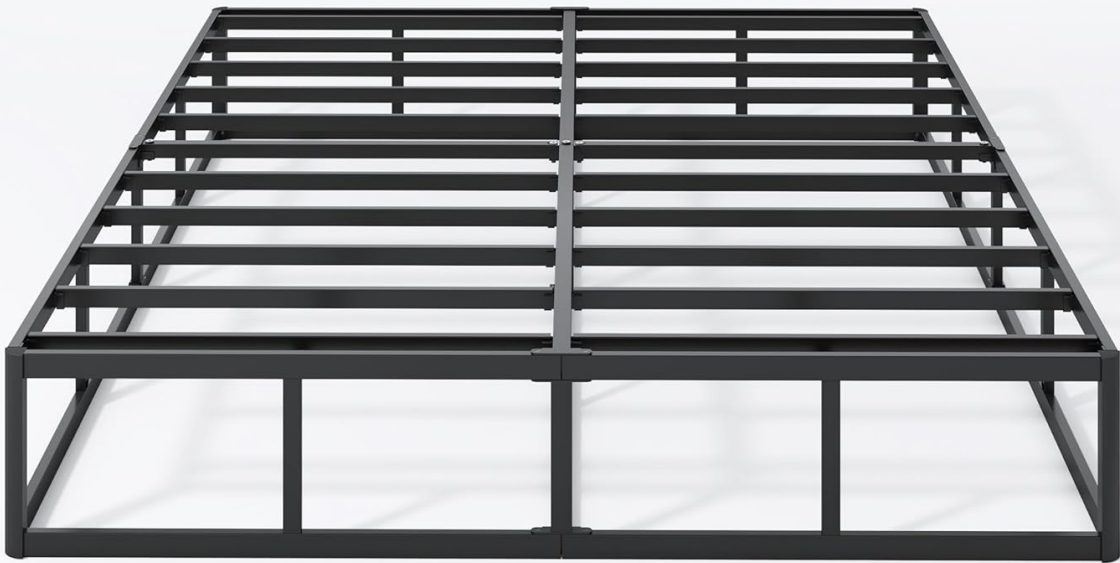
Image: The SHLAND 9 Inch High Profile Full Box Spring, displaying both the assembled metal frame and the frame with its fabric cover.