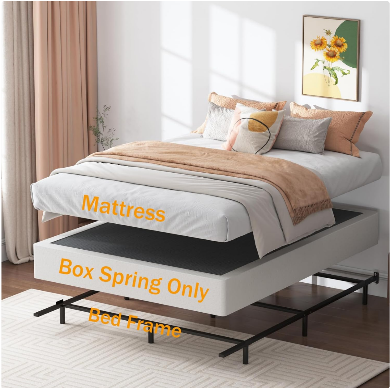
Image: An illustration demonstrating the correct layering of a mattress on top of the box spring, which then rests on a bed frame.