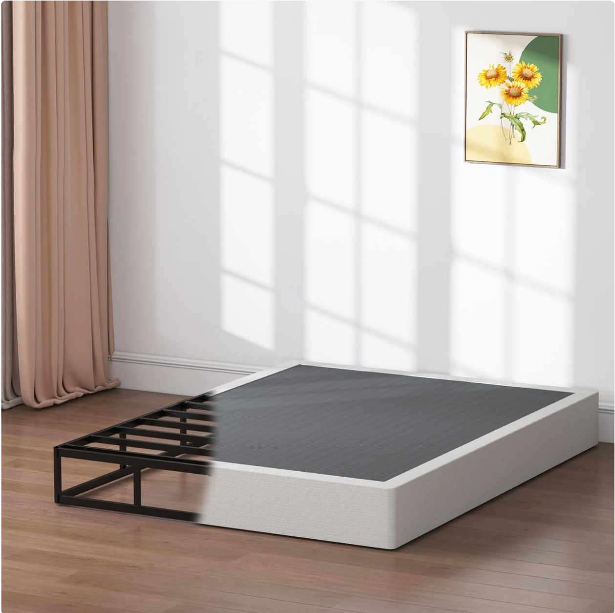
Image: The metal frame with the fabric cover partially applied, demonstrating the assembly process.