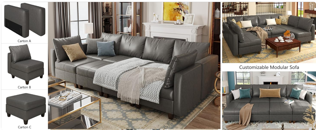
Image: A removable seat cushion, illustrating the ease of maintenance and replacement.