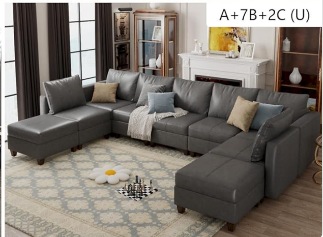
Image: The modular sofa arranged into a spacious sleeper bed configuration.

Your browser does not support the video tag.