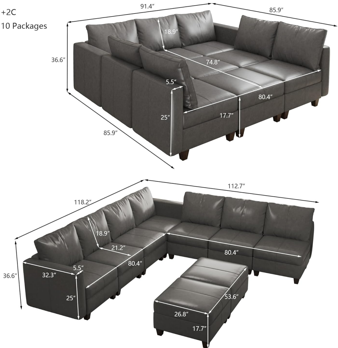
Image: Technical drawing illustrating the dimensions of the modular sectional couch.