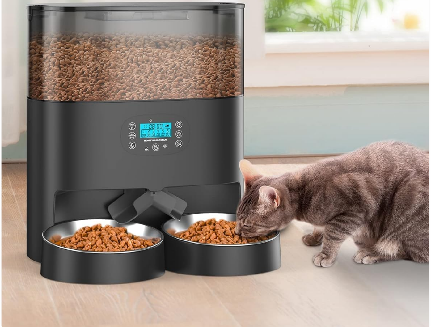
Diagram illustrating timed feeding options: 1-6 meals per day, 0-24 portions per meal, with 1 portion approximately 6g. A cat is shown eating from the feeder.