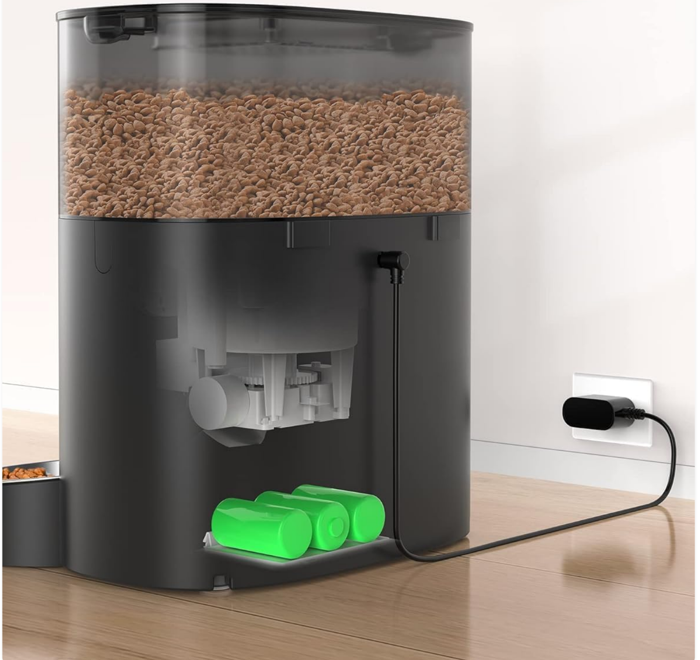
Diagram showing the dual power options: D batteries (not included) and power adapter, ensuring continuous operation even during power outages.