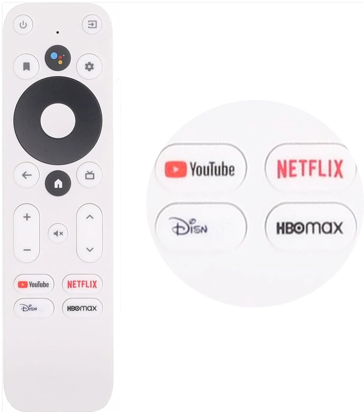
Image: The Smartby Replacement Remote Control, showing its layout and dedicated app buttons.