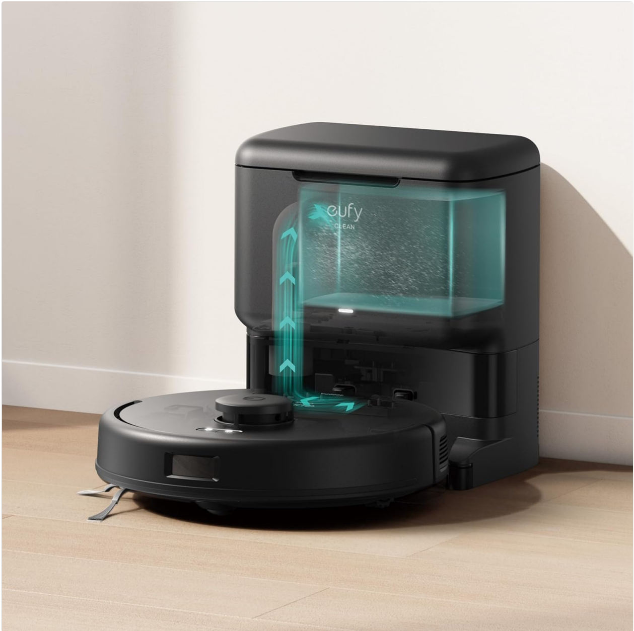
Image: The eufy L50 SES Robot Vacuum docked with its self-empty station, illustrating the automatic debris transfer process.

The self-empty station collects debris from the robot. Replace the dust bag when the indicator light on the station signals it is full. Open the top lid of the station, remove the full bag, and insert a new one.