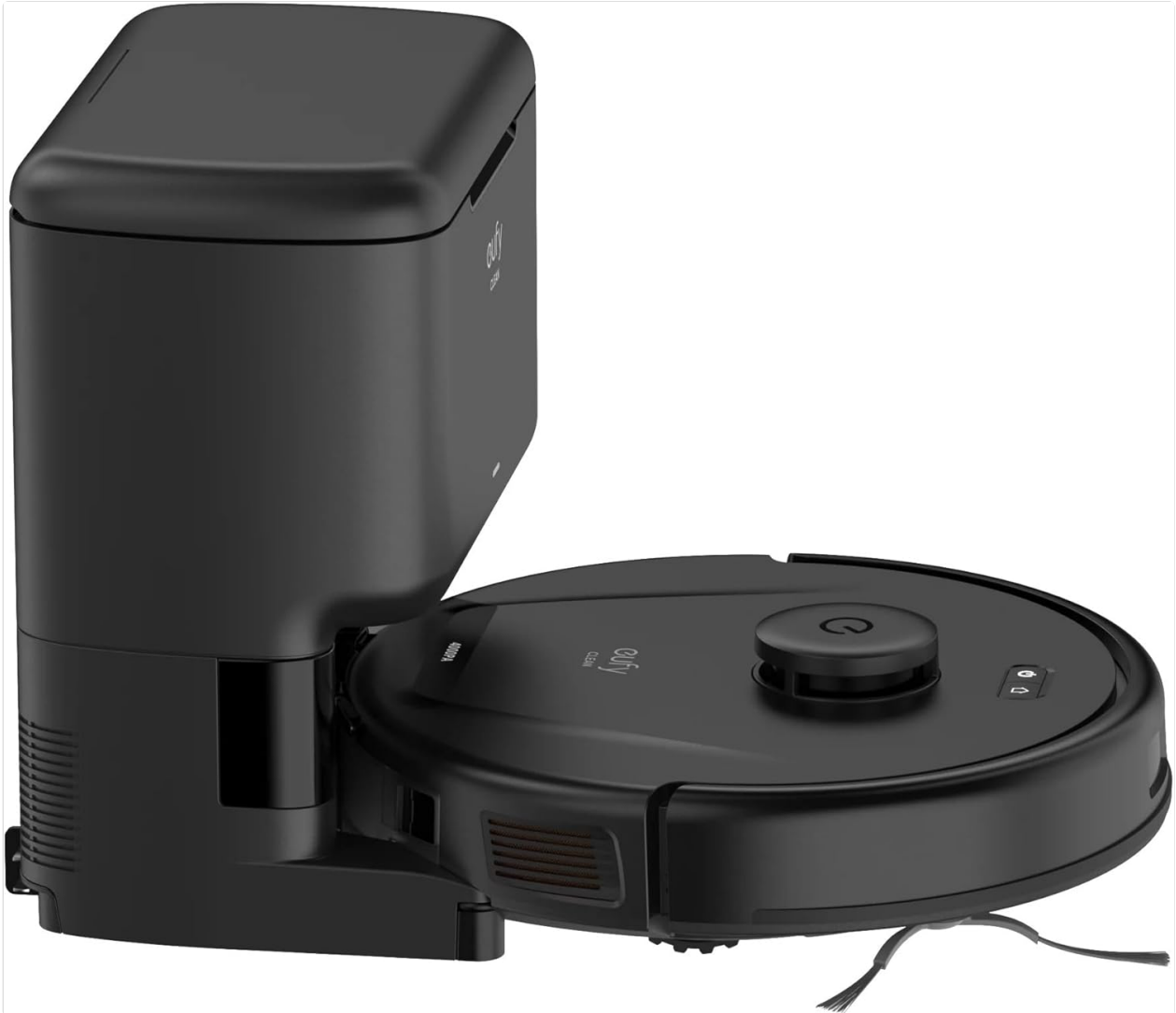
Image: The eufy L50 SES Robot Vacuum docked with its self-empty station, ready for charging and self-emptying.

Place the charging base and self-empty station against a wall in an open area. Ensure there are no obstacles within 1.5 meters (5 feet) in front of the station and 0.5 meters (1.6 feet) on either side. Plug the power adapter into a wall outlet.