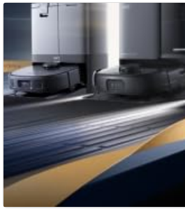
Image: The eufy L50 SES Robot Vacuum utilizing iPath Laser Navigation to scan and map its surroundings, ensuring comprehensive cleaning.