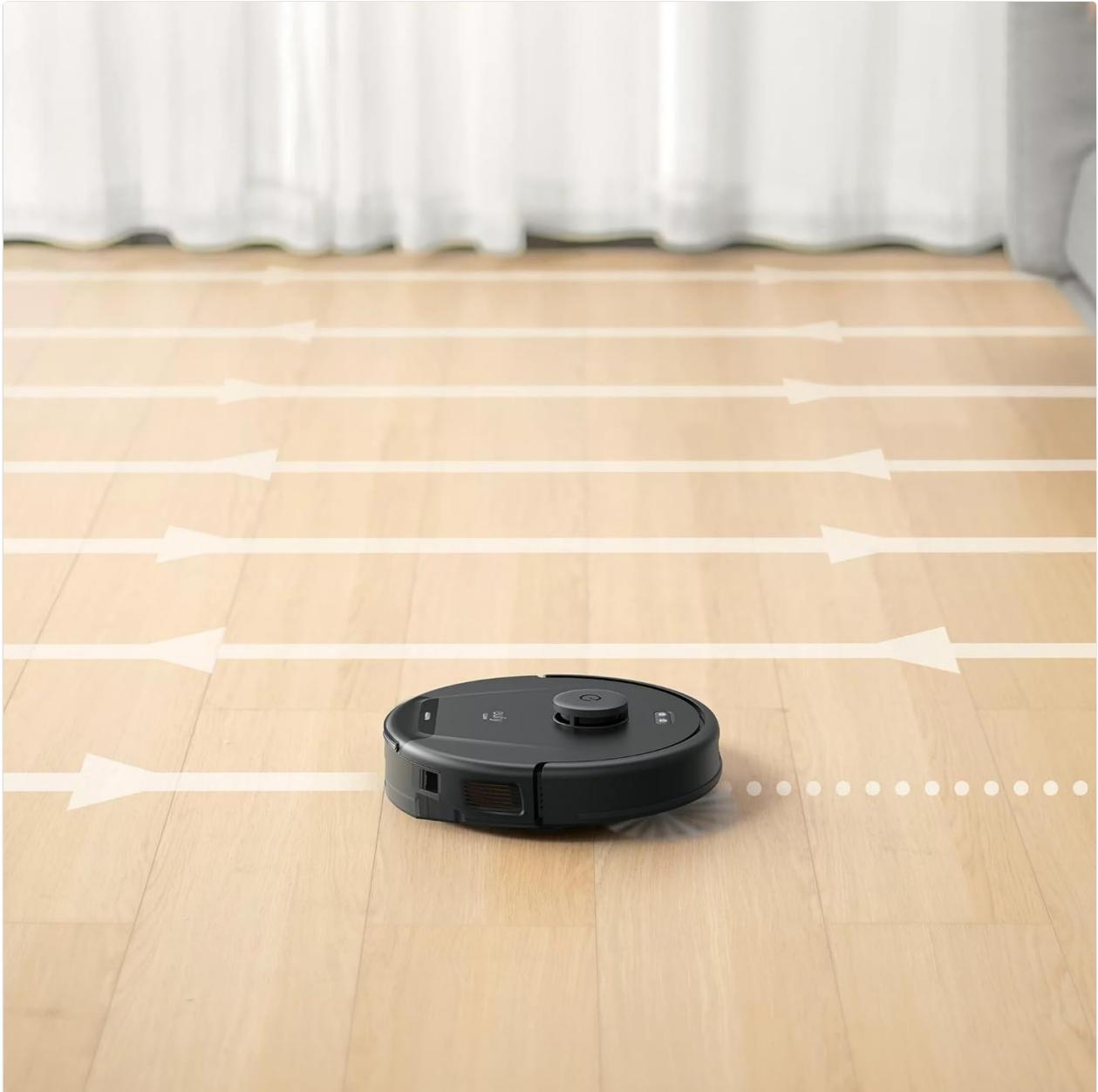
Image: The eufy L50 SES Robot Vacuum cleaning a floor in a systematic, back-and-forth pattern, indicating its efficient navigation.

Press the Start/Pause button on the robot or use the eufy Clean app to begin a cleaning cycle. The robot will automatically map your home and clean efficiently.