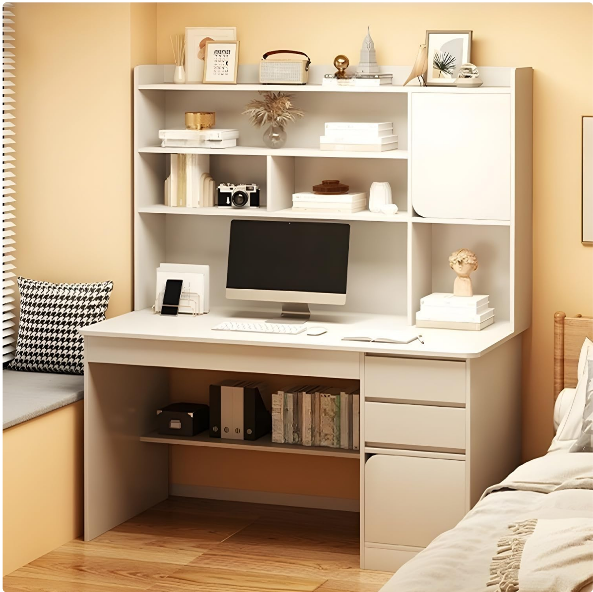
Image 5.1: The LITFAD Contemporary Rectangular Credenza Desk integrated into a room setting. This image demonstrates the desk's functionality as a computer workstation with extensive storage, including open shelves and drawers, suitable for a modern living space.