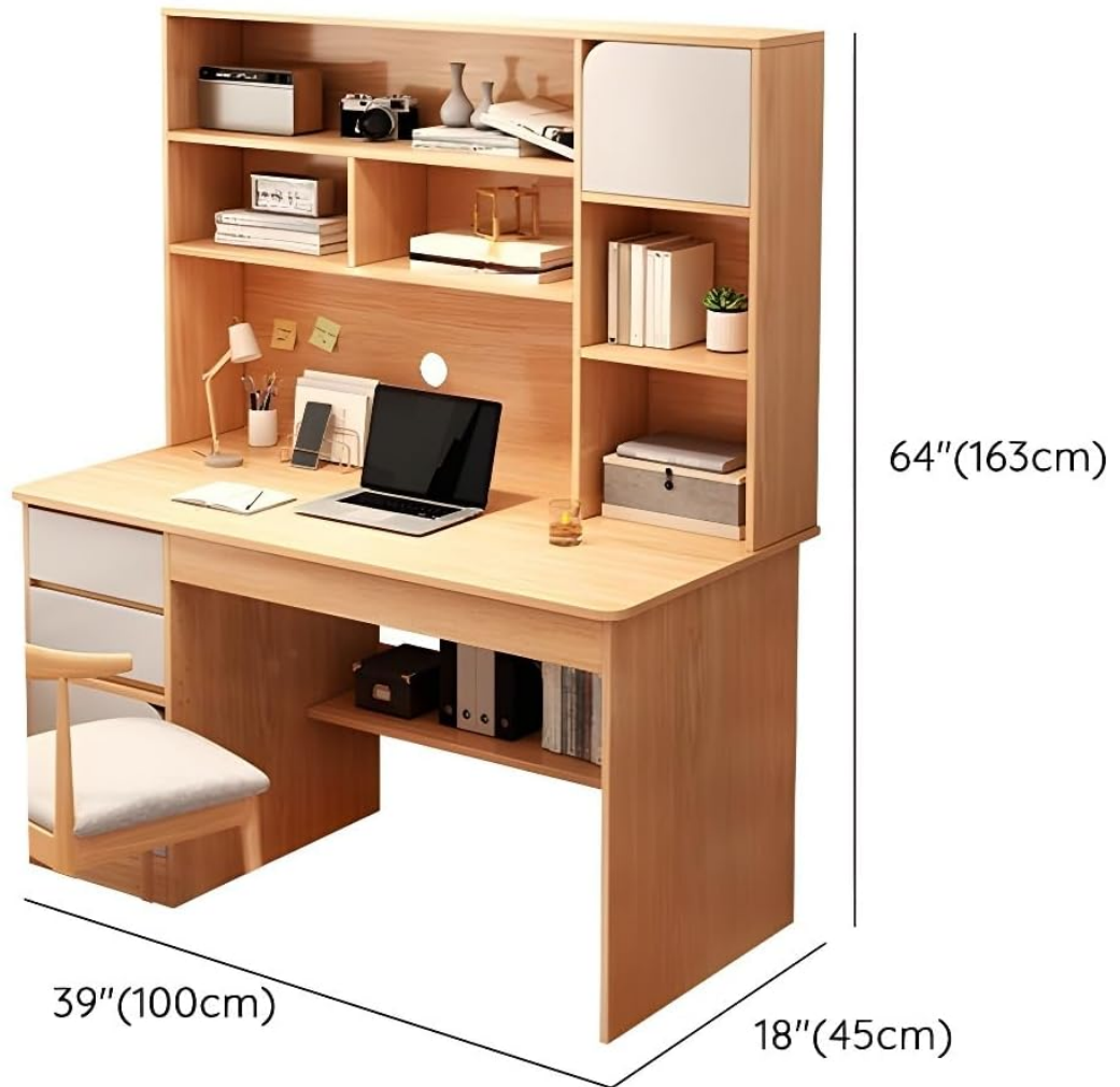
Image 4.1: Dimensional view of the LITFAD Contemporary Rectangular Credenza Desk. This image illustrates the overall length, width, and height of the desk, which are 39 inches (100cm) L, 18 inches (45cm) W, and 64 inches (163cm) H, respectively.