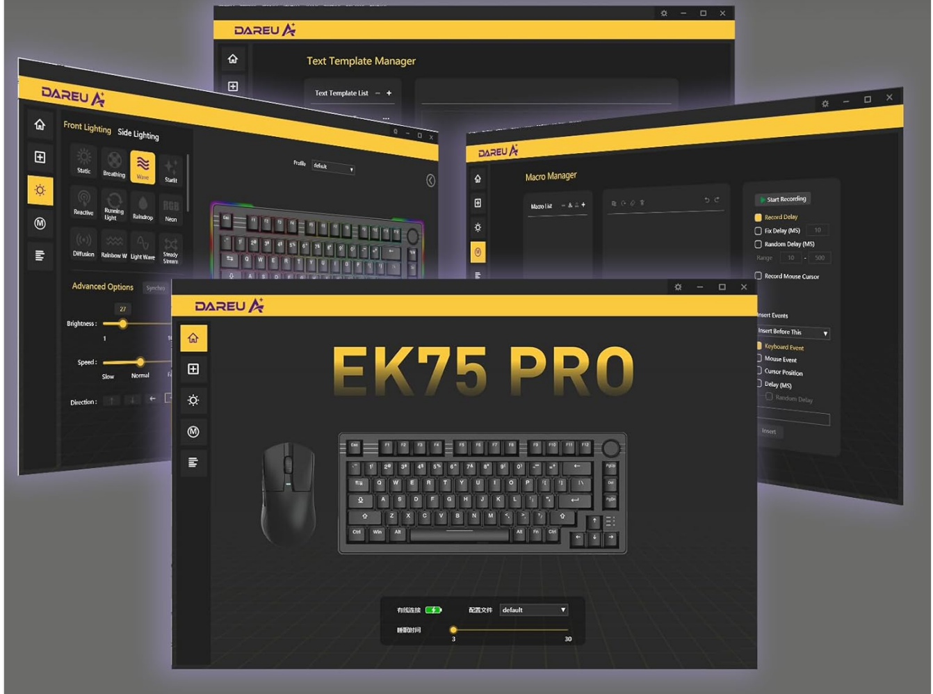
Image: Multiple screenshots displaying the user interface of the DAREU A+ driver, showing options for lighting control, macro management, and general settings for the EK75PRO keyboard and a DAREU mouse.

DAREU A+ driver enables unified and integrated management of the latest keyboard and mouse, easily customize all keys and RGB lighting.