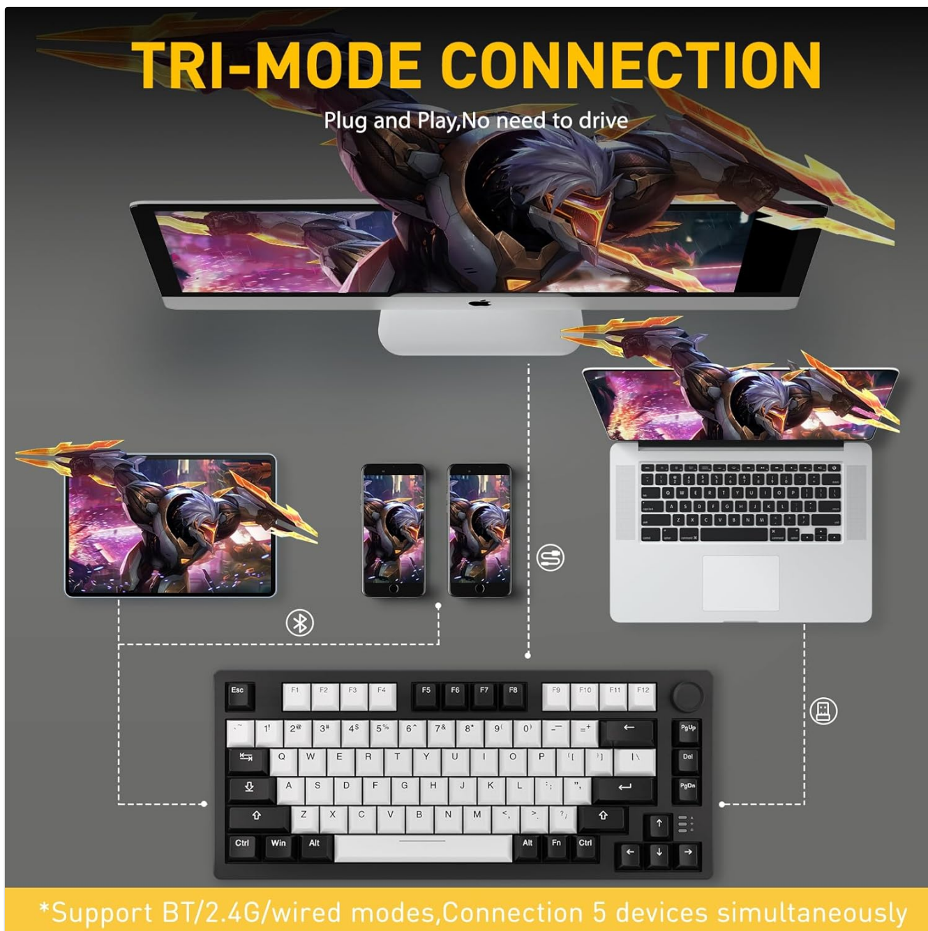
Image: An illustration demonstrating the tri-mode connectivity of the DAREU EK75PRO, showing connections to a desktop PC, laptop, tablet, and two smartphones via Bluetooth, 2.4G wireless, and USB-C wired modes.