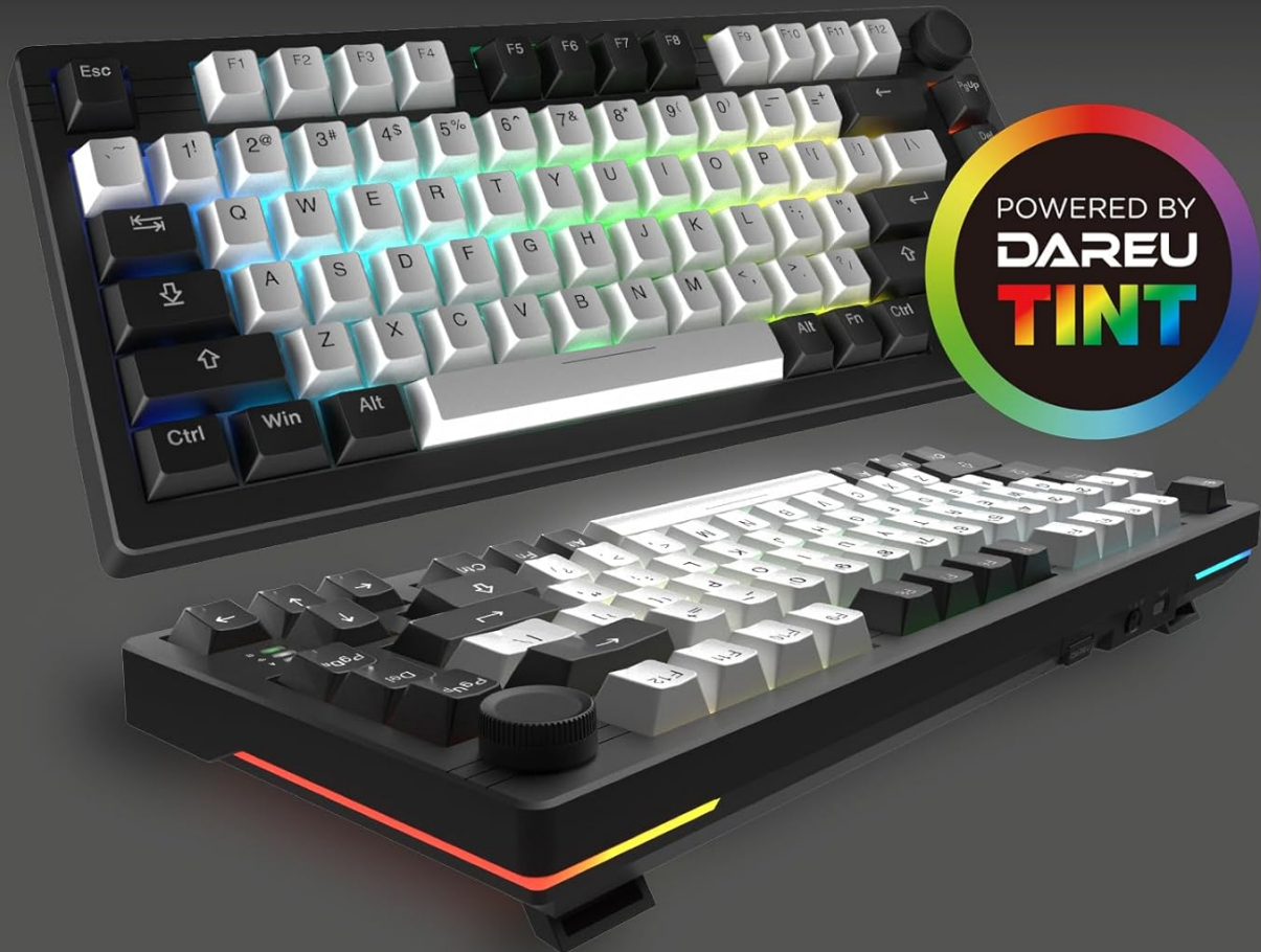
Image: The DAREU EK75PRO keyboard showcasing its vibrant RGB backlighting, with the DAREU TINT logo indicating software control for customization.

South-facing RGB design provide clearer typing environment Backlit modes and side light strip are customizable