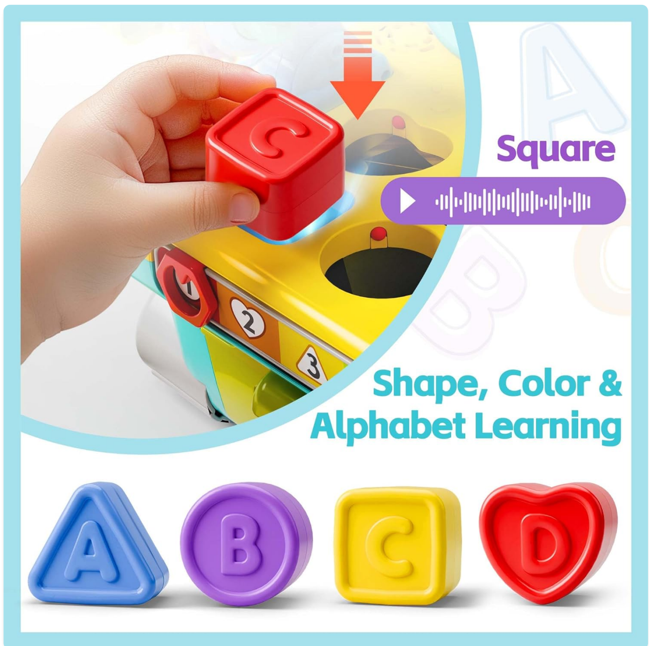
Image 3.2: Close-up of the shape sorter, showing the various shapes and their corresponding slots.