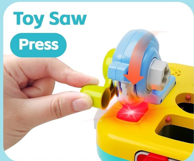
Image 3.3: The musical number slider and interactive toy drill and saw features.