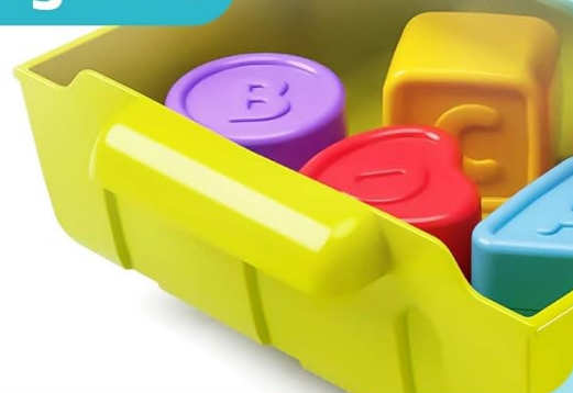
Image 3.4: Demonstrates the fine motor skill activities, including screws, bench clamp, and toy storage drawer.