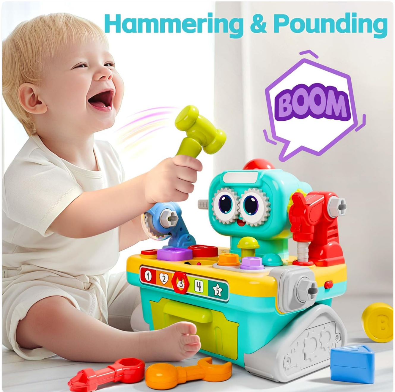
Image 3.1: A child engaging with the pounding game feature of the workbench.

Use the included toy hammer to pound the colorful pegs on the workbench surface. This action activates lights and sounds, enhancing the play experience and developing hand-eye coordination.