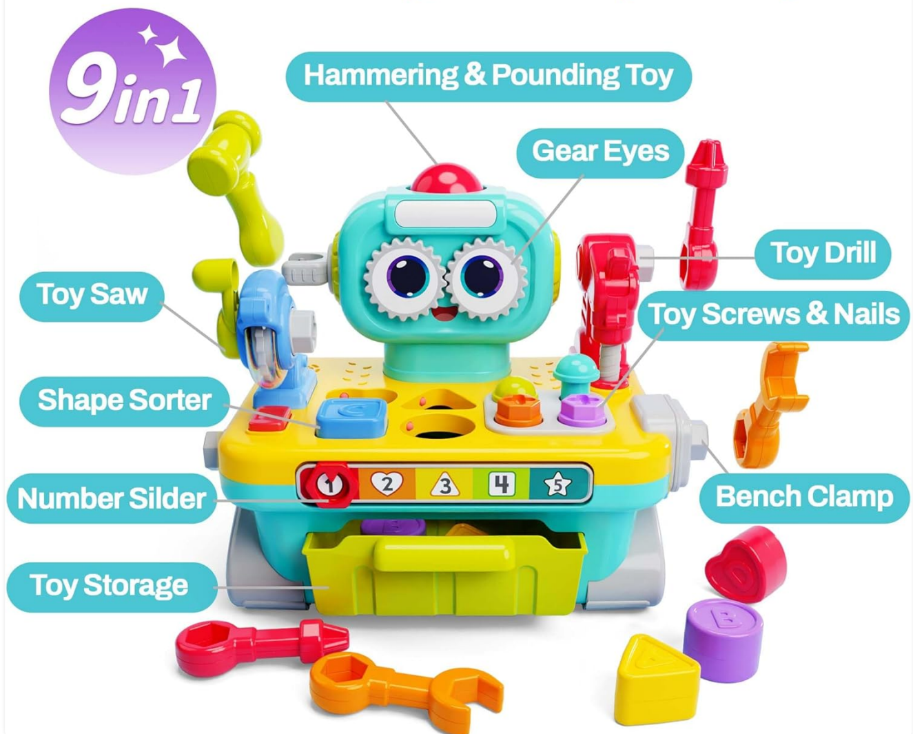
Image 3.5: An overview of the workbench highlighting its 9-in-1 features, including hammering, gear eyes, toy drill, toy saw, shape sorter, number slider, toy screws & nails, bench clamp, and toy storage.