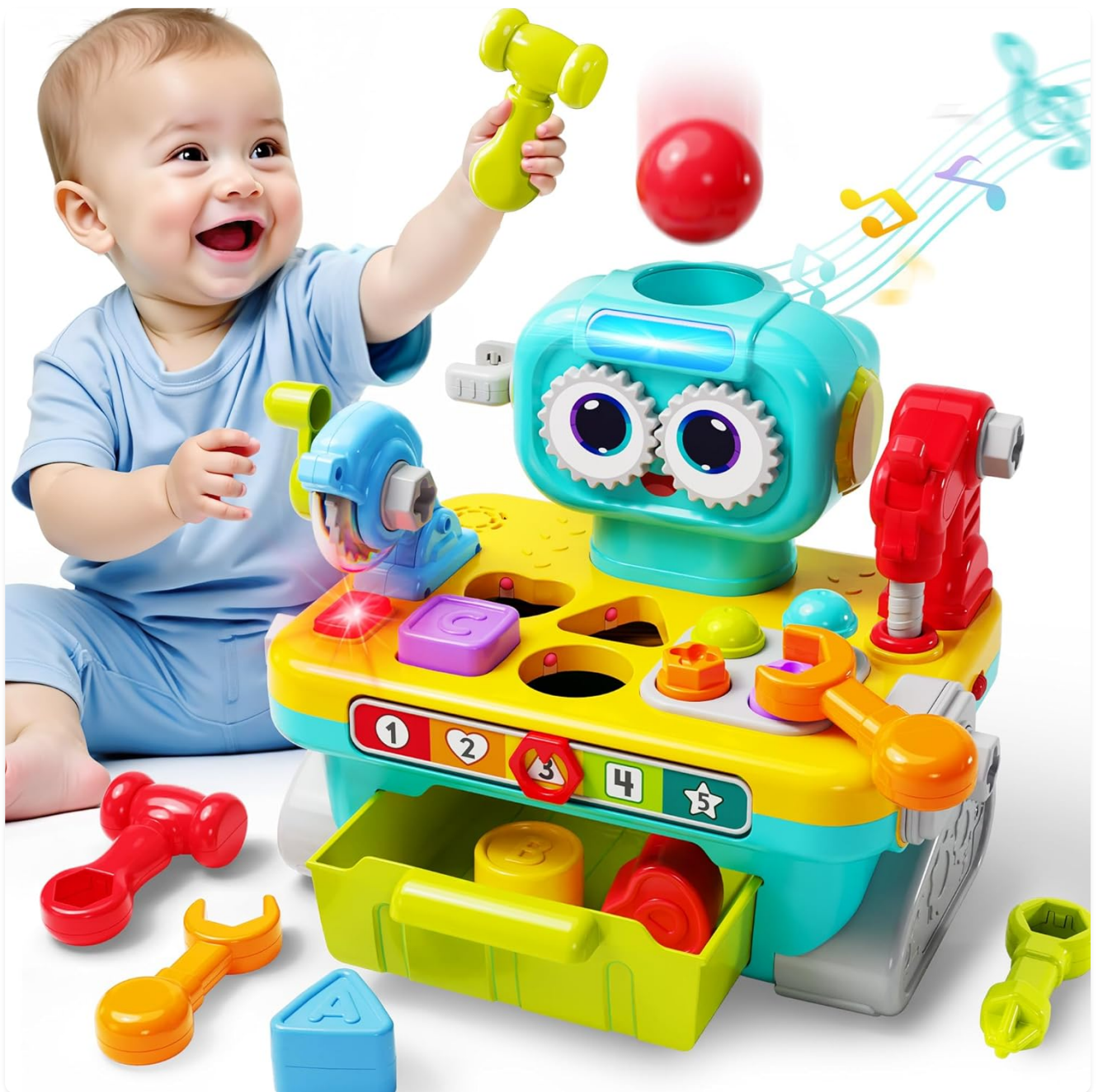
Image 1.1: The iPlay, iLearn Toddler Musical Workbench in use, showing a baby interacting with the toy.