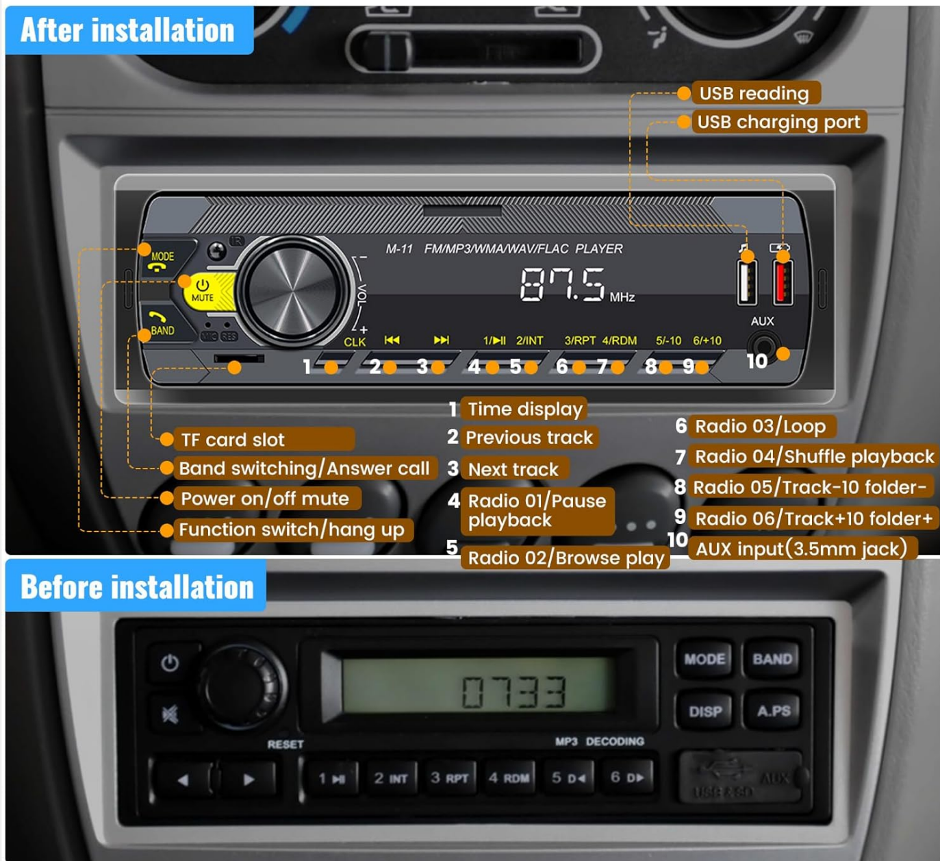
Image: Depicts the car stereo before and after installation, highlighting key components and their functions, such as USB reading, USB charging port, TF card slot, and various button functions.

If you encounter any difficulties during installation, please contact customer support for online assistance.