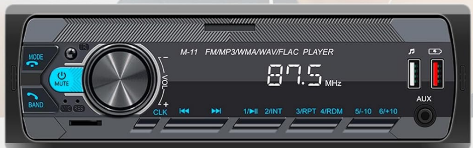
Image: Illustrates the FM Radio function for real-time traffic, news, and weather, and the Bluetooth hands-free calling feature with BT 5.0 for wireless connection and voice navigation.