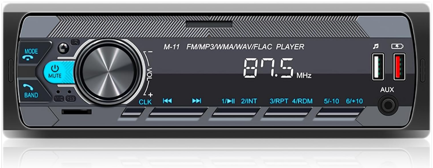
Image: Front view of the SIXWIN Single Din Car Stereo P1, showing the display, control knob, buttons, USB ports, and AUX input.

The SIXWIN Single Din Car Stereo P1 is a versatile car audio receiver designed to enhance your in-car entertainment and communication. It features Bluetooth 5.0 for hands-free calling and audio streaming, FM radio with preset stations, and multiple media playback options including USB, TF card, and AUX input. The unit also supports voice control and app-based remote control for convenient operation.