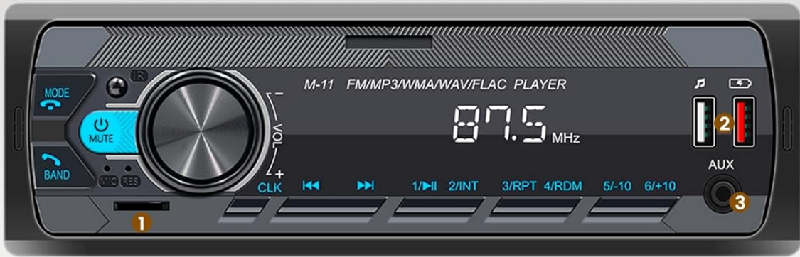
1. TF Card (Optional)