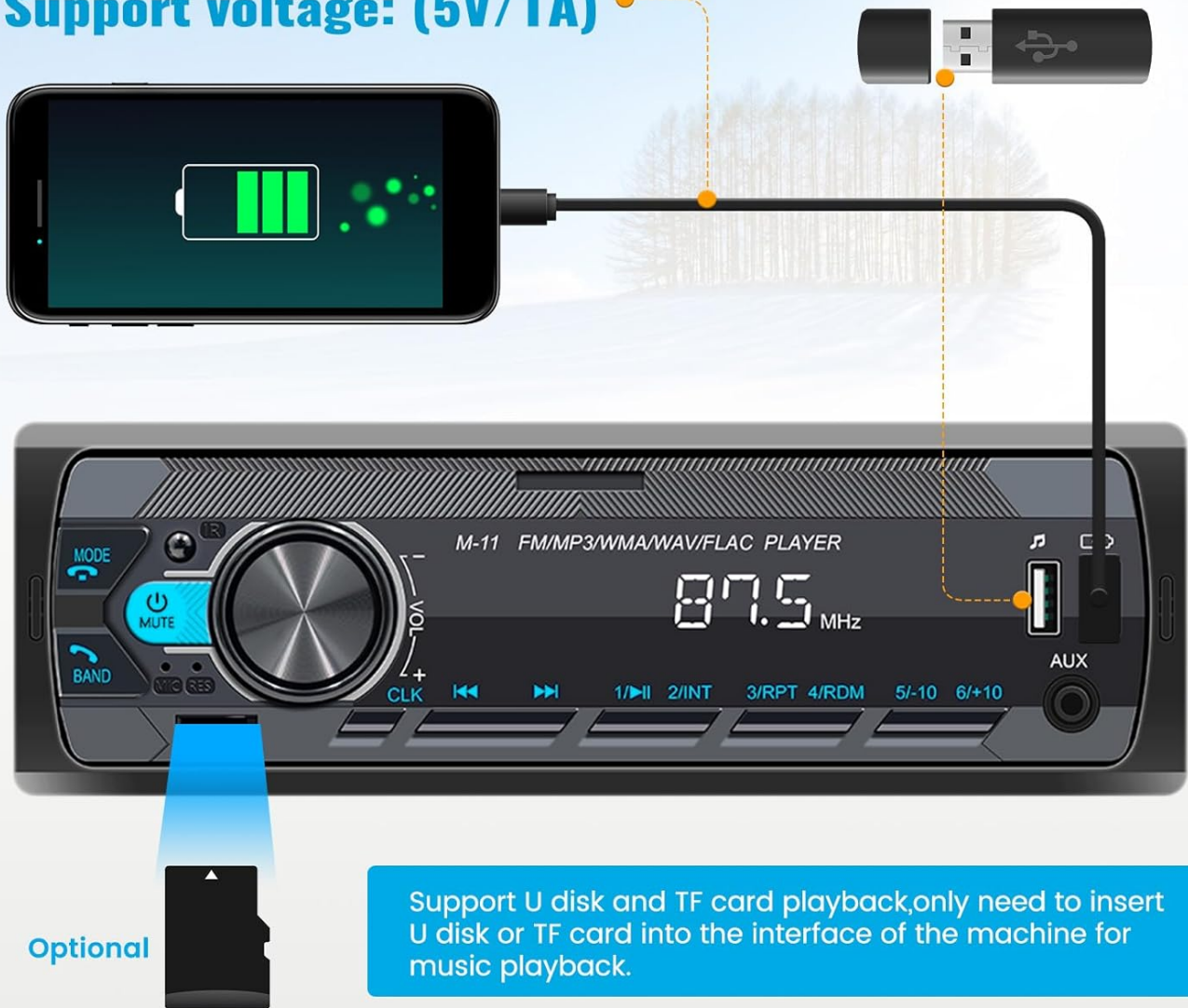
Image: Shows the USB and TF card slots, indicating support for U disk reading, TF card playback, and USB charging (5V/1A).