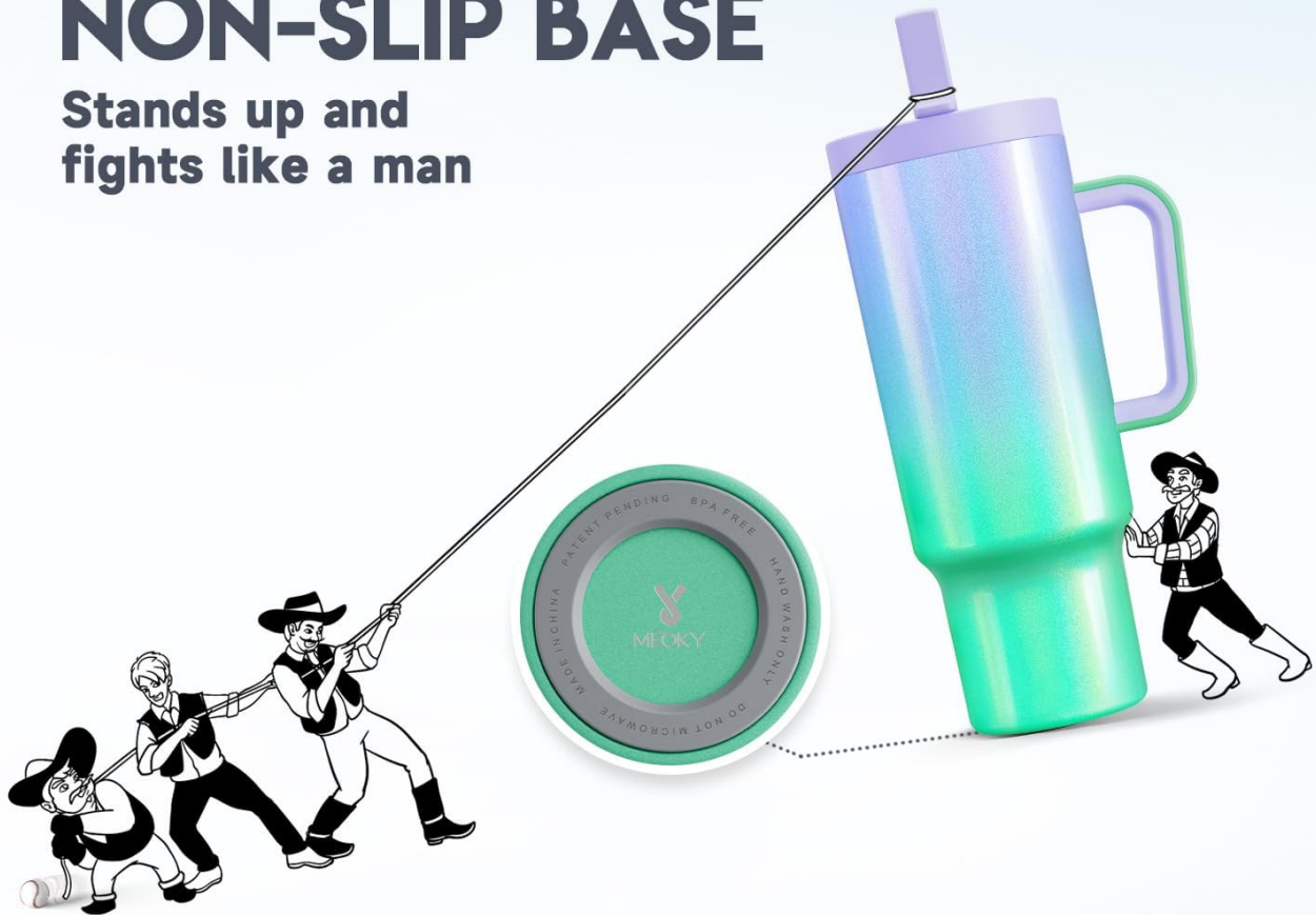
Figure 7: Non-Slip Base

Your browser does not support the video tag.