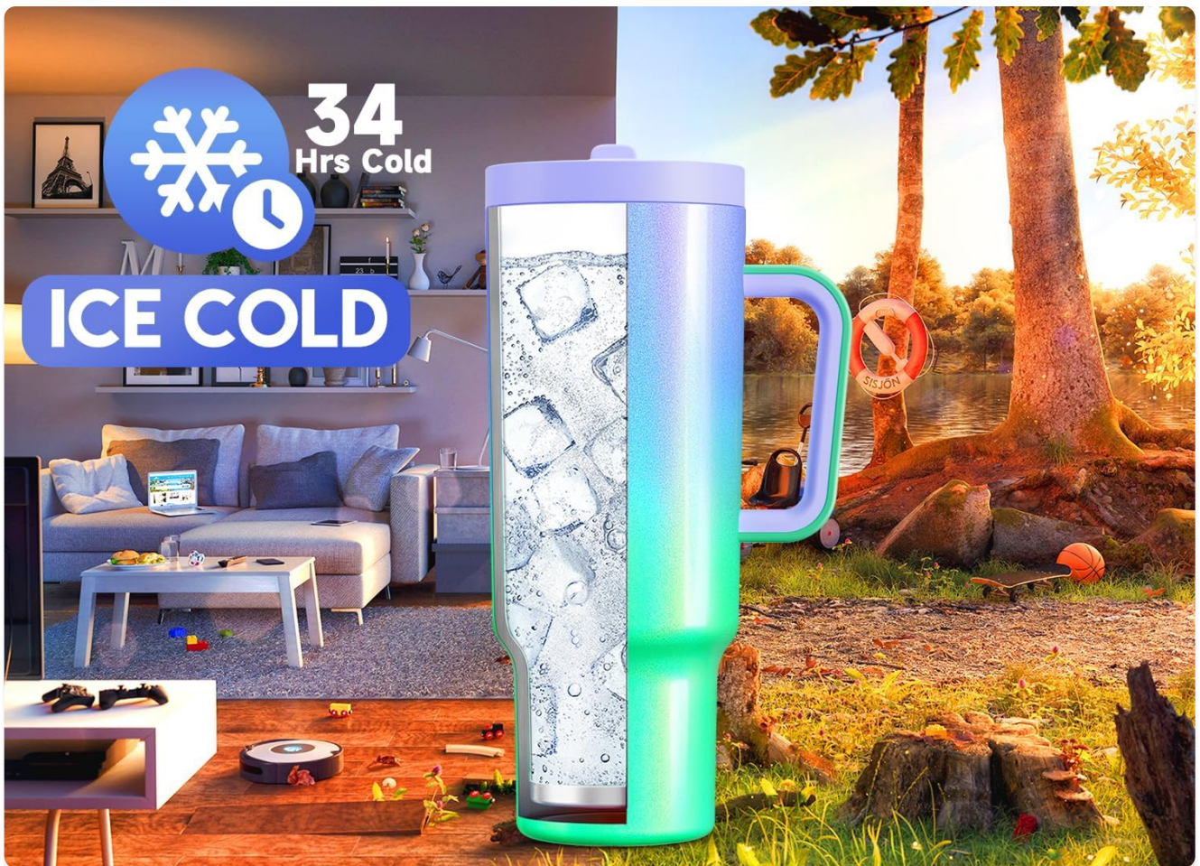
Figure 8: Tumbler with Ice, illustrating cold retention