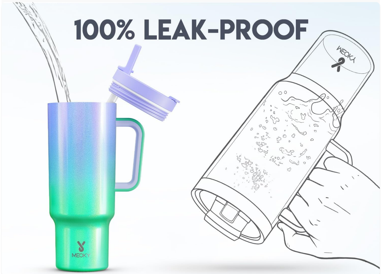
Figure 2: Tumbler Lid and Straw Components