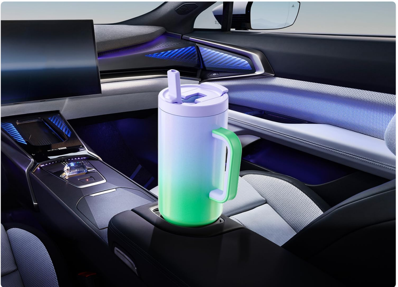
Figure 5: Tumbler in Car Cupholder