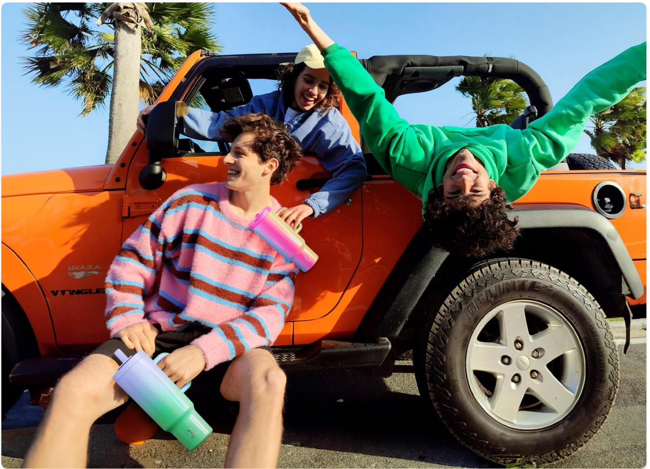
Figure 4: Demonstrating Leak-Proof Feature