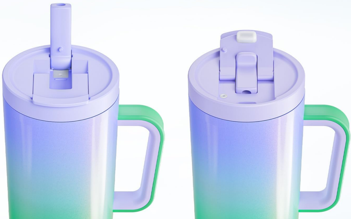
Figure 3: Two Ways to Drink