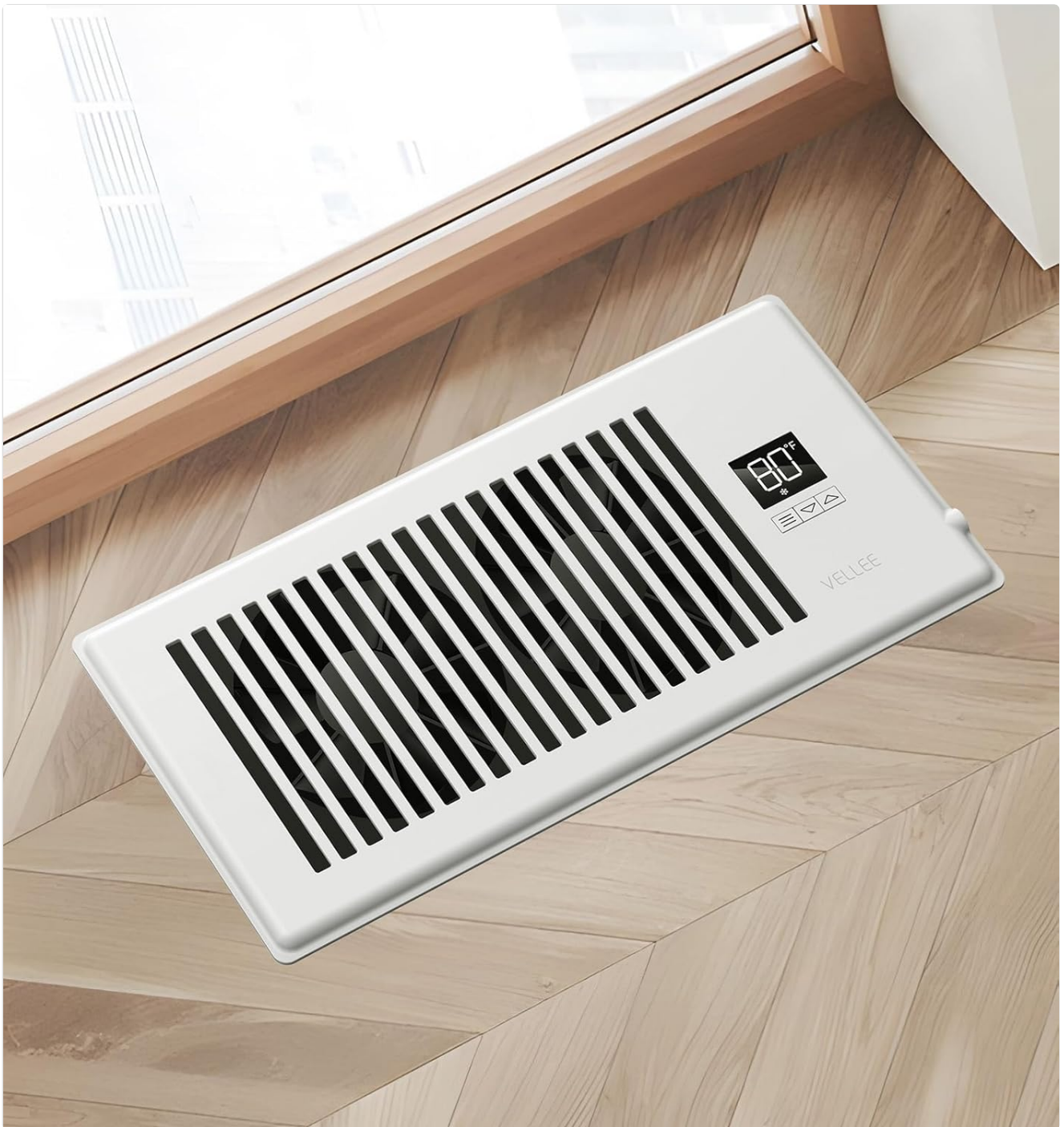
Figure 5: Elevate your HVAC's airflow and enhance comfort.