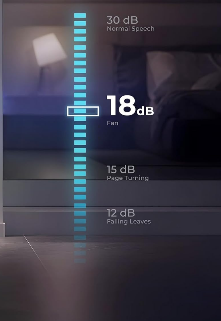
Figure 4: The VELLE AirBlow T4 minimizes noise for a tranquil night's sleep.