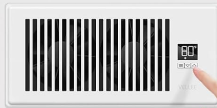
Figure 3: Effortlessly set once for smart, automatic running.