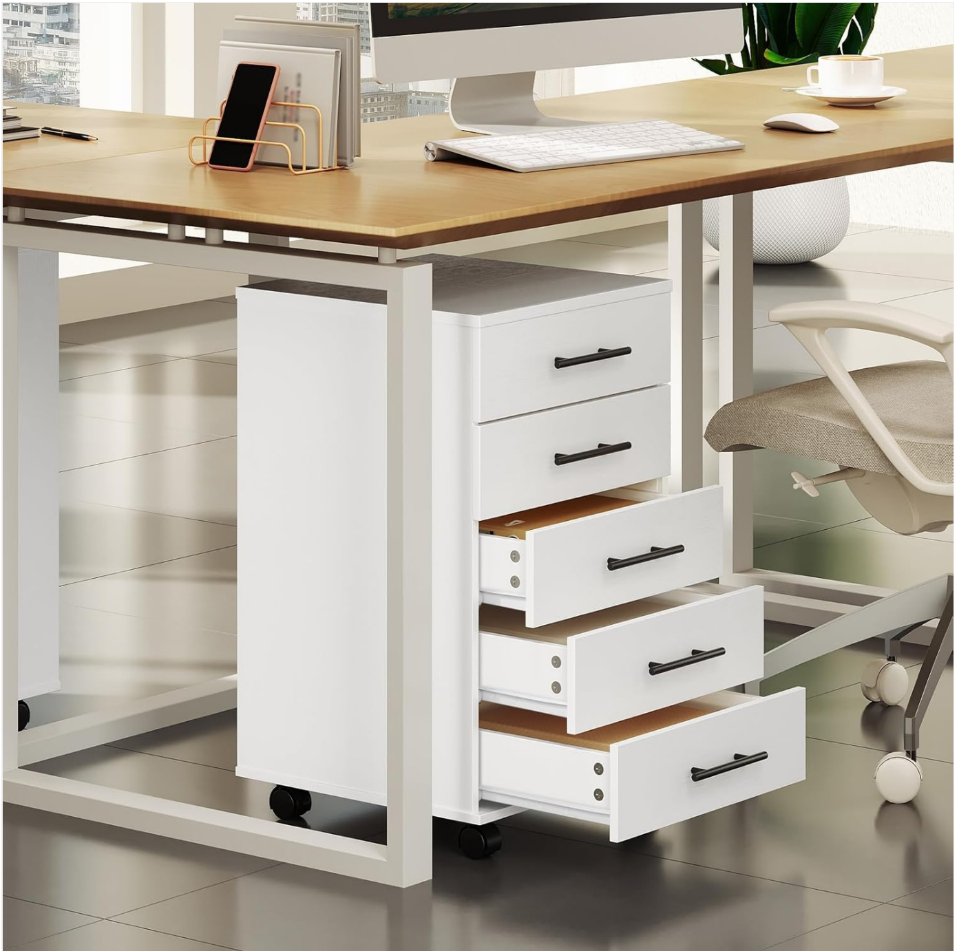
Image: The HOOBRO 5-Drawer File Cabinet positioned under a desk, showcasing its compact design and accessible drawers.

The assembly process is designed to be straightforward. Take your time and refer to the detailed diagrams in the included instructions for best results.