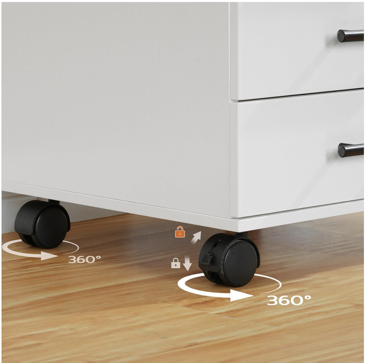
Image: Detail of the cabinet's casters, illustrating the 360-degree rotation and the locking mechanism for stability.