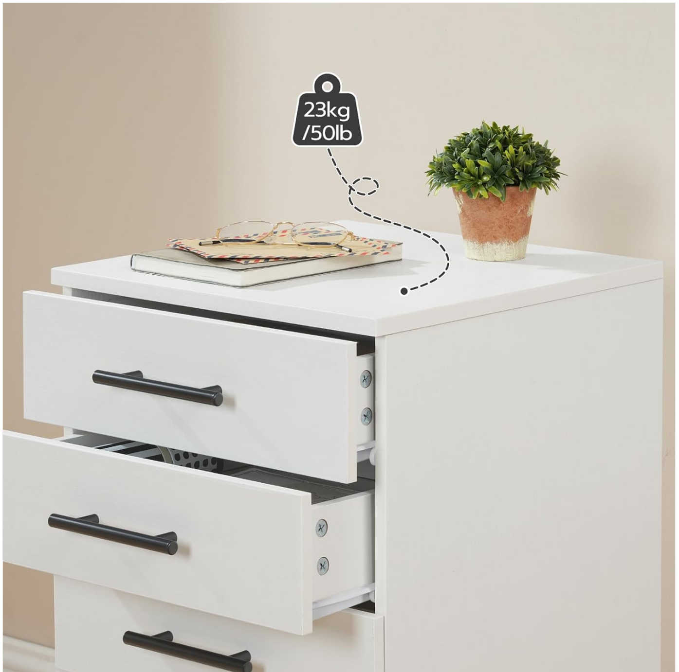
Image: The top surface of the cabinet with a book and glasses, demonstrating its capacity to hold up to 50 lbs.