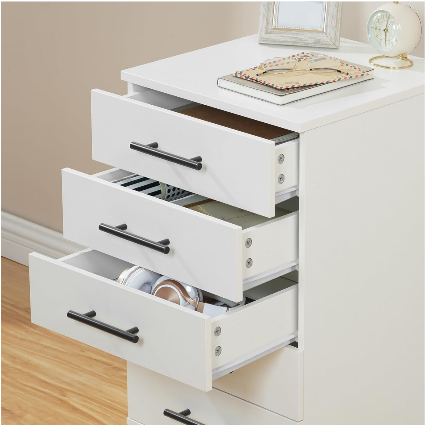
Image: A close-up view of the cabinet with several drawers open, demonstrating its storage capacity for various items.