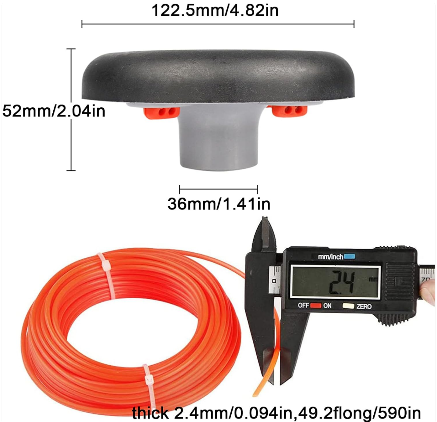
Figure 6: Detailed dimensions of the trimmer head and the included trimmer line thickness.