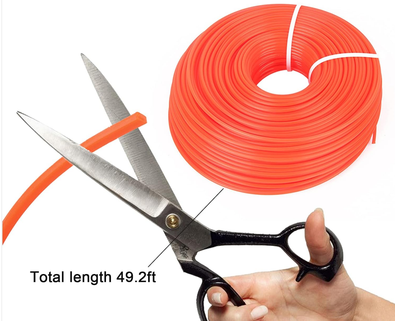
Figure 3: Preparing trimmer line by cutting segments from the main roll. The included line is 49 feet long.

Can cut different lengths according to different needs