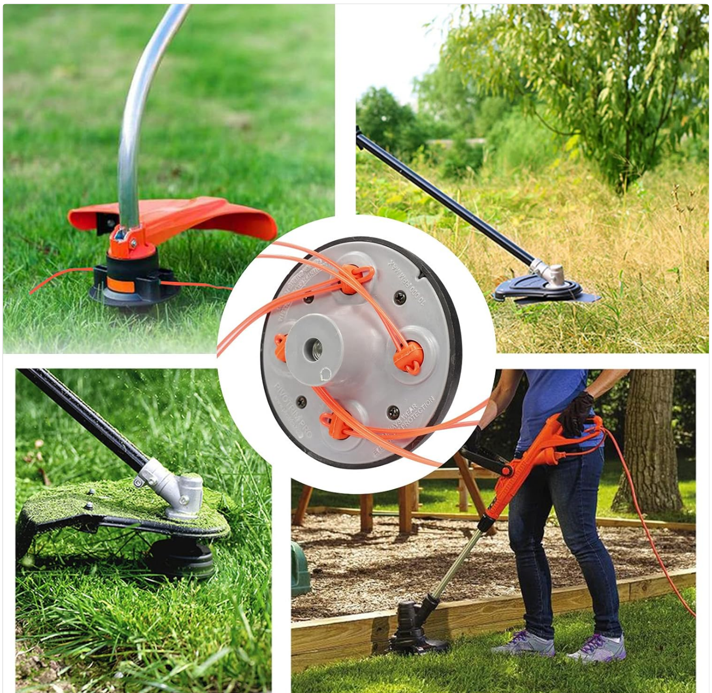
Figure 2: Examples of the trimmer head installed on various string trimmer models, demonstrating its universal fit for compatible shafts.