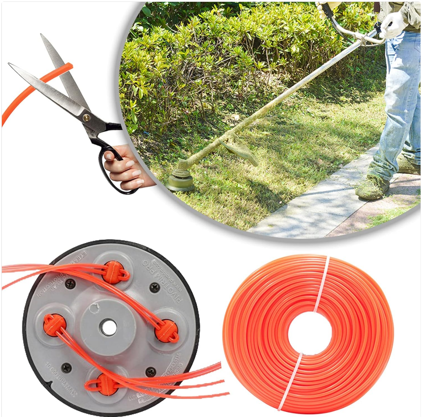
Figure 4: Visual representation of the trimmer head, the trimmer line, and the process of cutting the line for replacement.