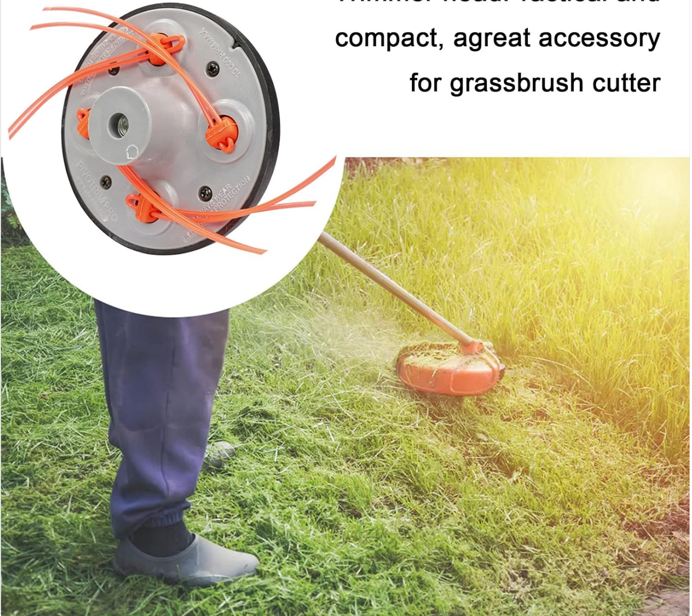
Figure 5: The trimmer head in action, demonstrating its use for cutting grass and light brush.