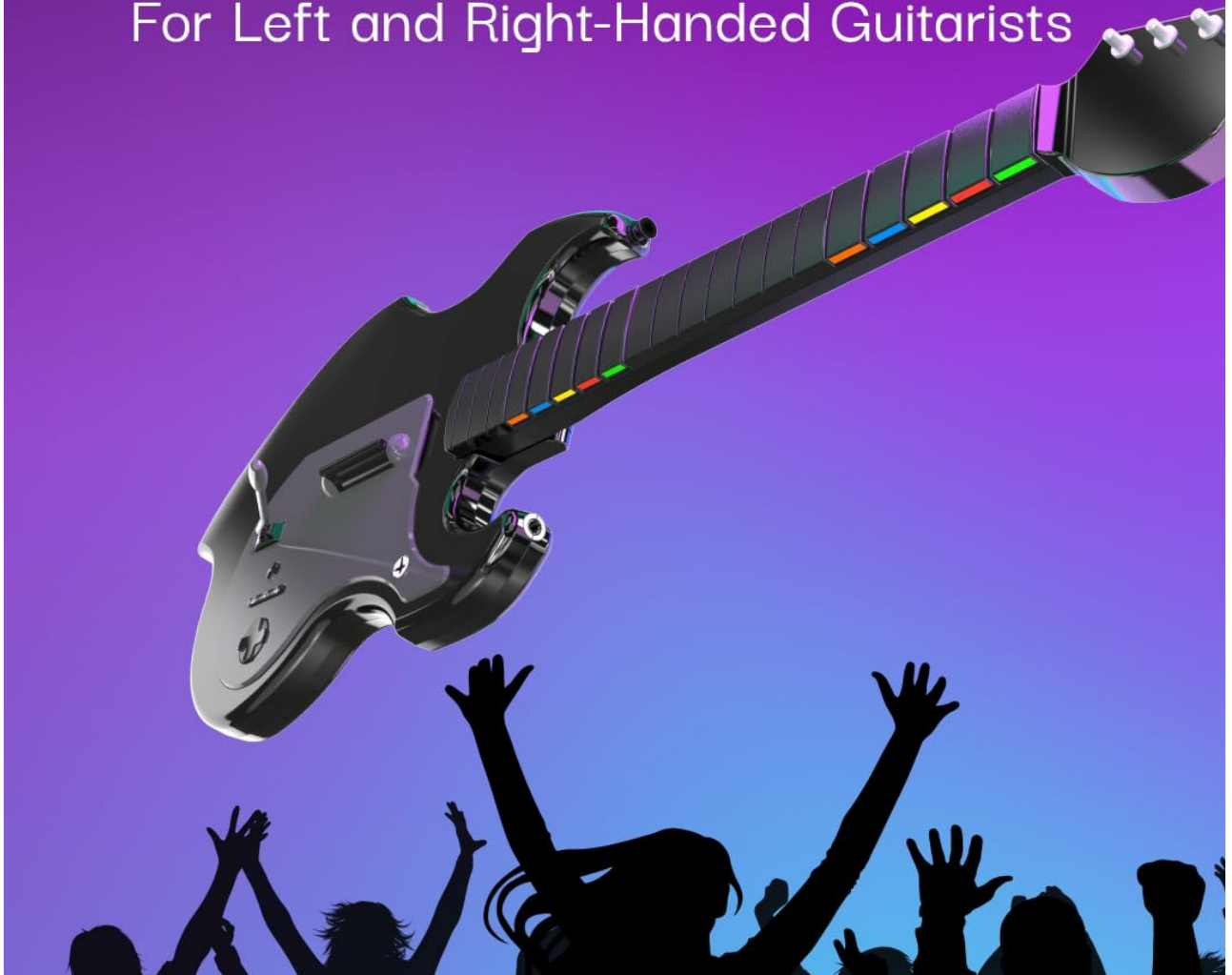
Image: The RIFFMASTER guitar controller shown in an ergonomic design, highlighting its adaptability for both left and right-handed users.