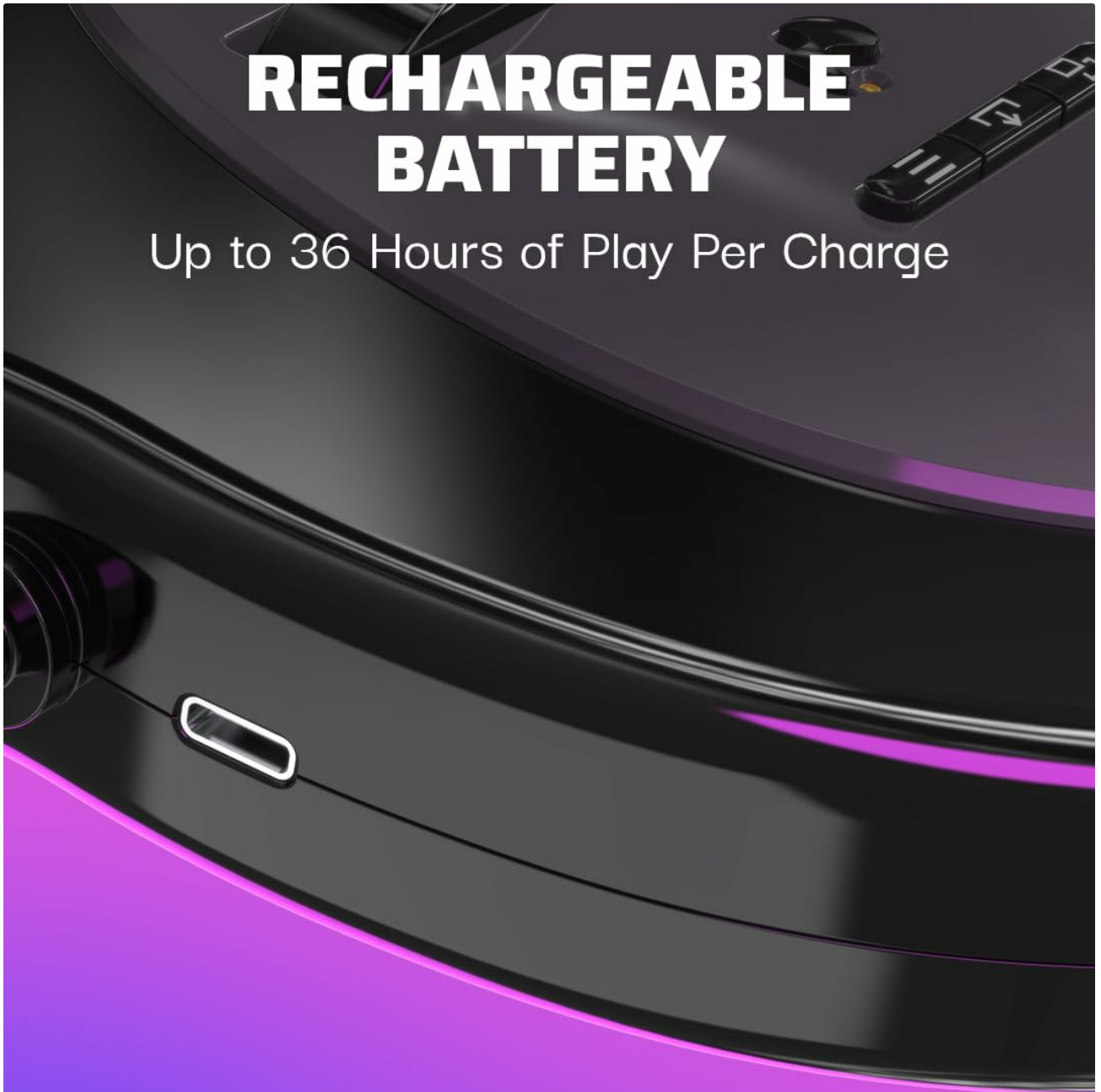
Image: A close-up view of the RIFFMASTER's USB-C charging port, highlighting its rechargeable battery feature.