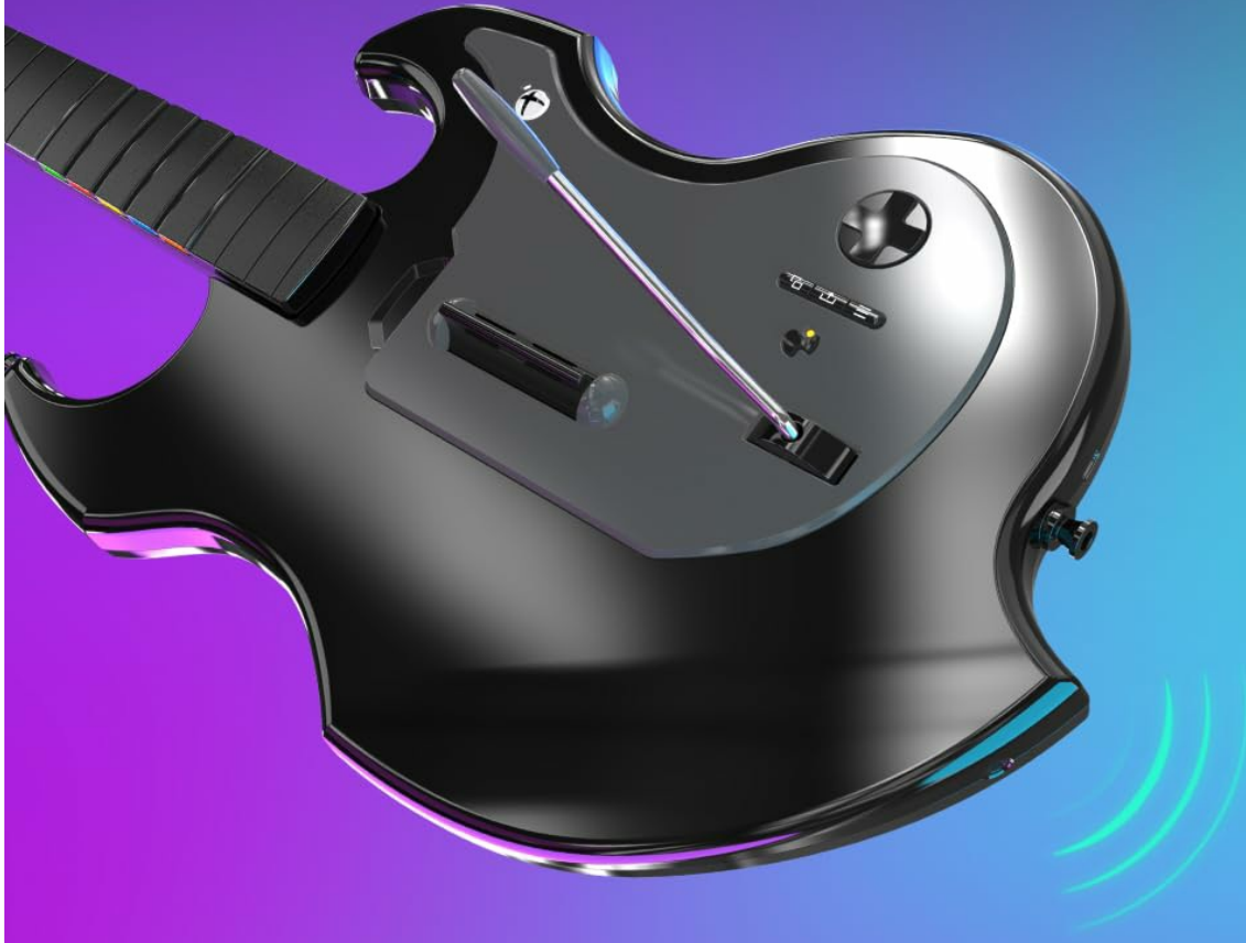
Image: A detailed view of the guitar controller's body, illustrating its wireless compatibility and low-latency connection.