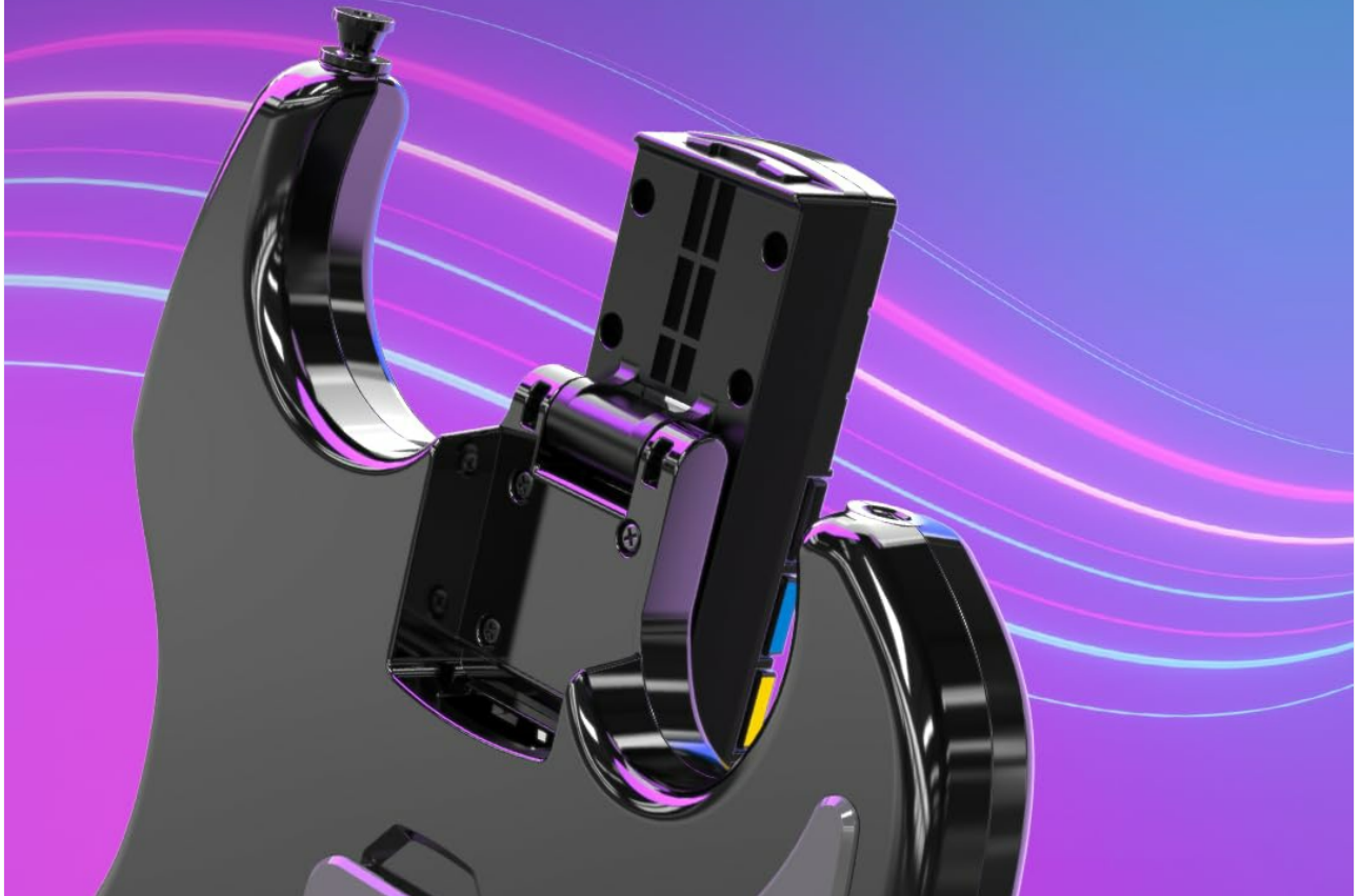
Image: The RIFFMASTER guitar controller demonstrating its collapsible neck, designed for comfort, convenience, and easy storage.

With Shoulder Strap and Collapsible Guitar