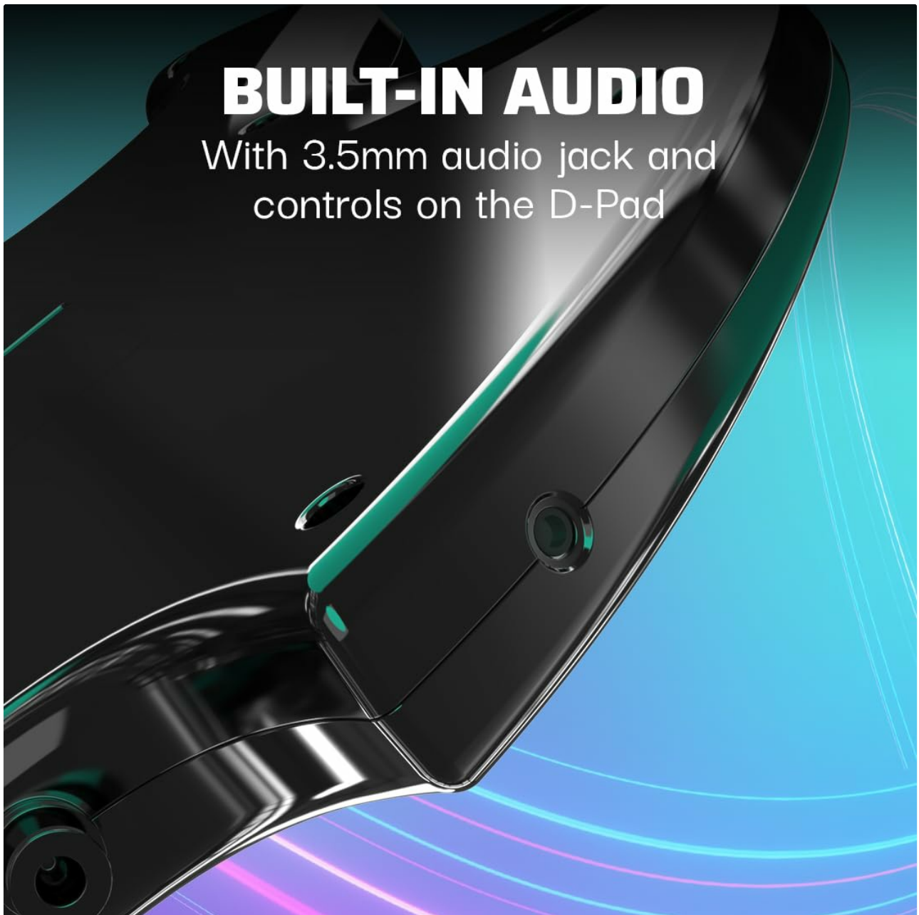
Image: A close-up of the RIFFMASTER's body, showing the 3.5mm audio jack and integrated D-pad controls for on-the-fly volume adjustments.