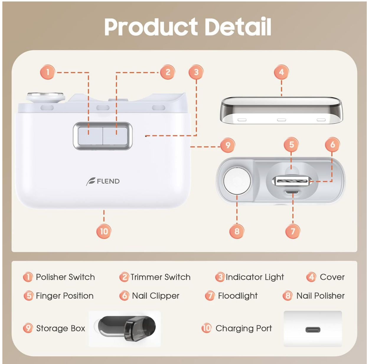
Image: Detailed view of the electric nail clipper highlighting its various components.

Familiarize yourself with the different parts of your Bubbacare Electric Nail Clipper & Trimmer: