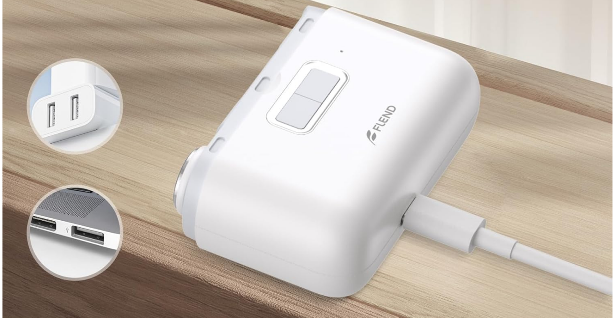
Image: The device features a Type-C charging port for convenient and fast charging.