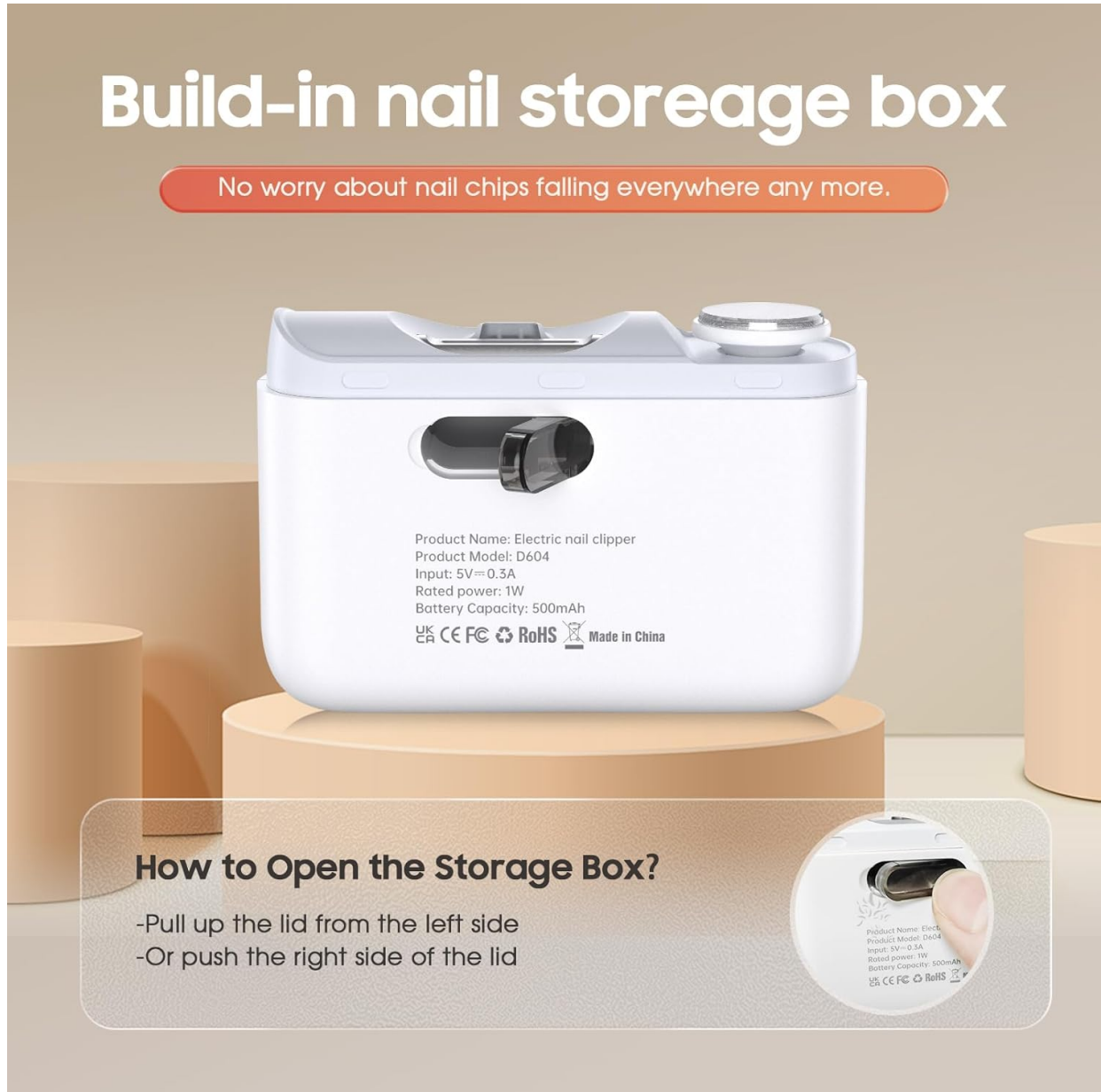
Image: Instructions on how to open the integrated nail storage box for easy cleaning and disposal of nail debris.