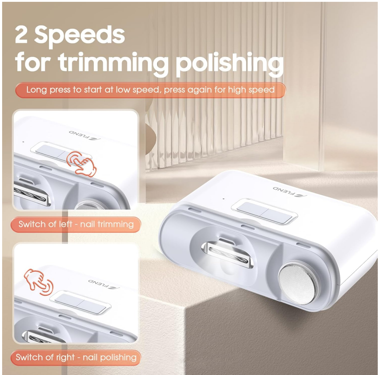
Image: The device features distinct switches for nail trimming and polishing, along with two speed settings for customized use.