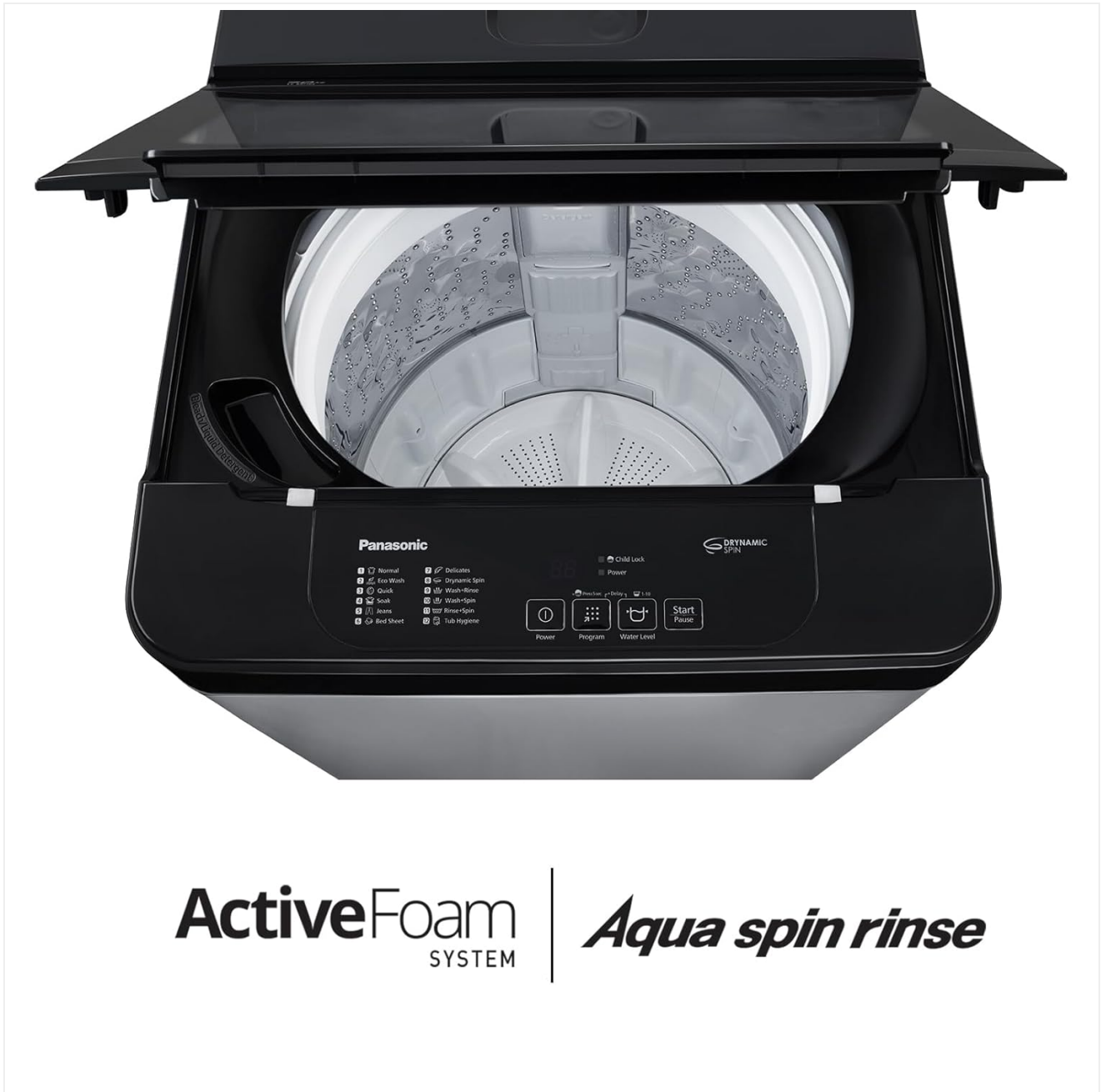
Figure 4.1: Top view of the washing machine showing the control panel with program selections and the interior drum.

The washing machine features a knob control console for selecting wash programs and settings.