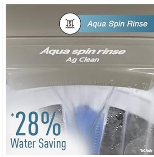
Figure 4.4: Visual representation of the Aqua Spin Rinse feature, highlighting water saving.