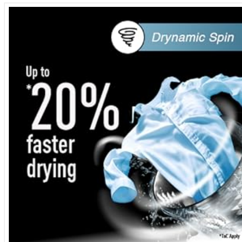
Figure 4.6: Visual demonstrating the Dynamic Spin feature for accelerated drying.