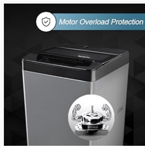
Figure 4.10: Illustration of the motor with overload protection, ensuring durability.