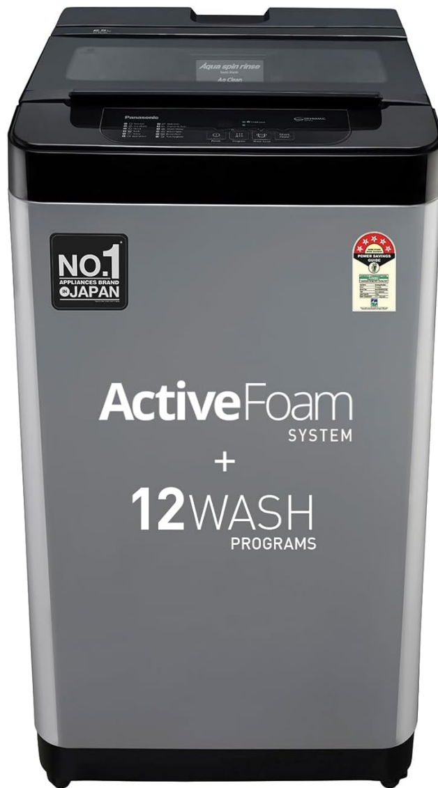
Figure 1.1: Front view of the Panasonic NA-F65LF3CRB 6.5 Kg Fully-Automatic Top Load Washing Machine in Charcoal Inox Grey.