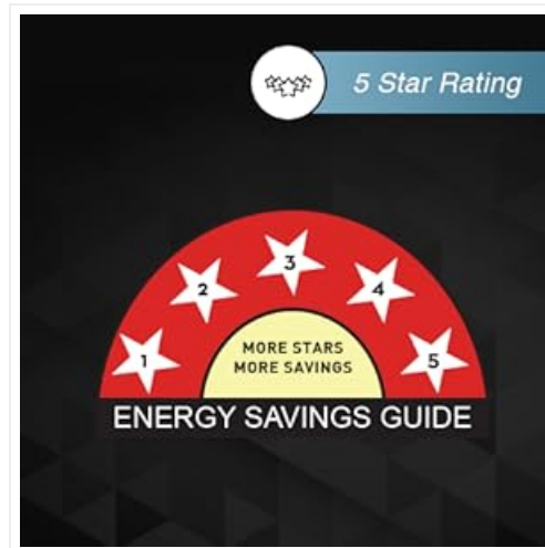
Figure 7.1: The 5 Star Energy Savings Guide, indicating high efficiency.