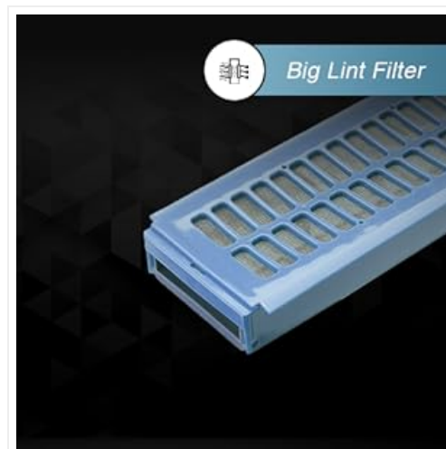
Figure 4.9: Image showing the Big Lint Filter, designed for efficient lint collection.