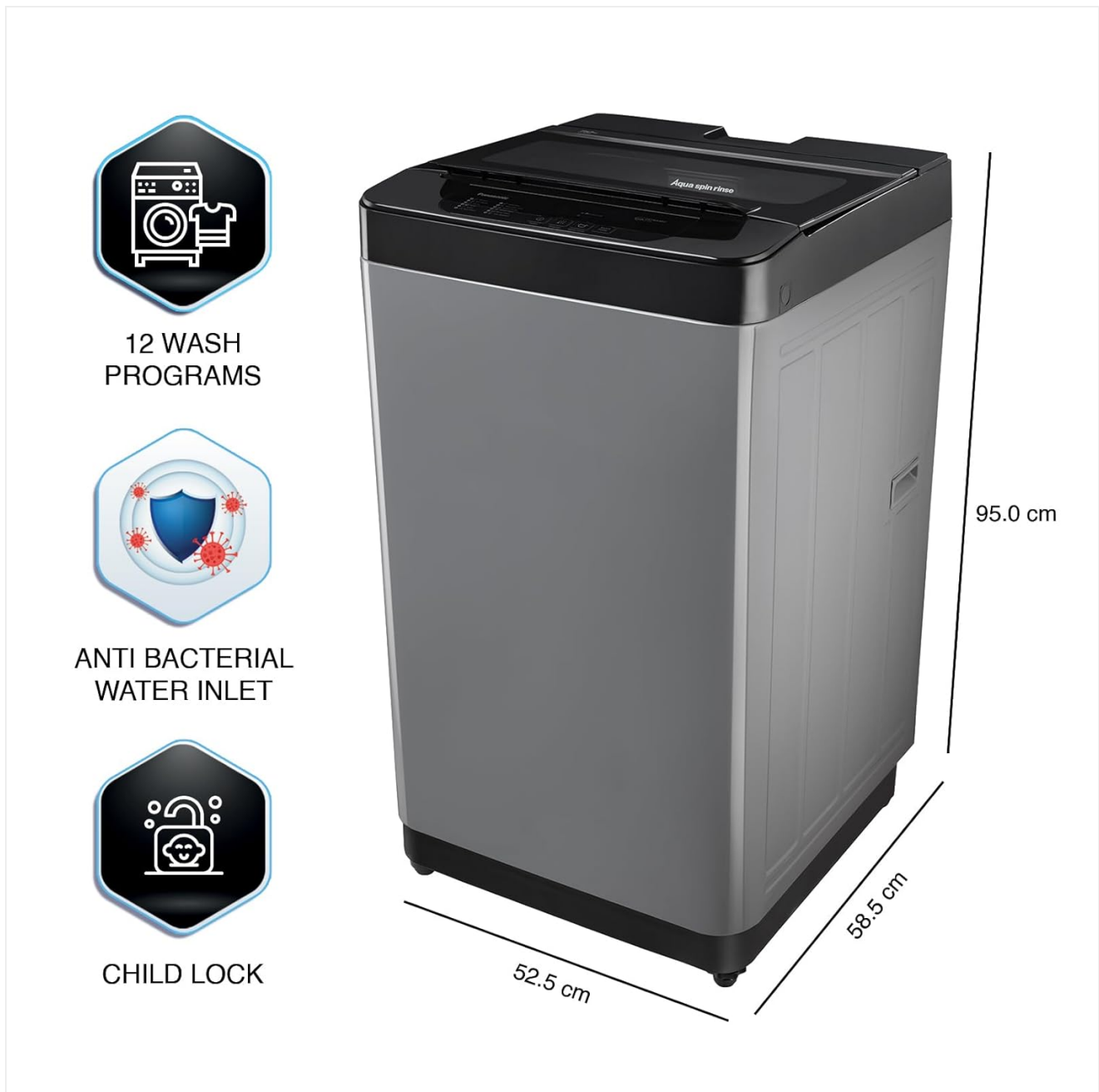
Figure 3.1: Side view illustrating the washing machine's dimensions (95.0 cm height, 52.5 cm width, 58.5 cm depth) and key features like 12 wash programs, anti-bacterial water inlet, and child lock.

Place the washing machine on a firm, level surface. Ensure there is adequate space around the unit for ventilation and access. The dimensions of the unit are approximately 58.5 cm (Depth) x 52.5 cm (Width) x 91 cm (Height).