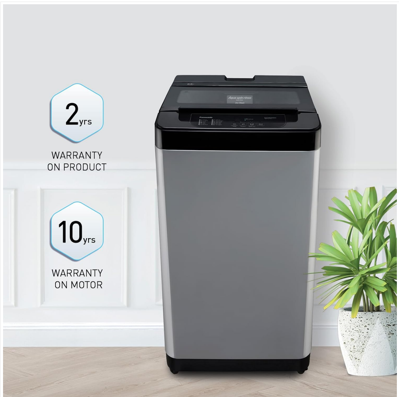
Figure 8.1: Visual representation of the 2-year product warranty and 10-year motor warranty.