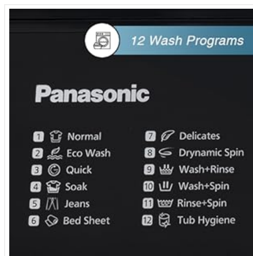
Figure 4.2: Detailed view of the control panel displaying the 12 available wash programs.