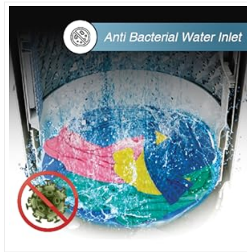
Figure 4.7: Image illustrating the Antibacterial Water Inlet, promoting hygienic washing.