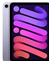
iPad Mini Series