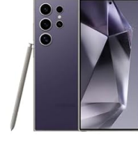
Samsung S24/23 Series