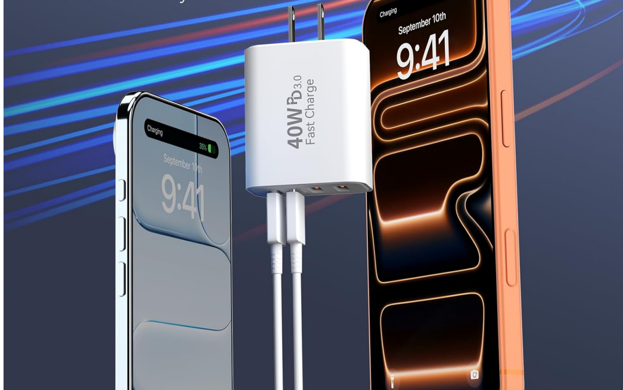
Image: The Duloch charger connected to two iPhones, illustrating its fast charging capability, achieving up to 3 times faster charging speeds.

Charge iPhone 17/16 from 0% to 60% only in 30mins