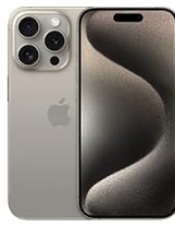
iPhone 15 Series