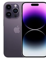
iPhone 14 Series