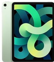
iPad Air Series