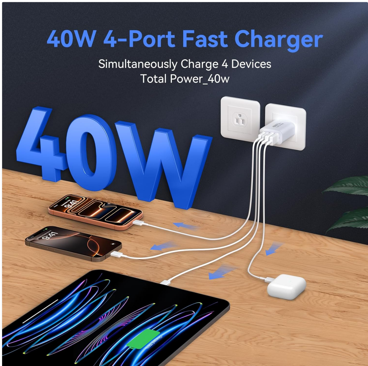
Image: The Duloch charger plugged into a wall outlet, simultaneously charging two smartphones, a tablet, and wireless earbuds, demonstrating its multi-device capability.

3. Verify Charging: Confirm that your devices indicate they are charging.