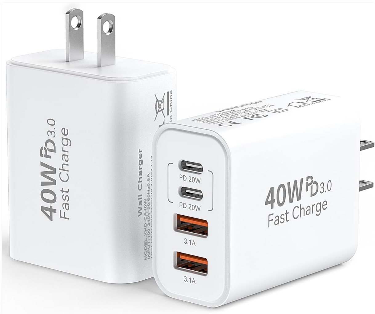
Image: Front and side view of the Duloch 40W 4-Port USB C Wall Charger, highlighting its compact design and multiple ports.