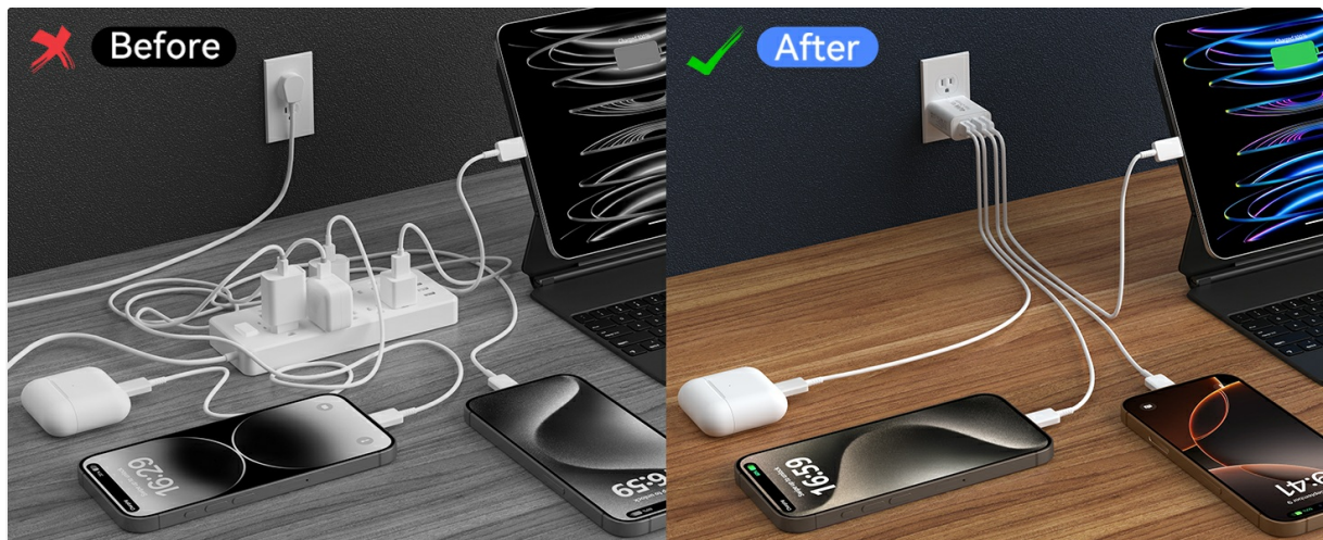
Image: A visual comparison demonstrating how the single compact Duloch 4-port charger replaces multiple individual chargers, reducing clutter.