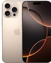
iPhone 16 Series