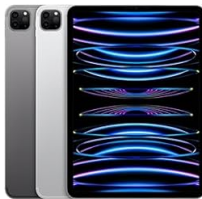
iPad Pro Series