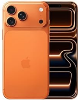
iPhone 17 Series