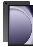
Galaxy Tab Series

Image: A chart illustrating the universal compatibility of the charger with various phone and tablet models, including iPhone and Samsung Galaxy devices.