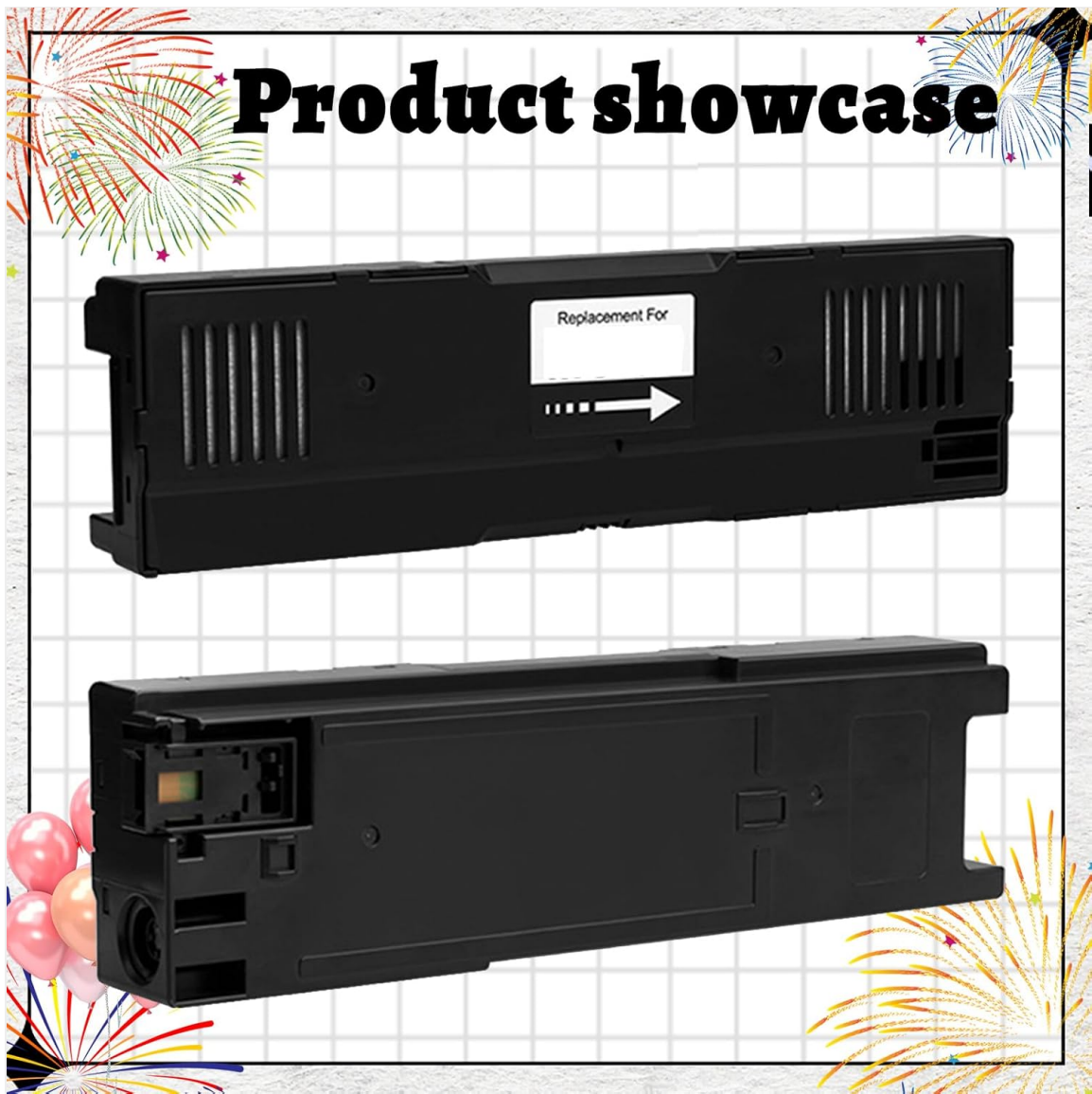
Figure 2: The AOKLEY MC-G01 waste collection cartridge.