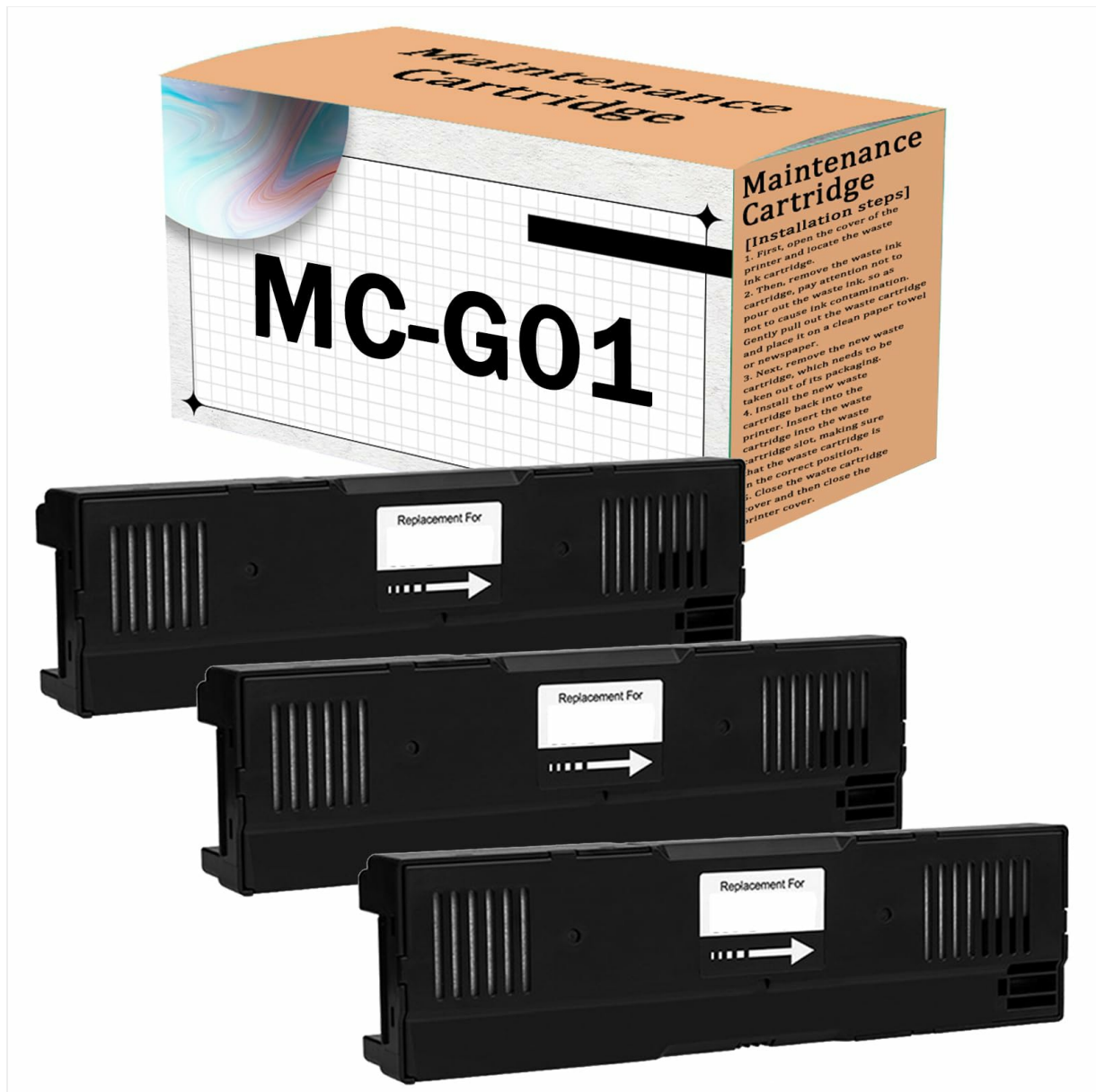
Figure 1: Compatible Canon MAXIFY printer models for the MC-G01 waste collection cartridge.