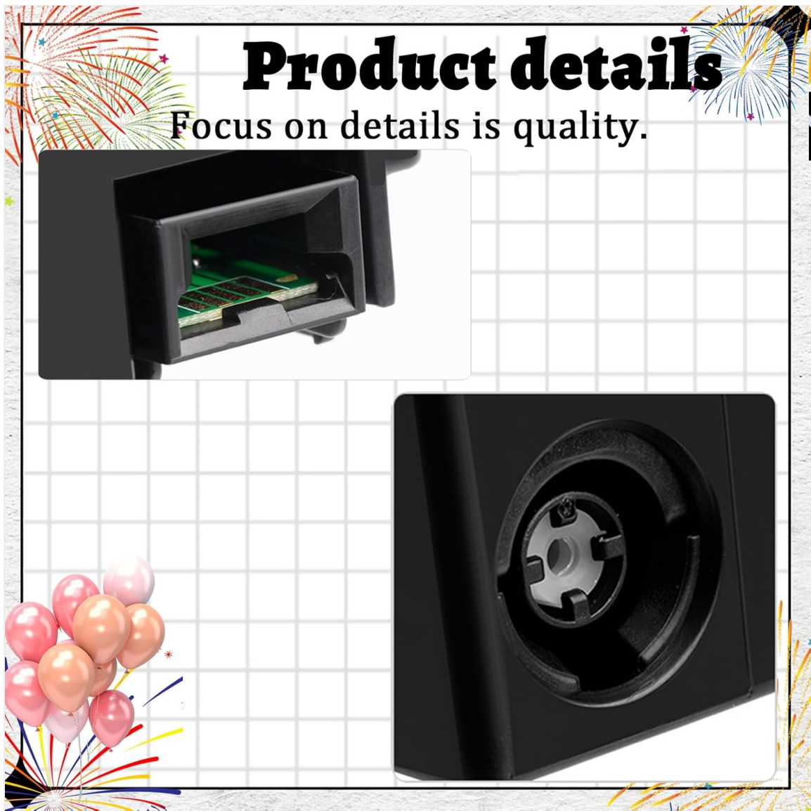
Figure 3: Detailed views of the cartridge's chip and port for proper installation.