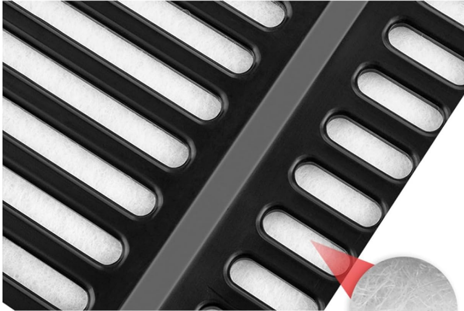
Figure 4: Internal structure showing the quality ink-absorbing pads.

Adding high adsorption sponge. Strong adsorption, stable and smooth.