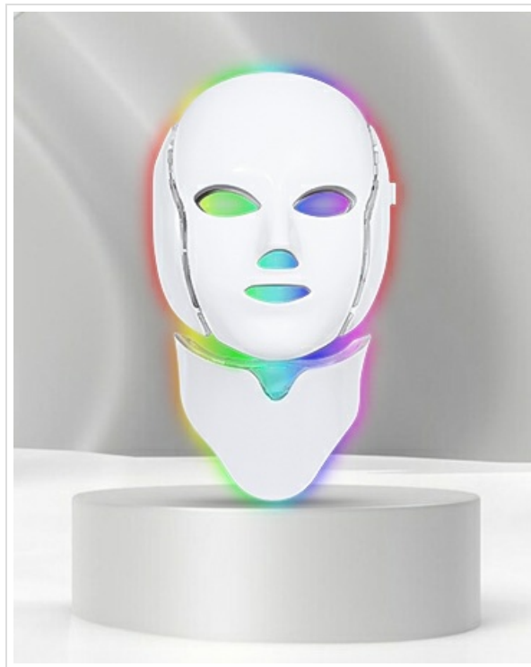
Image: The EVFOFO LED Face Mask with its detachable neck piece, ready for use.