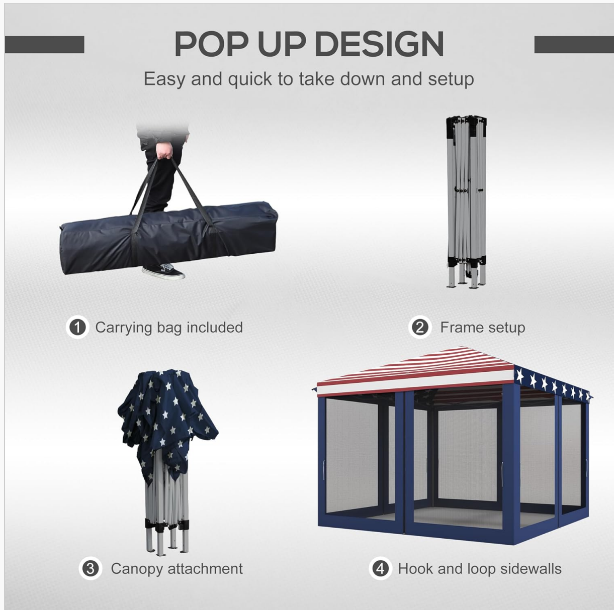
Image 4.1: Visual guide illustrating the four main steps for setting up the pop-up canopy tent, from removing it from the carry bag to attaching the sidewalls.