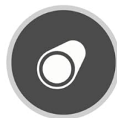
Steel Frame Support