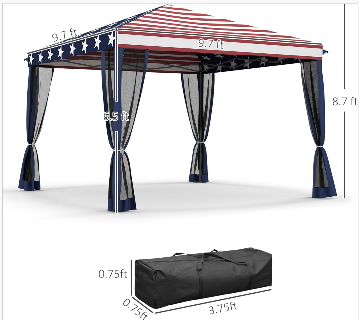
Image 9.1: Dimensional overview of the canopy tent when assembled and the compact size of its carry bag for transport.