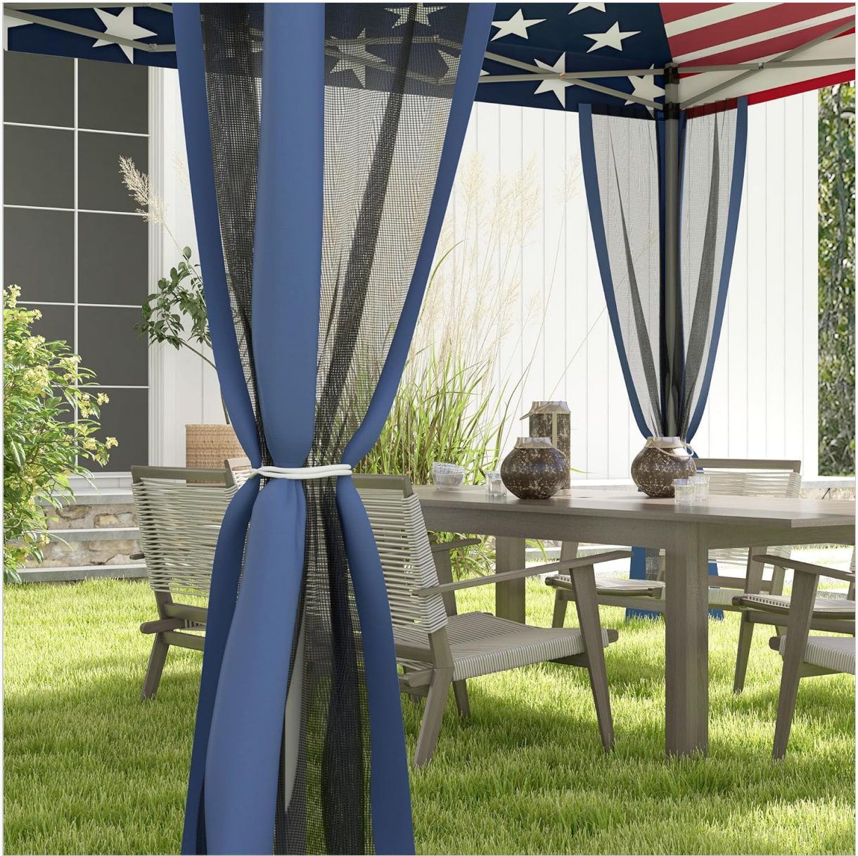
Image 5.1: A mesh sidewall rolled up and secured to a canopy leg, demonstrating how to keep the entrance open.