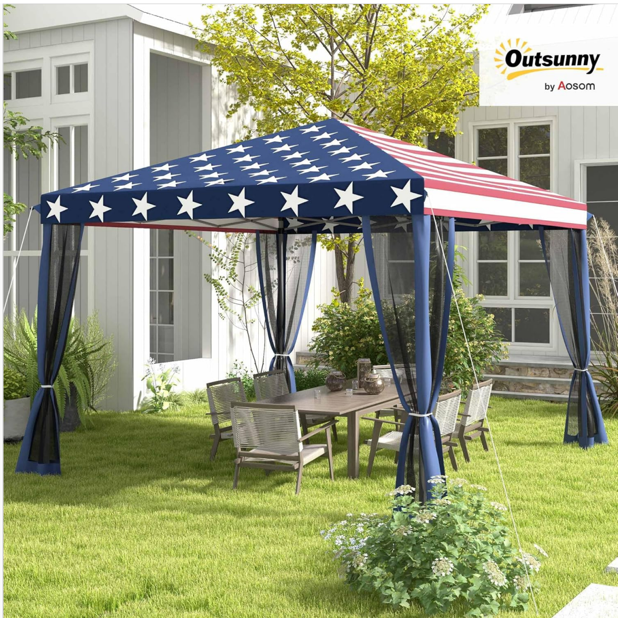
Image 1.1: The Outsunny 10' x 10' Pop Up Canopy Tent with Netting, shown fully assembled in a garden setting, providing shade over an outdoor dining area.