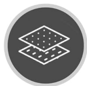
Silver Coated Oxford