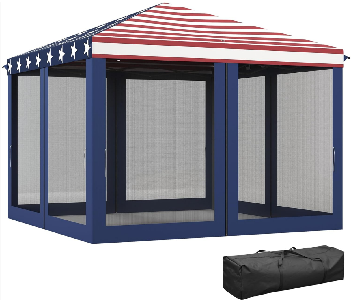
Image 6.1: The Outsunny 10' x 10' Pop Up Canopy Tent with Netting alongside its compact black carry bag, demonstrating portability.