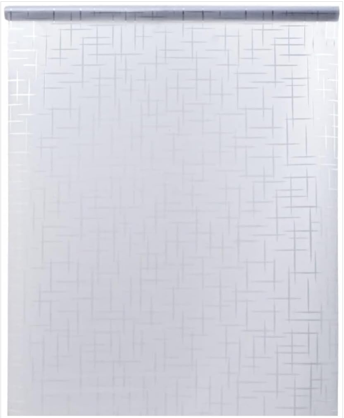
Image: The vidaXL Frosted Star Pattern Window Film, shown in its rolled-up state before application.