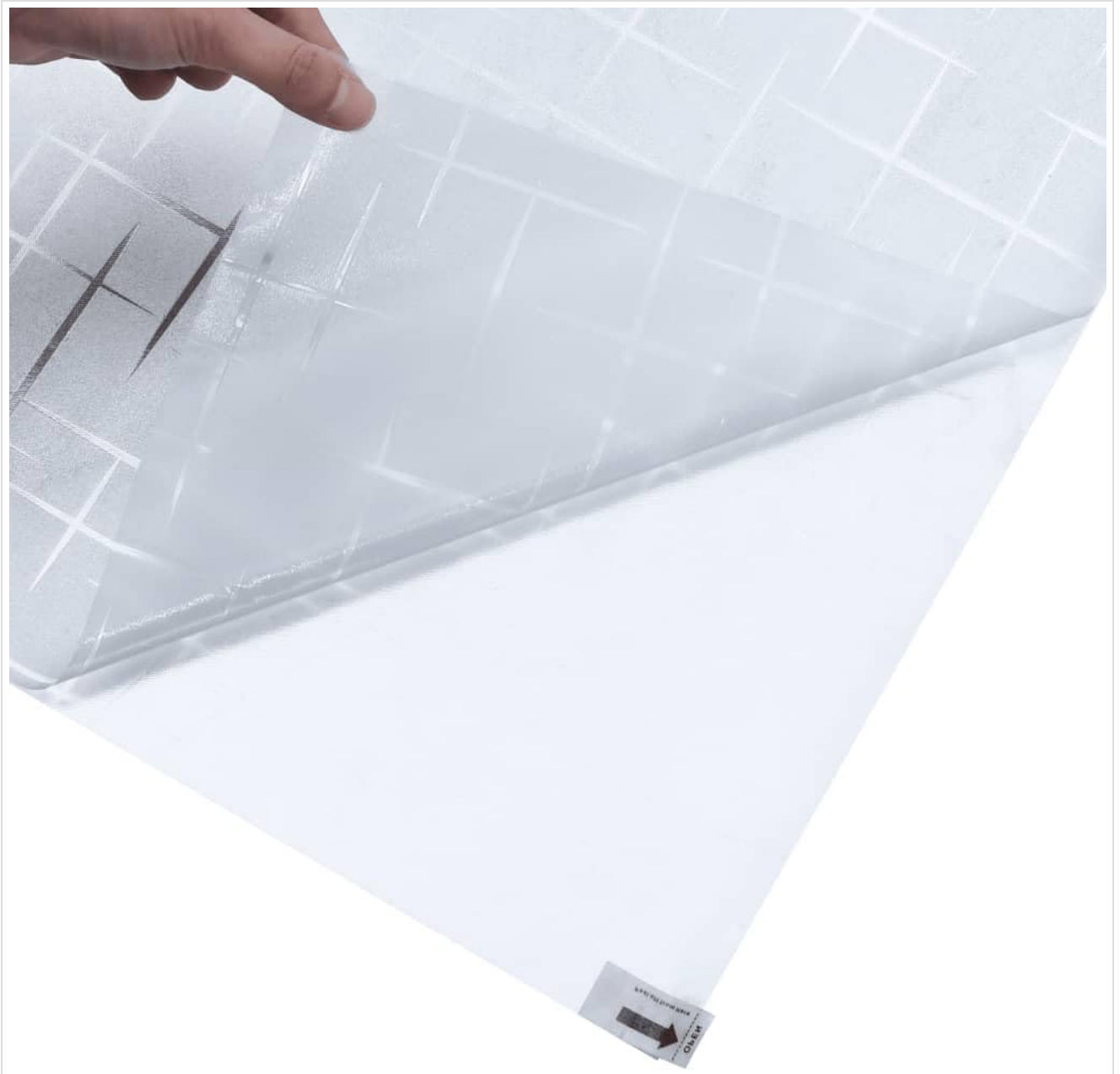
Image: A hand demonstrating the process of peeling off the clear protective backing layer from the window film, revealing the adhesive side.

pieces of tape on opposite sides of a corner to help separate the backing film from the main window film. Peel off the entire backing film. This step is critical for the static cling to work.