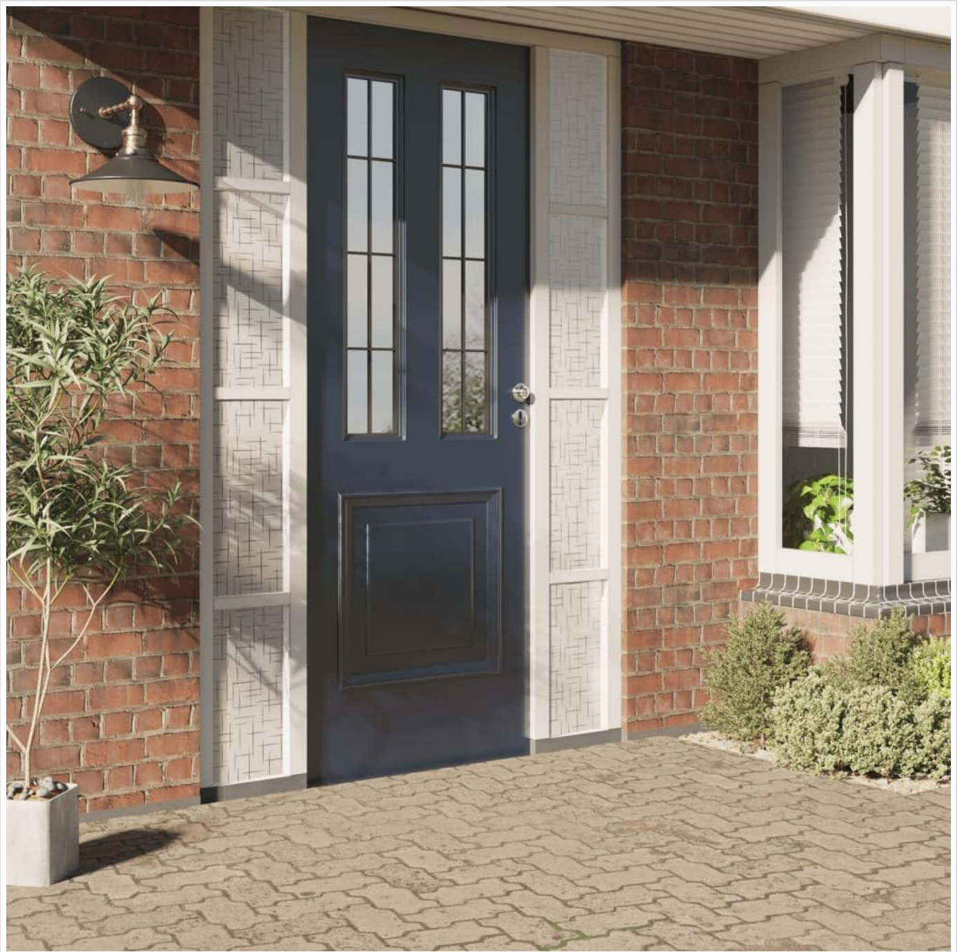
Image: The vidaXL Frosted Star Pattern Window Film successfully applied to a glass panel on a door, showcasing its decorative and privacy-enhancing effect.