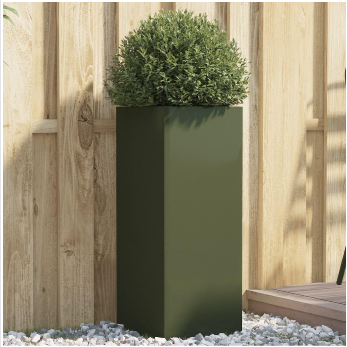
Image: A vidaXL Raised Planter, olive green, positioned in a garden next to a wooden fence, containing a small, round green plant. The planter is surrounded by white decorative stones.