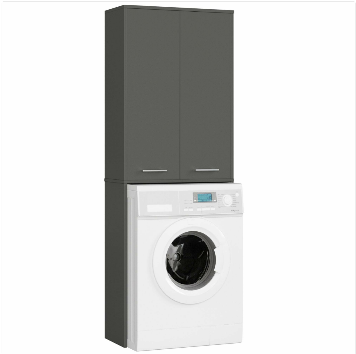
Figure 2: The AKORD FIN 180 cabinet installed above a washing machine.