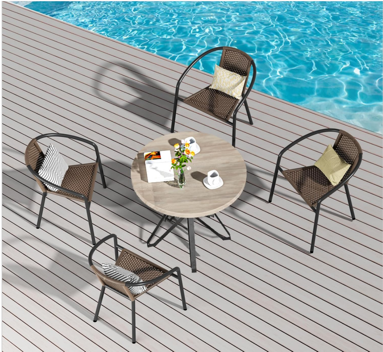
Figure 4.1: Example of chairs in an outdoor dining setting.

Your browser does not support the video tag.