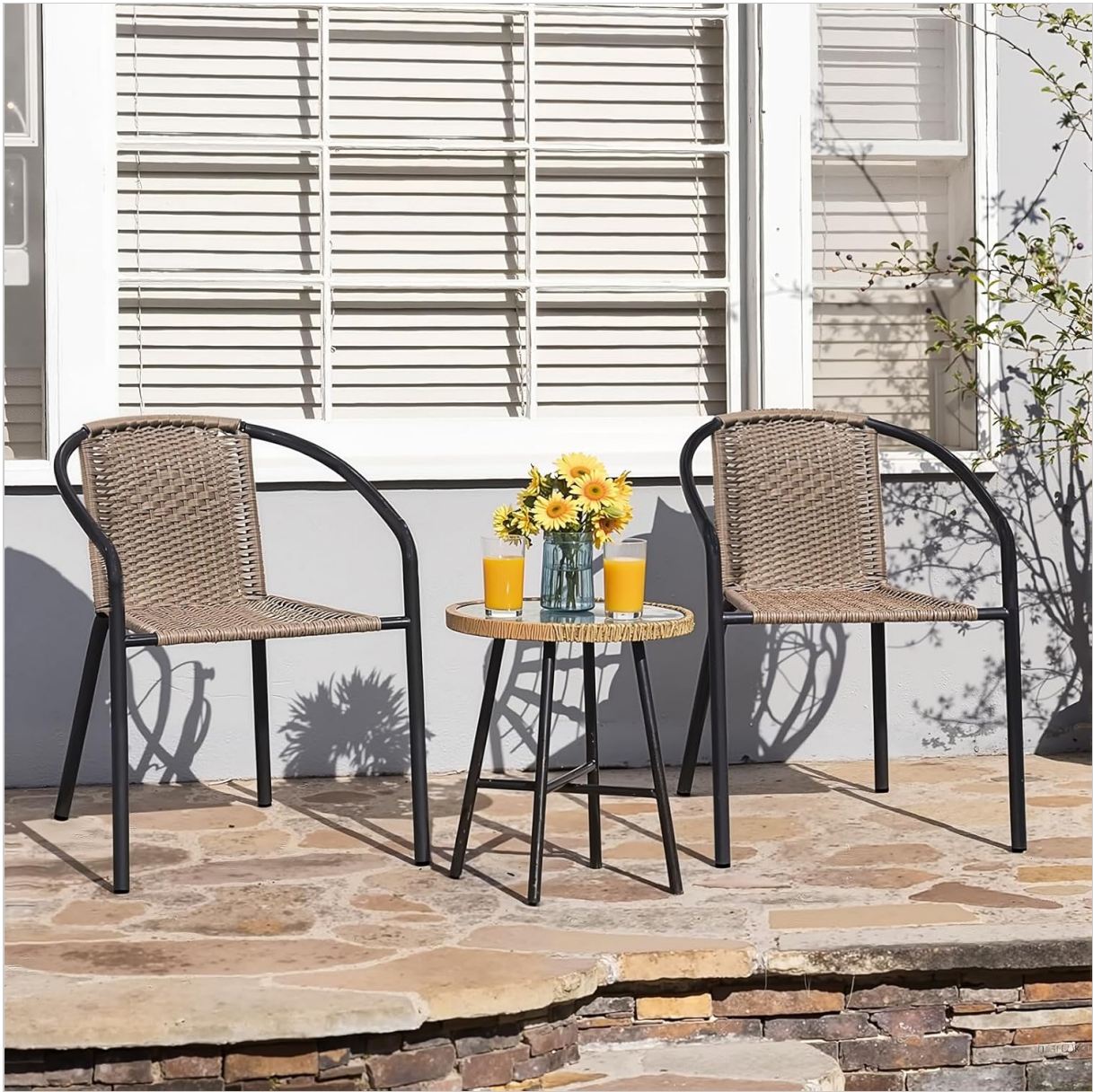
Figure 2.4: Comparison illustrating the rust-resistant powder-coated steel frame of gaildon chairs.