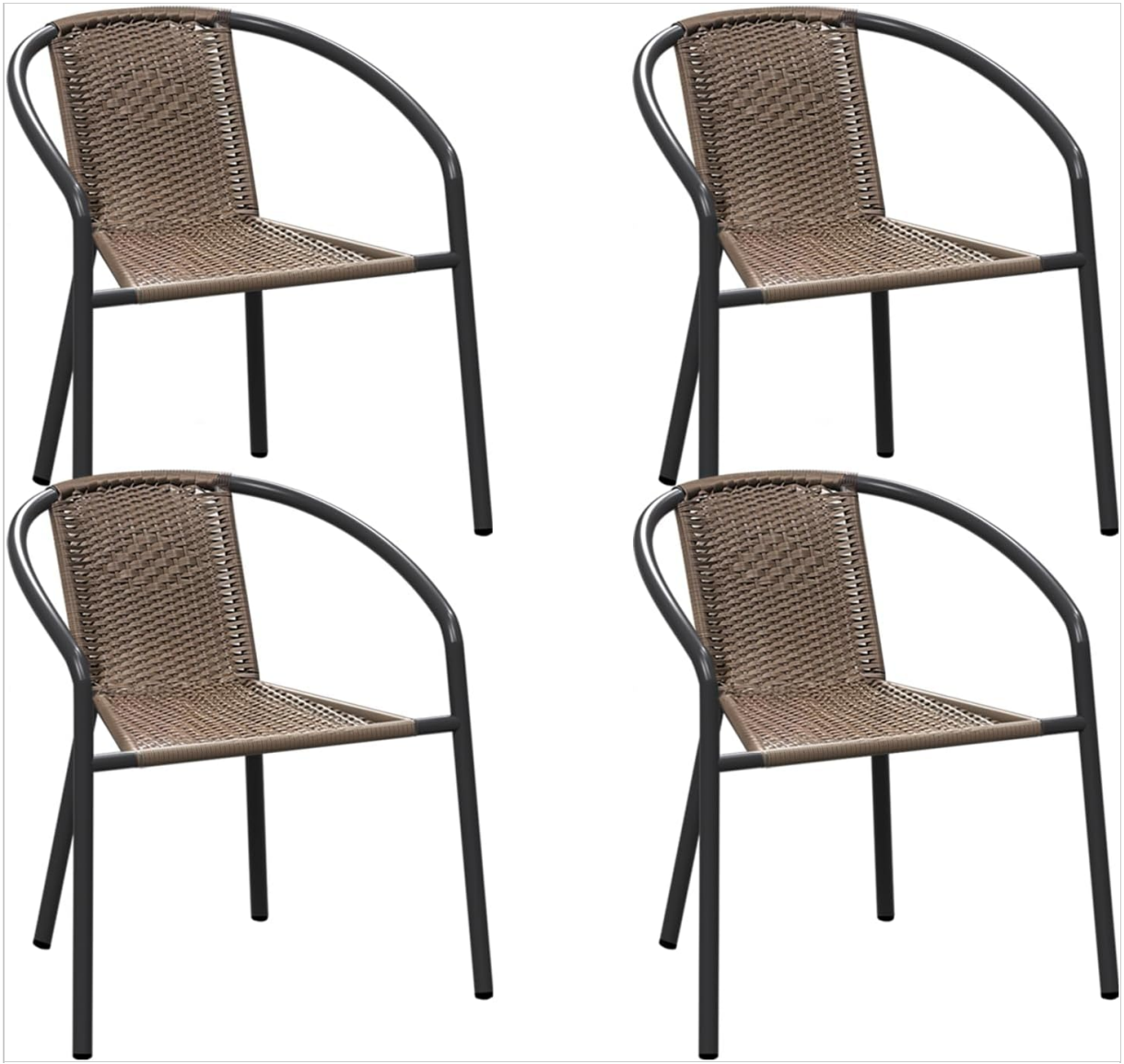
Figure 2.1: Set of four gaildon outdoor patio dining chairs.