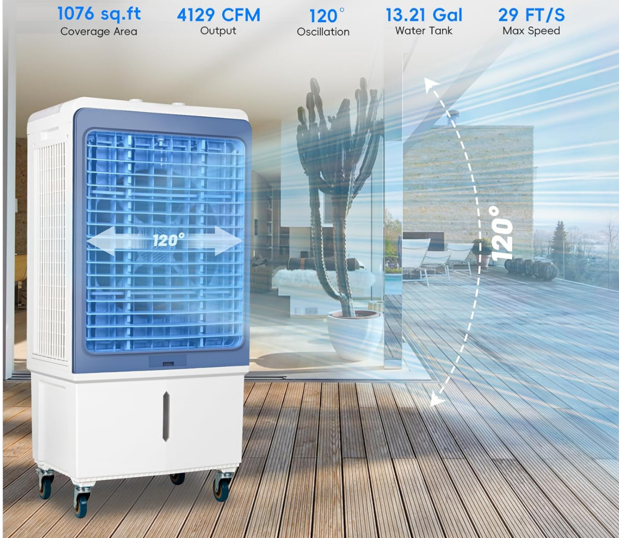
Image 3.1: Visual representation of the cooler's widespread coverage and oscillation capabilities.