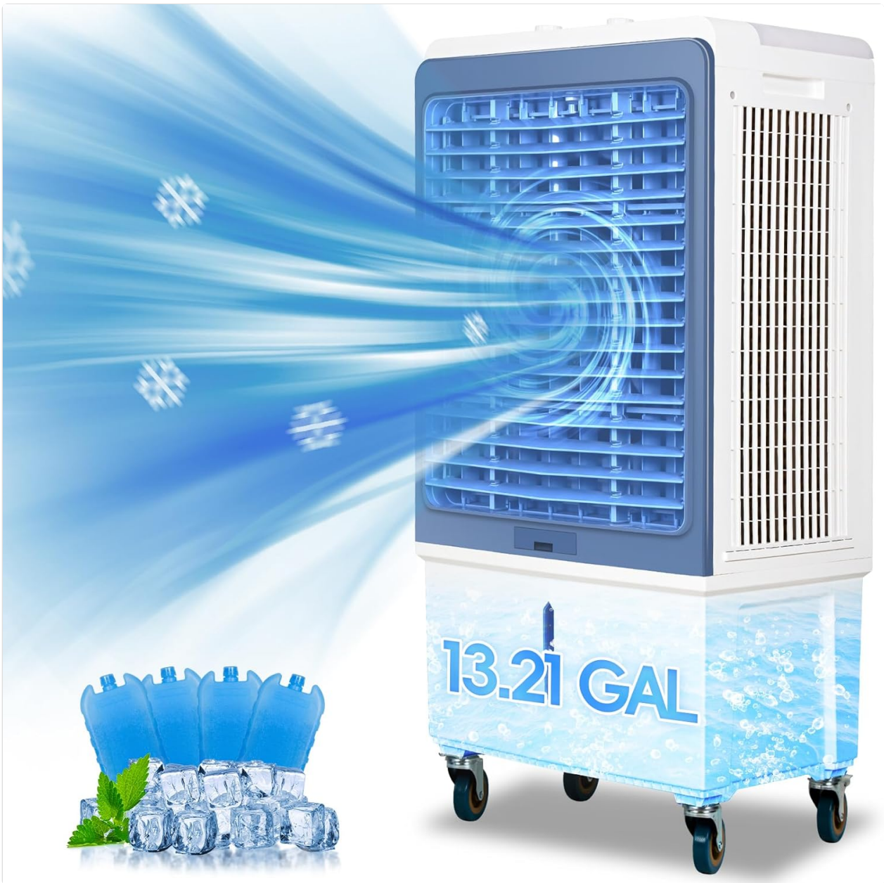
Image 1.1: The ACHAZEL 4,129 CFM Evaporative Air Cooler, demonstrating its powerful airflow and large 13.21-gallon water tank capacity.