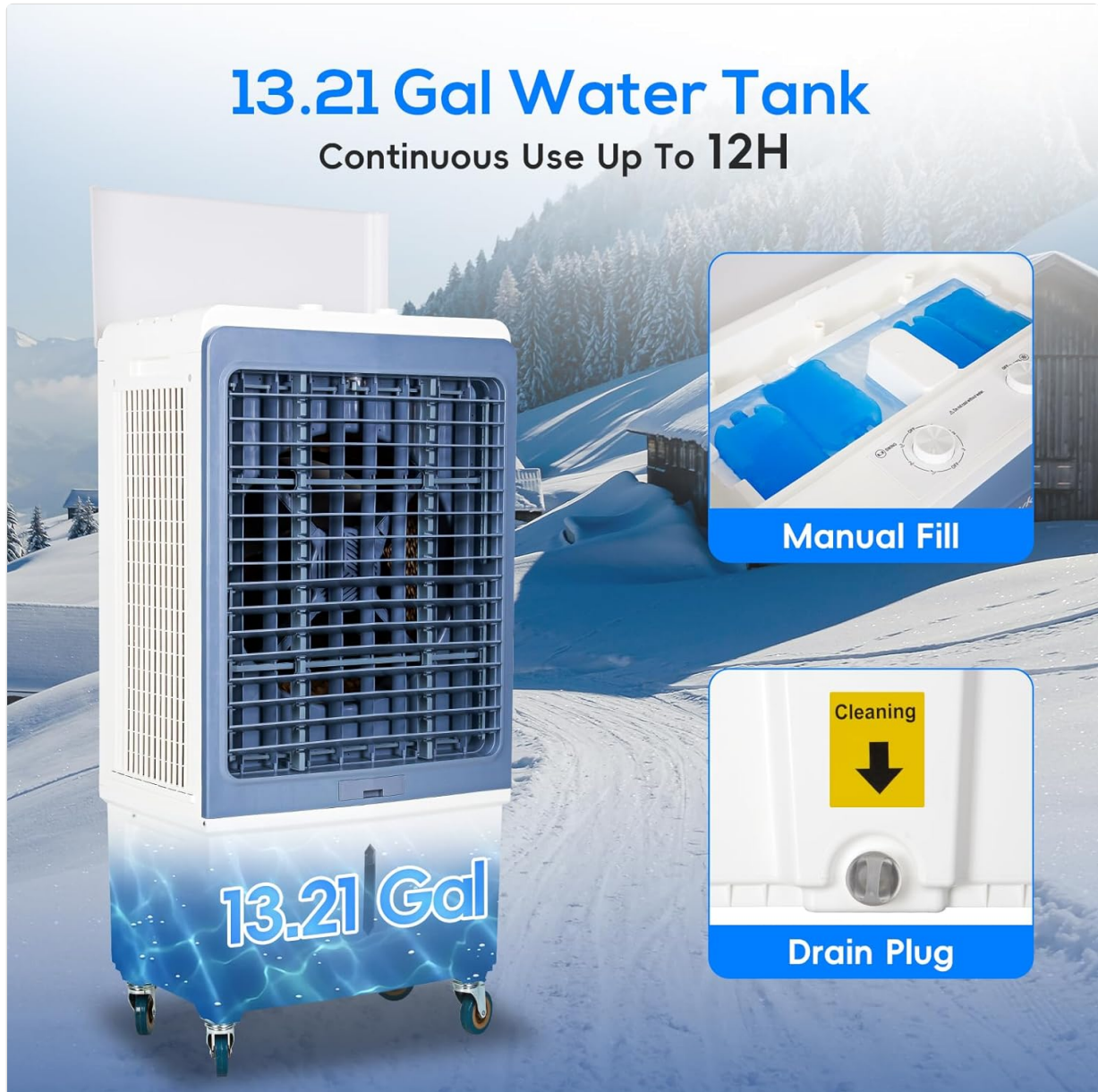
Image 5.1: The 13.21-gallon water tank and manual fill points for water and ice packs.