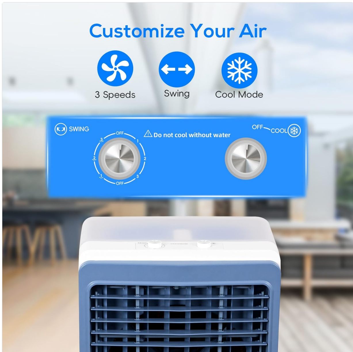
Image 6.1: Close-up of the control panel with knobs for speed/swing and cooling mode.