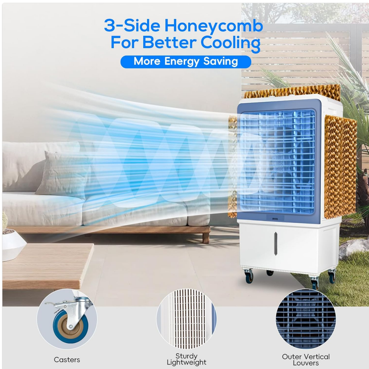
Image 7.1: The 3-side honeycomb cooling pads, essential for the evaporative cooling process.