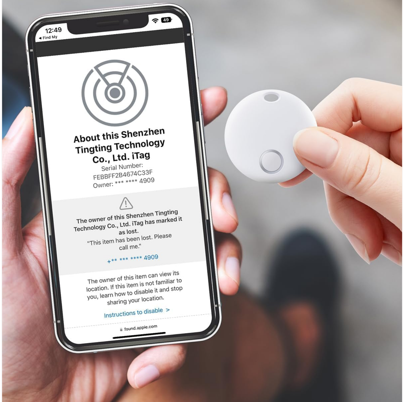
Image: Activating Lost Mode allows others to identify your contact information if they find your tag.

Retrieve owner information via the "Identify Found Item" feature on "Find My"