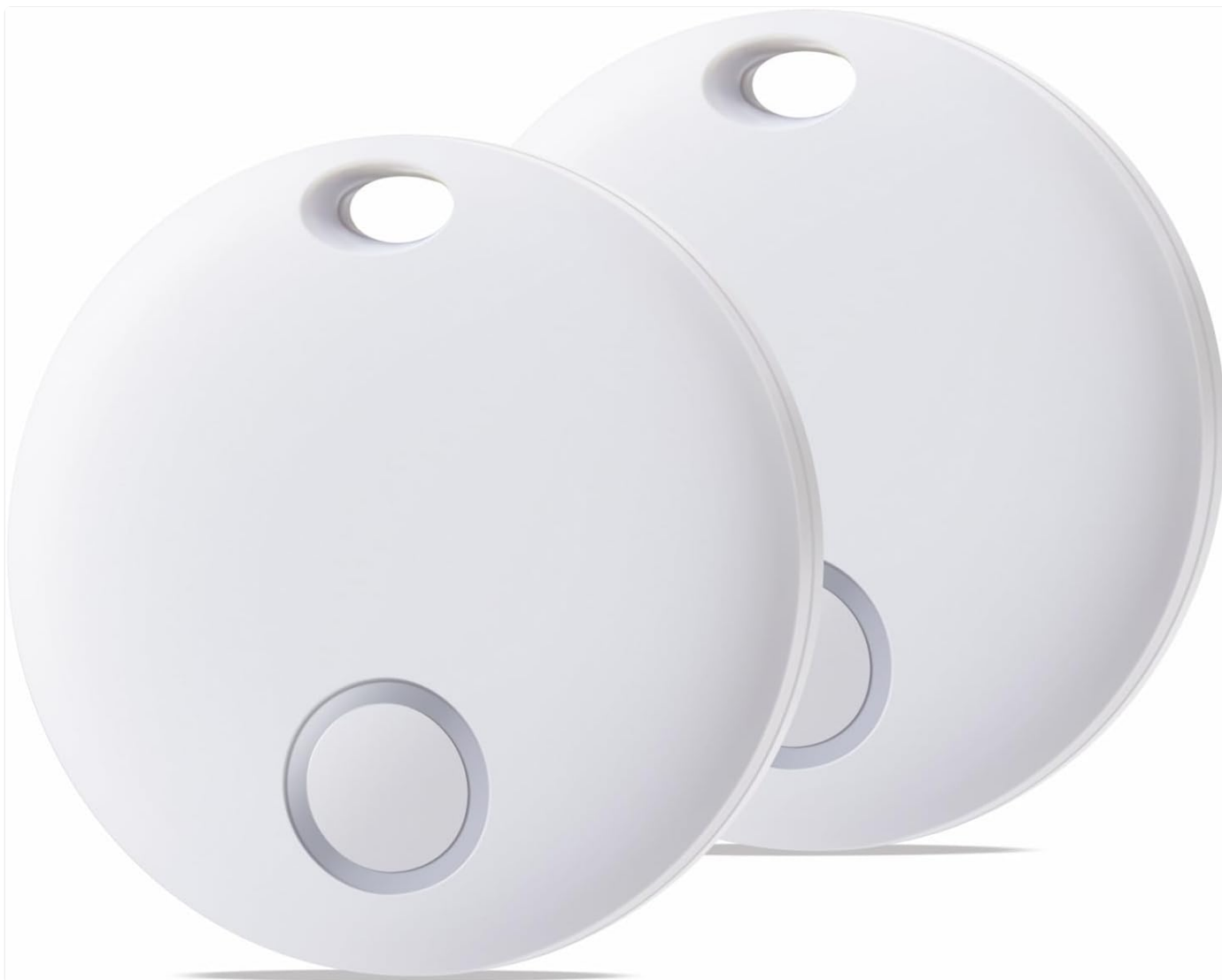
Image: Two Reyke Smart Tags, showcasing their compact, circular design in white.

Your browser does not support the video tag.