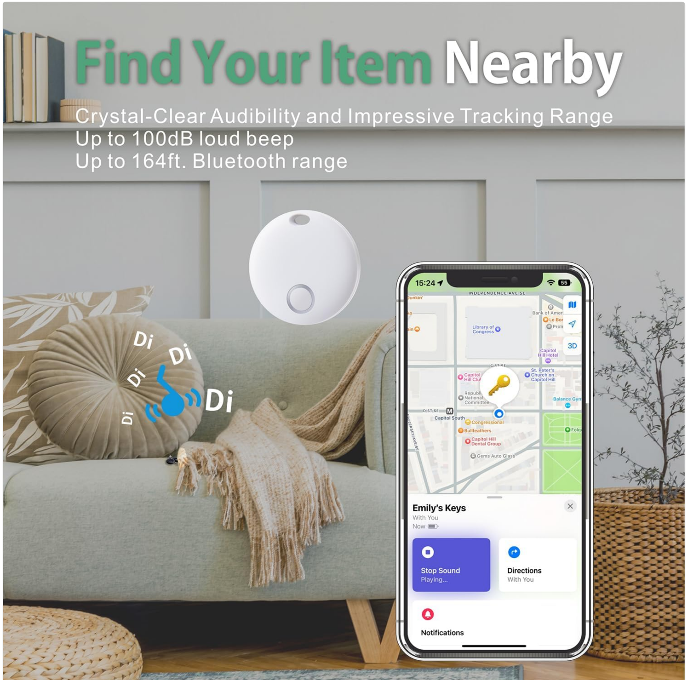
Image: Use the 'Play Sound' feature in the Find My app to locate your Reyke Smart Tag when it's nearby.