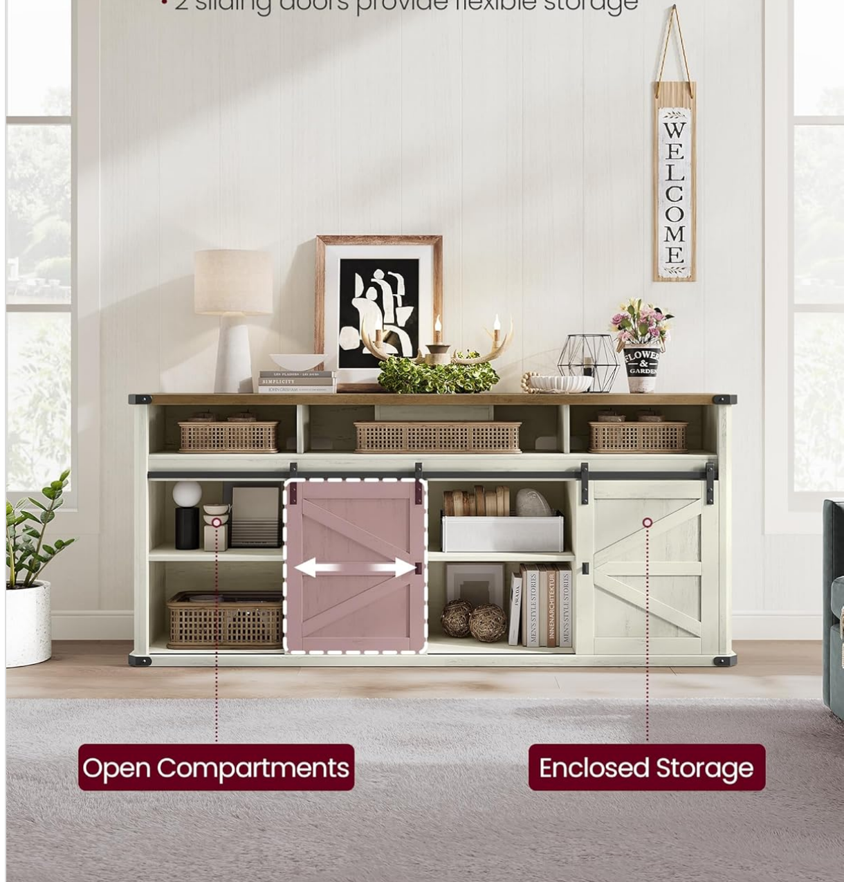
Figure 3: Roomy and Versatile Storage. This image demonstrates the 10 compartments and the functionality of the two sliding barn doors, which can be moved to cover either the central or side sections of the TV stand.