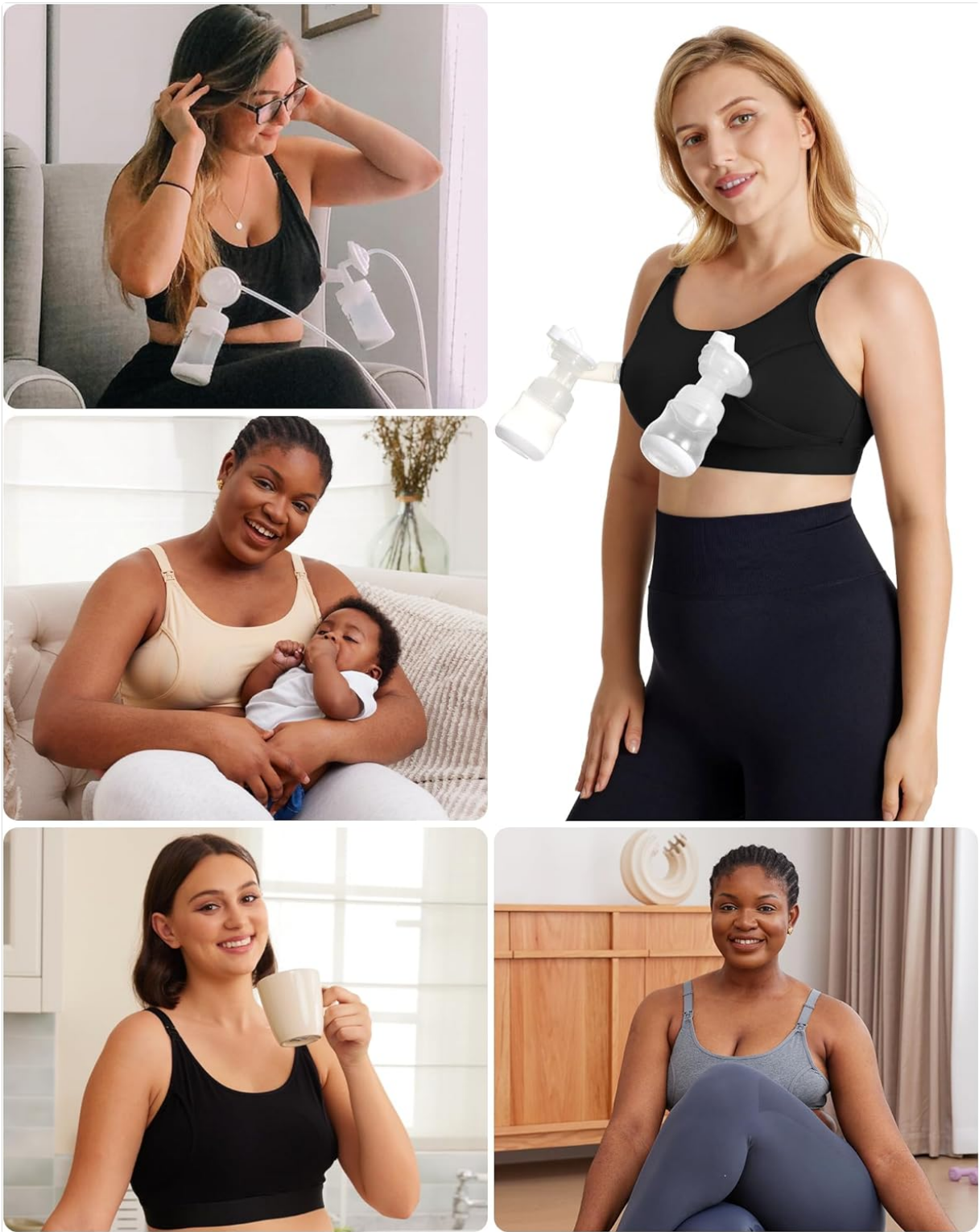
Figure 6: Visual representation of the Momcozy Pumping Bra Size Chart.