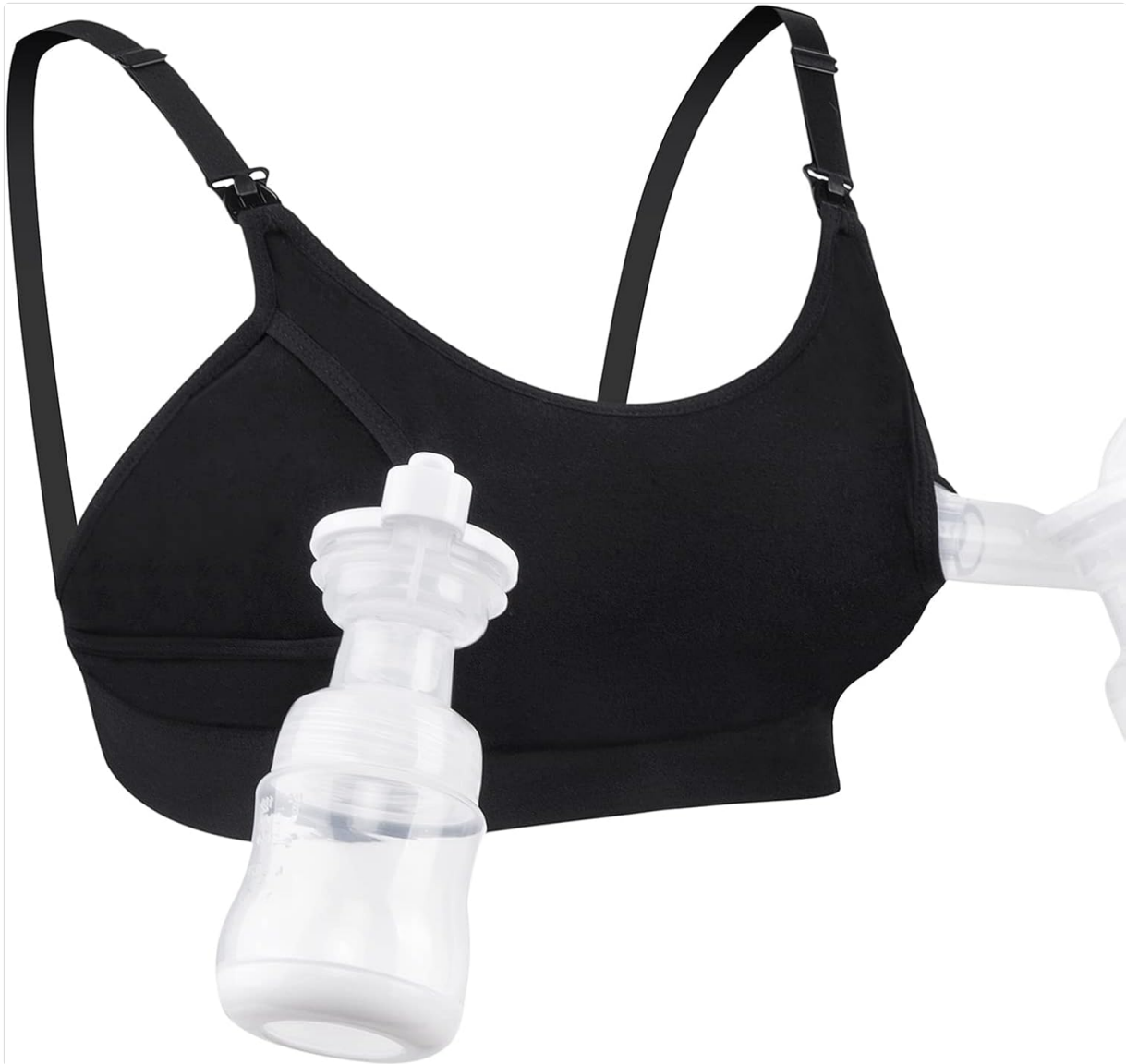
Figure 3: The bra with breast pump flanges correctly inserted into the openings.