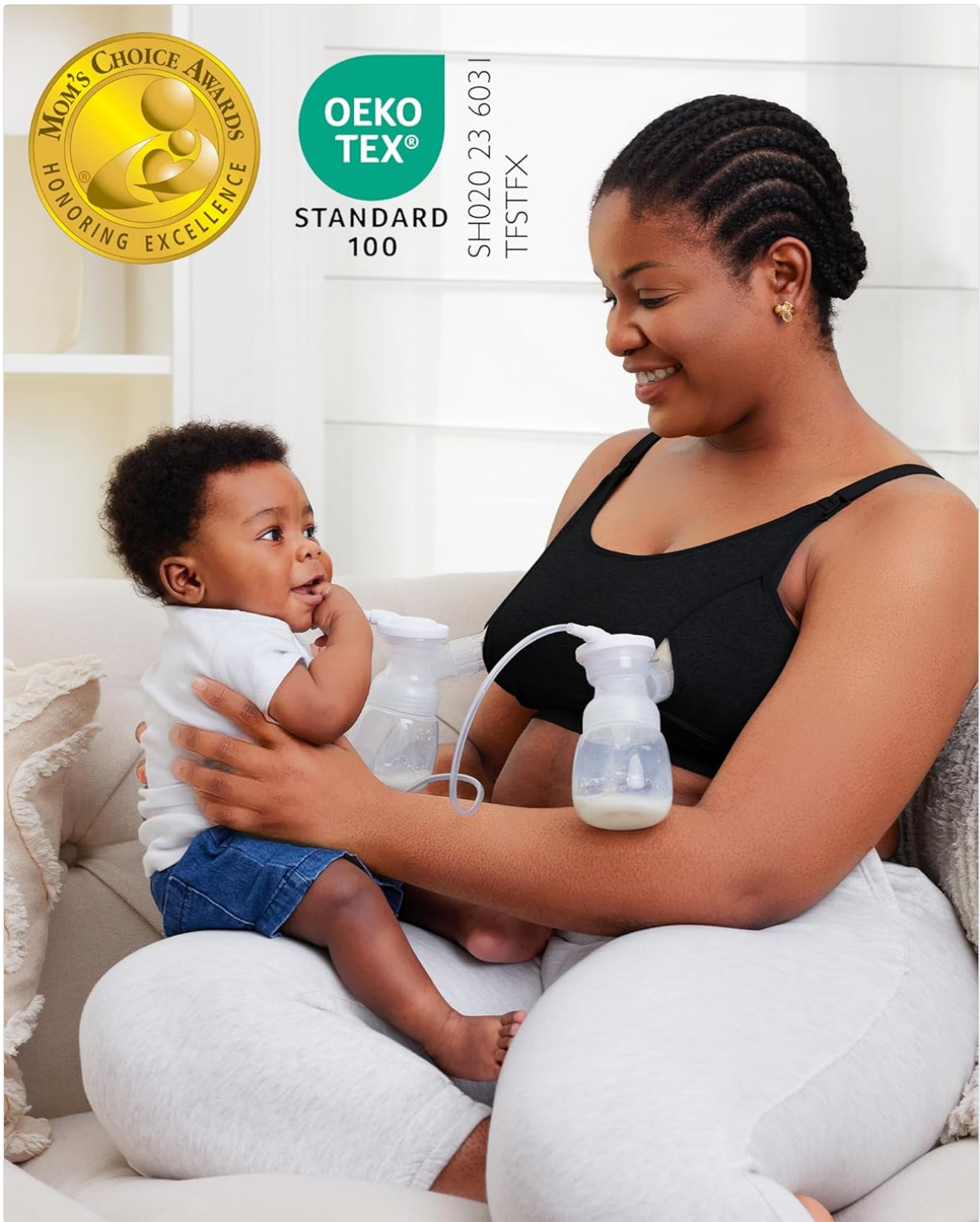
Figure 5: A user demonstrating nursing access with the detachable clip.