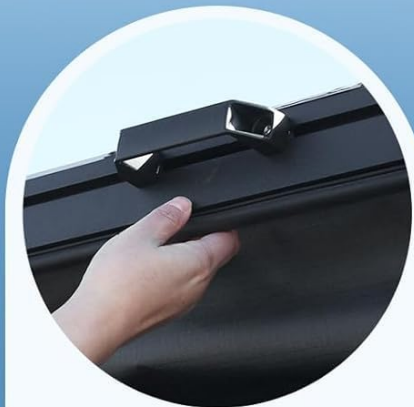
Gently push it up