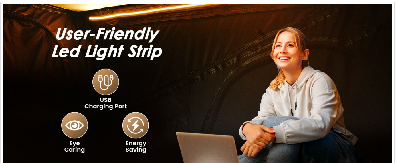
Figure 7: User-Friendly LED Light Strip. This image illustrates the integrated LED light strip, emphasizing its USB charging port, eye-caring illumination, and energy-saving benefits.