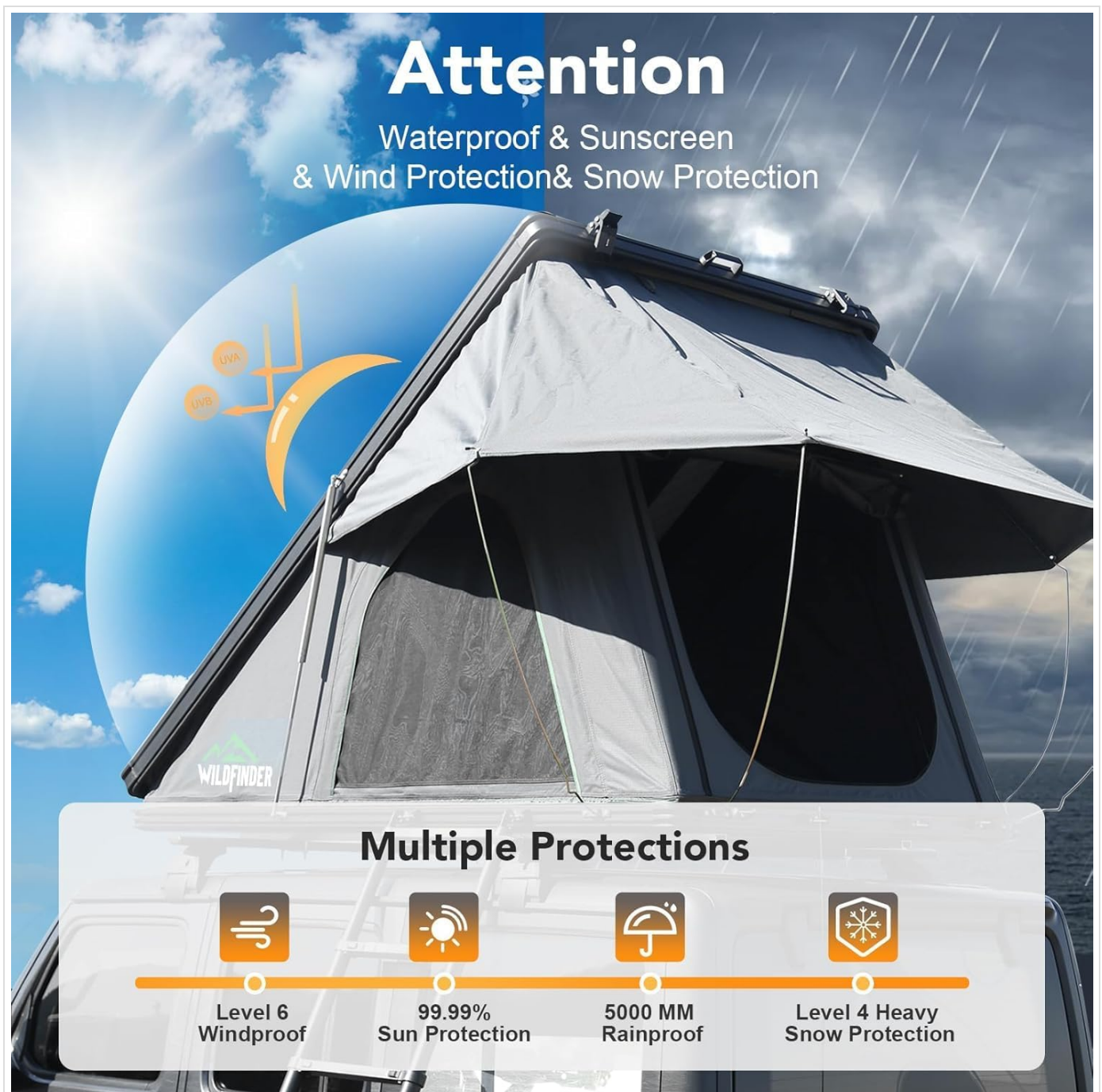
Figure 4: Multiple Weather Protections. This image visually represents the tent's resilience against wind (Level 6), sun (99.99% protection), rain (5000 MM), and snow (Level 4 Heavy Snow Protection).