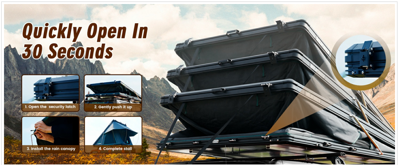
Figure 2: Quick Opening Steps. This image displays a four-step process for quickly opening the tent: 1. Open the security latch, 2. Gently push it up, 3. Install the rain canopy, 4. Complete the setup.