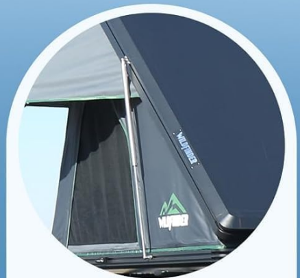
316 Stainless Steel Support Rod