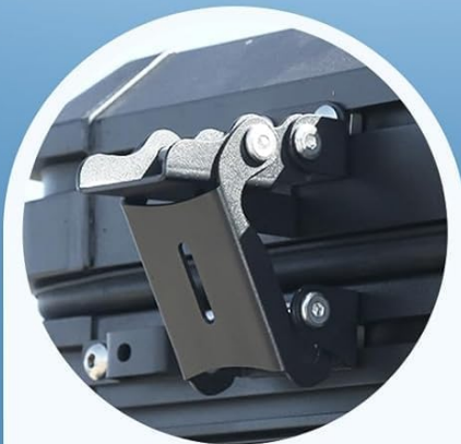
316 Stainless Steel Latch