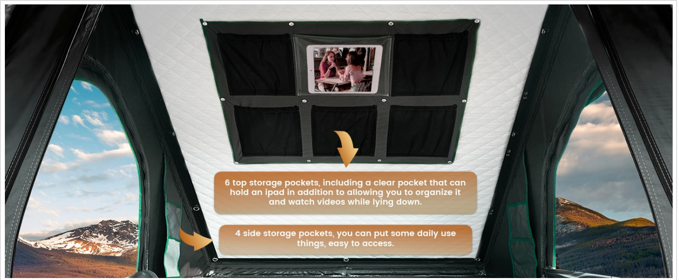
Figure 5: Interior Storage Pockets. This image highlights the tent's internal organization with 6 top storage pockets (one clear for a tablet) and 4 side storage pockets.