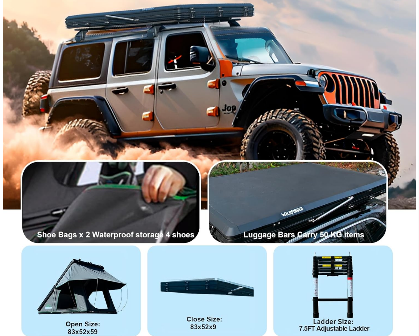
Figure 10: Accessories and Dimensional Data. This image provides a visual overview of the tent's accessories, including shoe bags and the ladder, along with key dimensions for the open tent (83x52x59 inches), closed tent (83x52x9 inches), and ladder (7.5 FT).