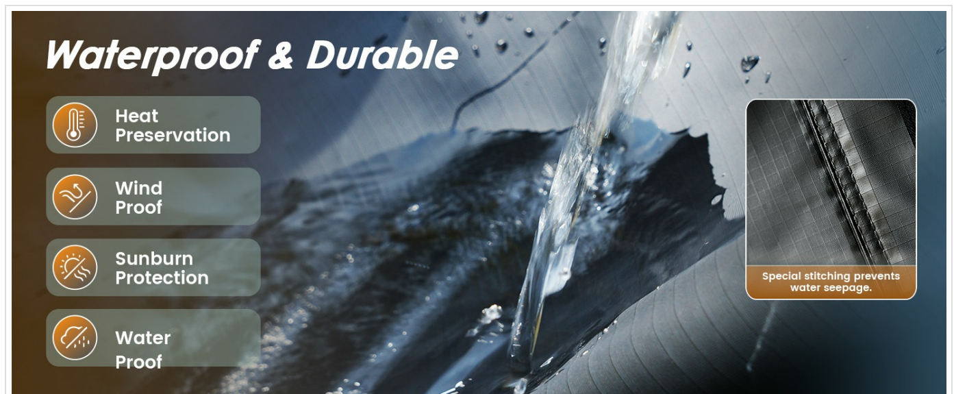
Figure 8: Waterproof and Durable Construction. This image illustrates the tent's waterproof fabric and highlights the special stitching designed to prevent water seepage.