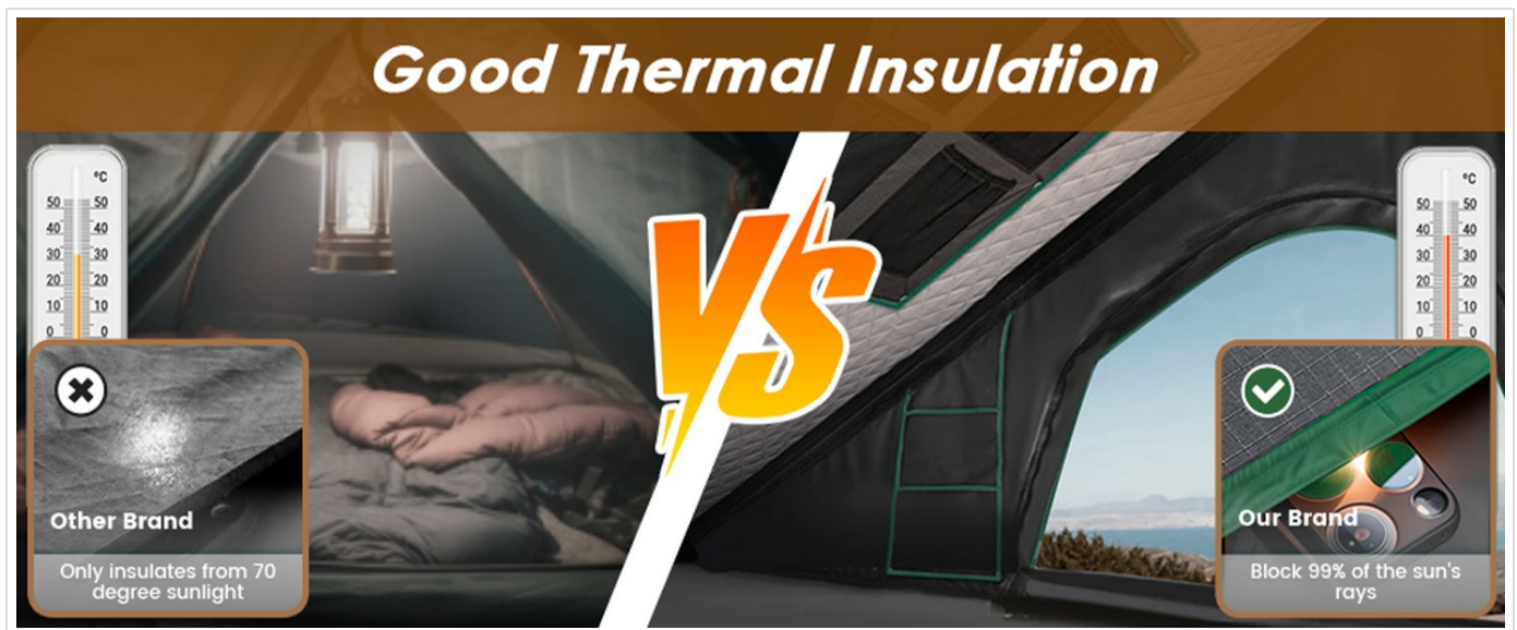
Figure 9: Good Thermal Insulation. This image compares the thermal insulation of the WildFinder tent ('Our Brand'), showing it blocks 99% of the sun's rays, versus another brand that only insulates from 70 degrees sunlight.