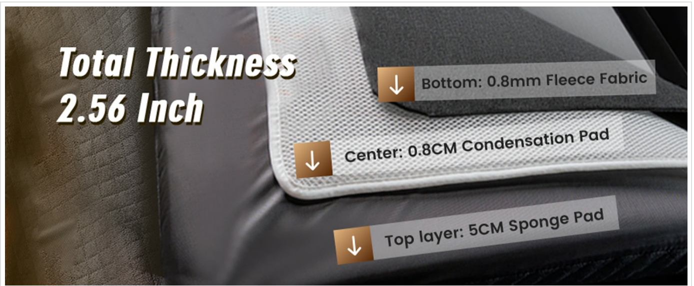
Figure 6: Triple Thick Bed Construction. This image details the mattress layers: 0.8mm fleece fabric, 0.8cm condensation pad, and 5cm sponge pad, for a total thickness of 2.56 inches.